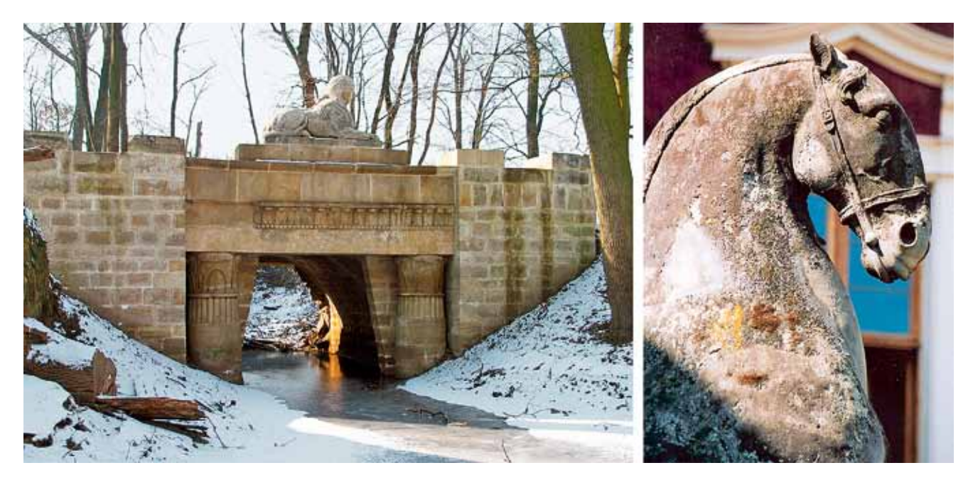
Fig. 3: Preventive restoration impact on the damage of monuments in the Château Veltrusy Park, near Prague: a) an appropriately restored bridge and sculpture, b) incorrectly restored sculpture