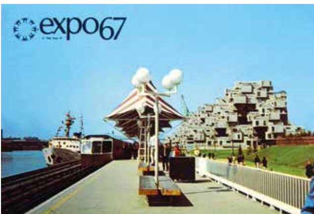
Fig. 6: Postcard view of Habitat 67 from the Expo Express station

The main issue of conservation and adequate use affects two of the main iconic components of Expo 67 – Place des Nations and the former US pavilion. Place des Nations, a modernist ceremonial plaza designed by André Blouin, a disciple of Auguste Perret, was the main entrance of Expo where all international dignitaries were formally welcomed