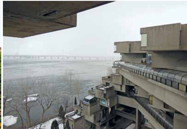
Fig. 2: Habitat 67 – view towards St. Lawrence River and Victoria Bridge showing the defining architectural texture of the complex and some evidence of exposed concrete reinforcement

The 50th anniversary of ICOMOS and of ICOMOS Germany as transdisciplinary professional organisations coincides with the 40th anniversary of Héritage Montréal, a not-for-profit civil society foundation created to encourage the protection of the built, landscape and urban heritage of Canada’s historic metropolis, and to bridge the various gaps and divides to achieve it.