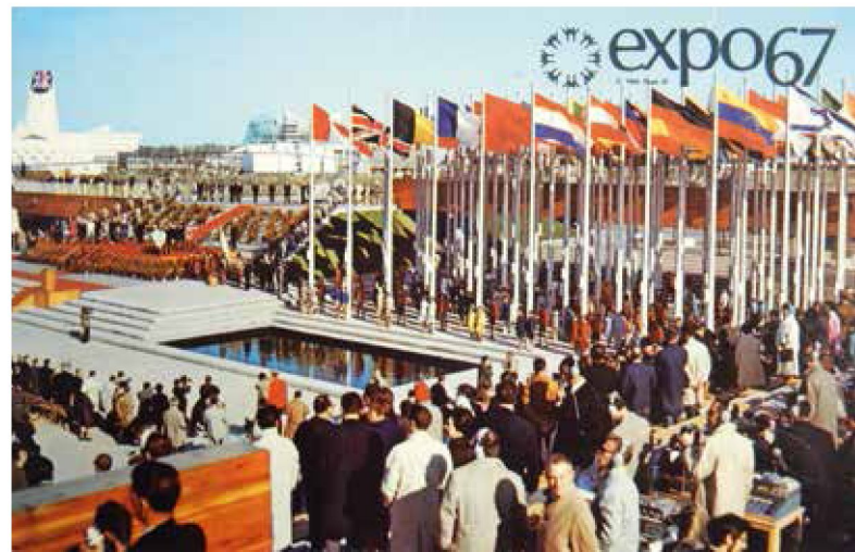
Fig. 8: Expo 67 Postcard view of Place des Nations, the main ceremonial square of Expo with the British and French pavilions in the background

building’s exterior and site and the interior of Units 1011 and 1012 – were designated by the Minister of Culture as a monument historique (now immeuble patrimonial classé or classified heritage property since the new Cultural Heritage Act of 2012) under the Province of Quebec’s cultural heritage legislation. In the current Canadian constitution, this is the highest protection status available for such a privately owned property. It results from a formal request submitted by Héritage Montréal on April 18, 2002, the International Day of Monuments and Sites dedicated that year by ICOMOS to the heritage of the 20th century, as suggested at the meeting held in Montreal in September 2001 to define an ICOMOS strategy for the heritage of the Modern era. While the national and international heritage registers count a growing number of protected 20th century architectural landmarks, the case of Habitat 67 can be directly linked to ICOMOS strategic thinking.