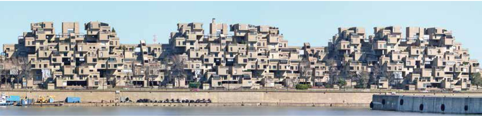
Fig. 12: Habitat 67 as seen from Montreal's port

by National Committees like ICOMOS Germany could be a guiding one for ICOMOS to move on these heritage issues in our future world.