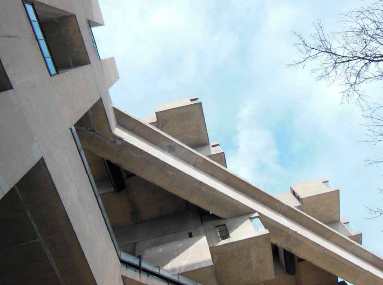
Fig. 10: Habitat 67 – View of one of the three mega-arches facing the river with indication of concrete conservation issues under the walkways

The nature of Habitat 67's ownership is an important dimension of its conservation and care today. The heritage value seen by the local, national and international specialised communities is also shared by its owners and inhabitants who also have to address its market or real estate tax value and challenging maintenance and repair issues.