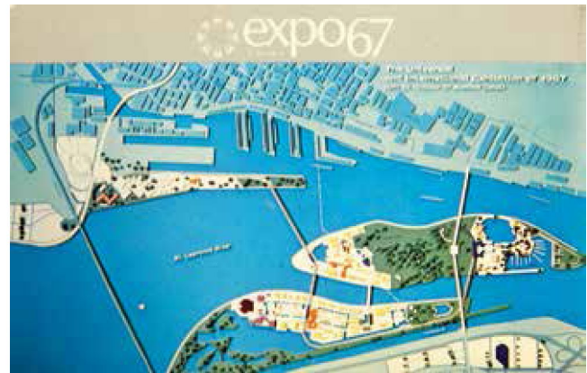
Fig. 3: Expo 67 – Postcard view of the whole site in relation to the river and the city

Besides Habitat, the heritage of Expo 67 remains important in quantity and significance although the issue of maintenance and adequate use is increasingly a concern. Major changes to the site of Expo occurred when part of Île Notre-Dame was reshaped to accommodate installations for the