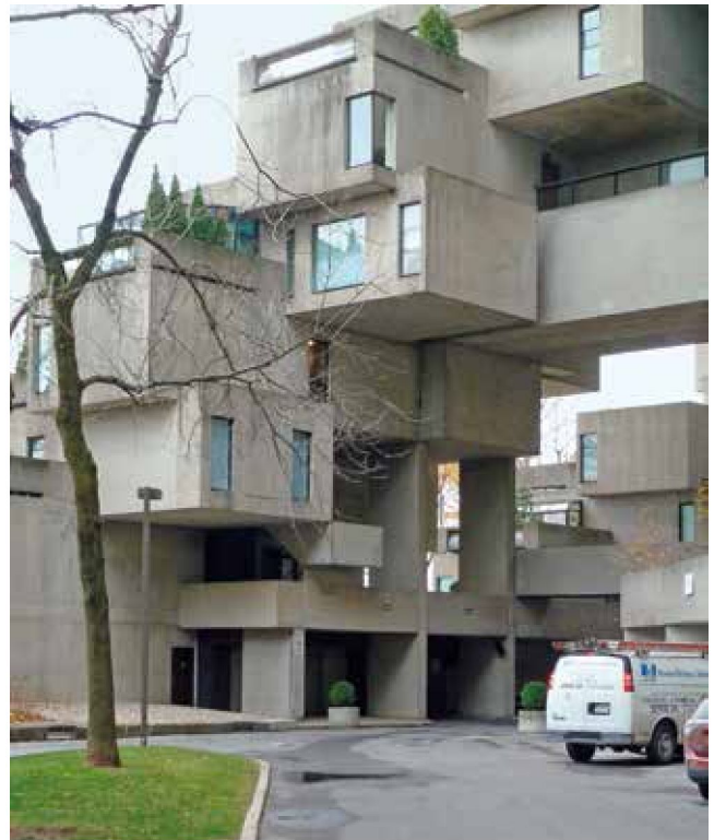
Fig. 11: Habitat 67 – detail 2016

There are procedural requirements. For example, although this would not contribute to the effective protection of Habitat 67, a Federal commemorative designation for Habitat 67 seems to be a precondition, which requires the owner’s con-