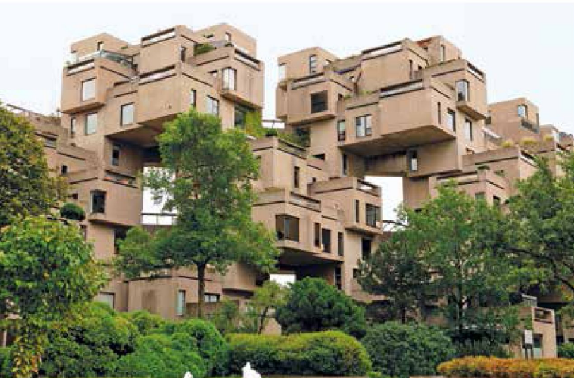
Fig. 1: Montréal, Habitat 67, designed by Moshe Safdie, built 1966–67 for the world’s Fair Expo 67

In that context, Héritage Montréal chose to upgrade its website with a platform to engage professionals and citizens in supporting heritage as a key part of the future of the metropolitan area (see platform at www.heritagemontreal.org ). In 2015, such a tool cannot turn a blind eye to experience from previous successes and one of these “InspirActions” is the protection of Habitat 67, the very subject of this presentation. It results from a strategic connection between an