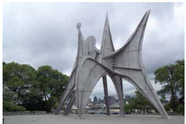
Fig. 7: Alexander Calder: Man, Three Disks, sculpture de Calder, Île Sainte-Hélène, Montréal

Among the remaining landmarks, the US pavilion with its 76 m-diameter geodesic dome by Robert Buckminster Fuller is the most spectacular, even if it lost its transparent envelope on May 20, 1976, in a fire prompted by repair