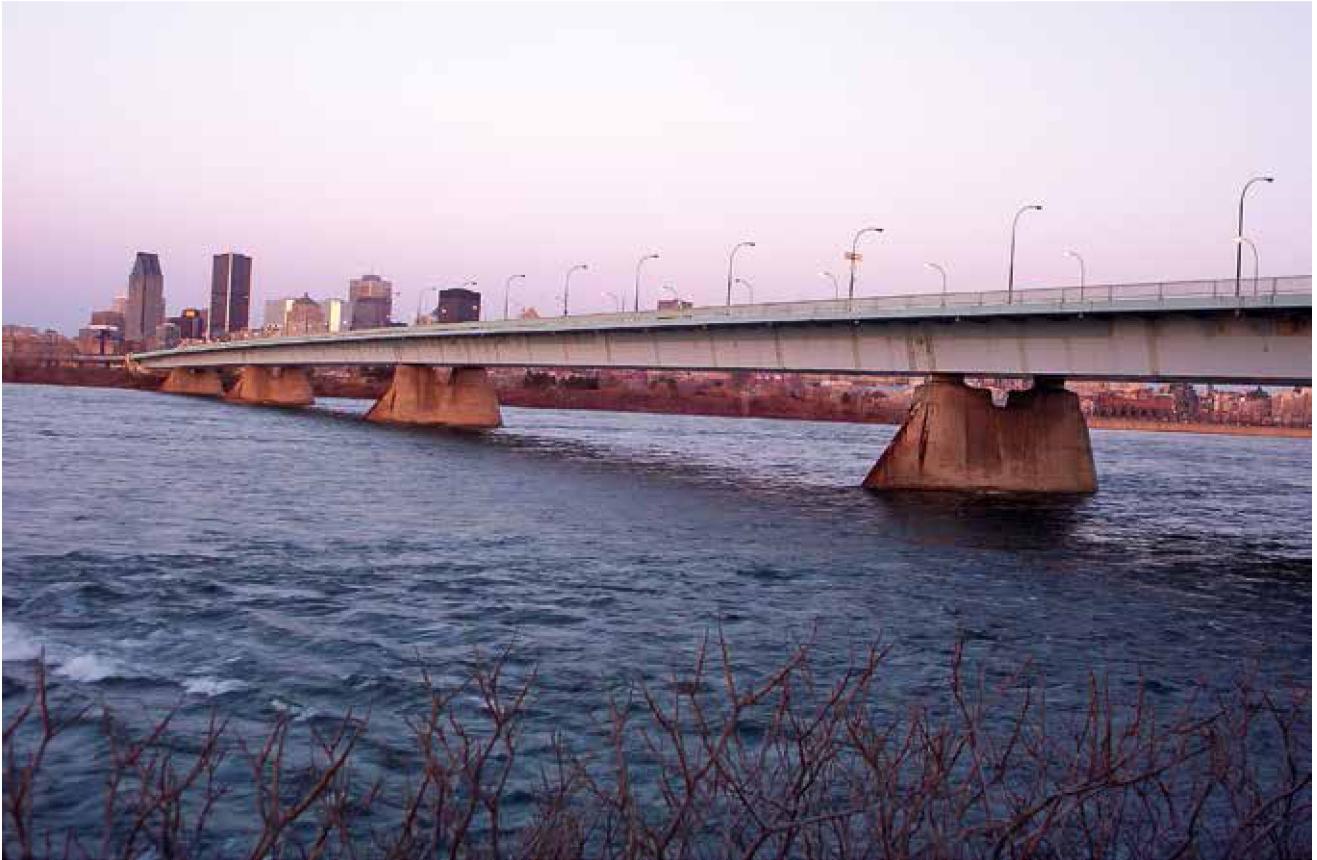
Fig. 5: Montreal, Pont de la Concorde

as part of the park for the 1992 celebration of Montréal's 350th birthday. It now faces the river and Old Montreal and is the anchor of the Piknik Electronik, a 21st century festive happening (fig. 7).