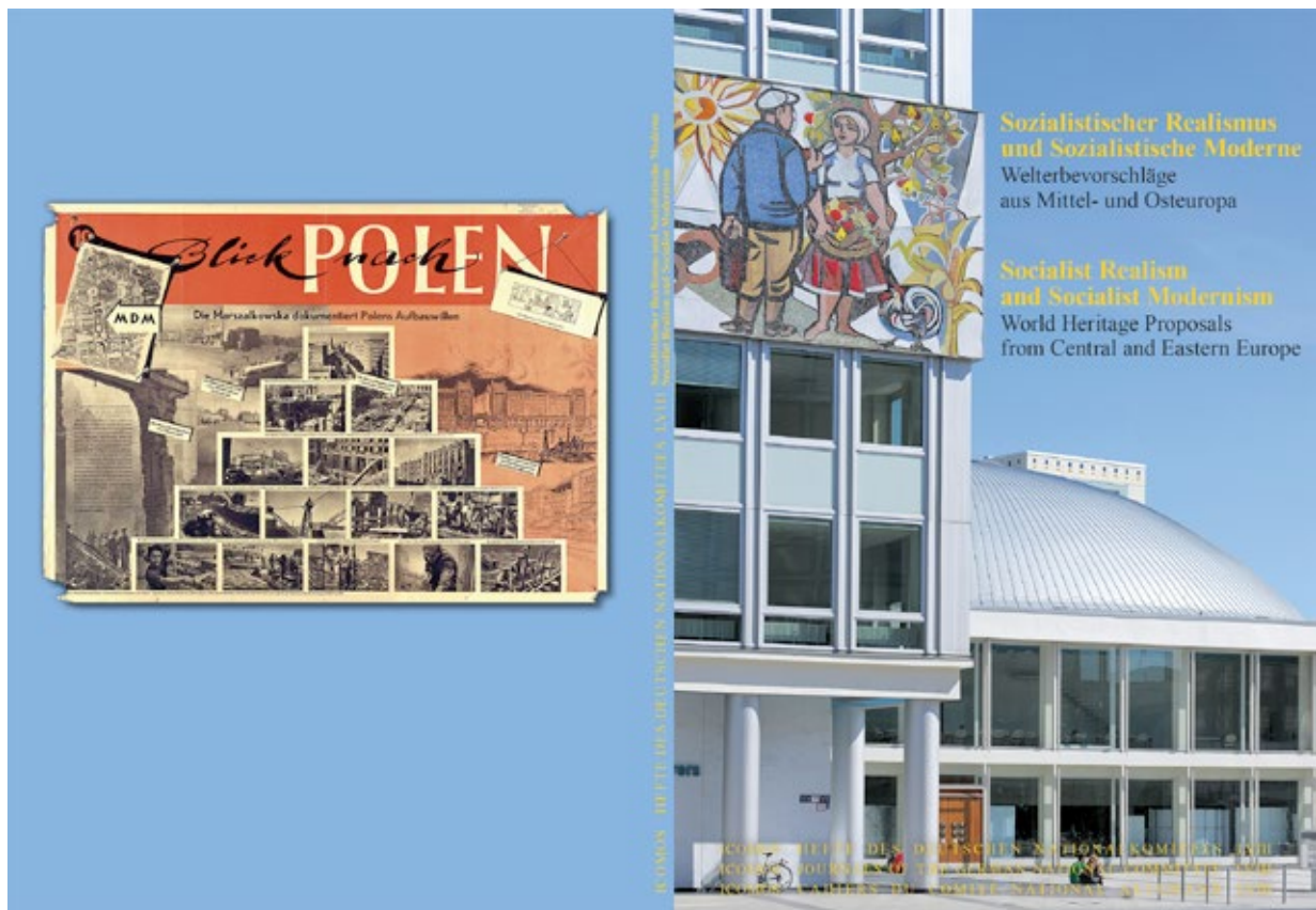
Cover of the ICOMOS publication “Socialist Realism and Socialist Modernism. World Heritage Proposals from Central and Eastern Europe”, 2013