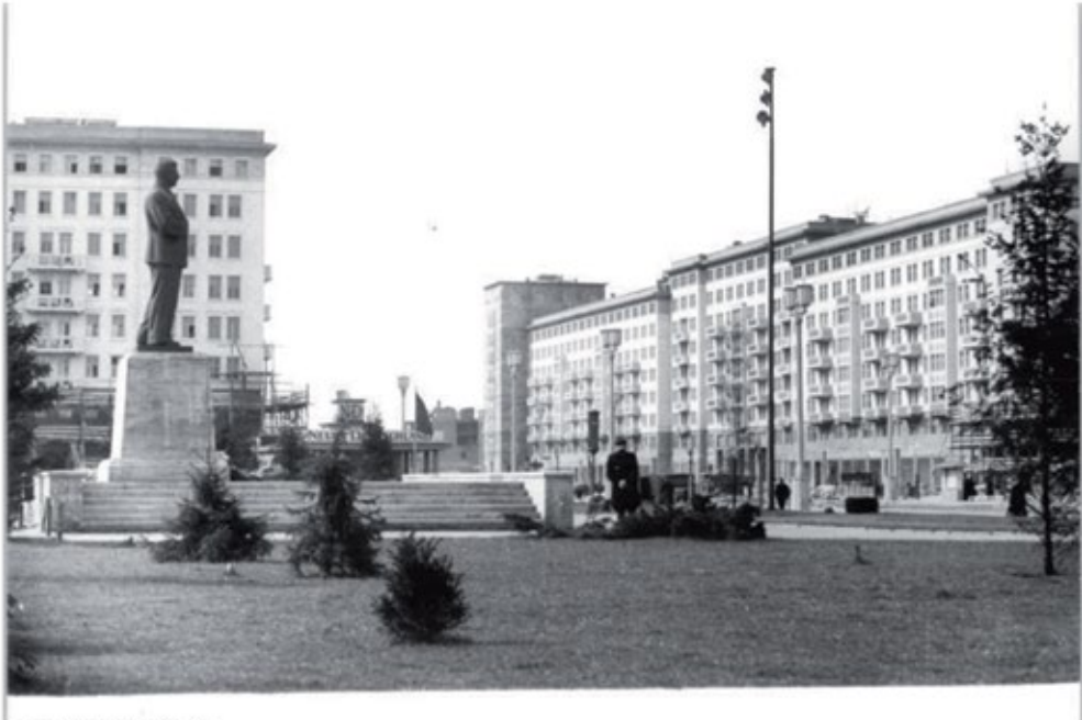
19. April 1953