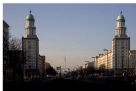
Berlin, Karl Marx Allee