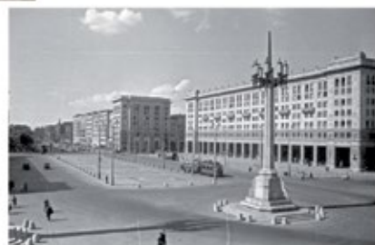
Marszałkowska ul. Warsaw