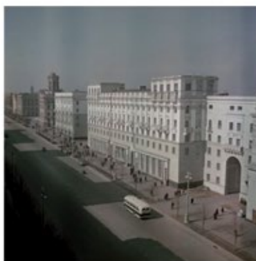
Minsk, Independence Av.

Neoclassical triumphant architectural ensembles, a symbiosis of professional urban planning analysis and triumphal Imperial rhetoric