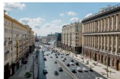
Moscow, Tverskaya ul.