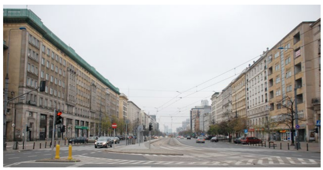
Fig. 4: Marszałkowska Residential District (MDM), Warsaw, Marszałkowska main axis