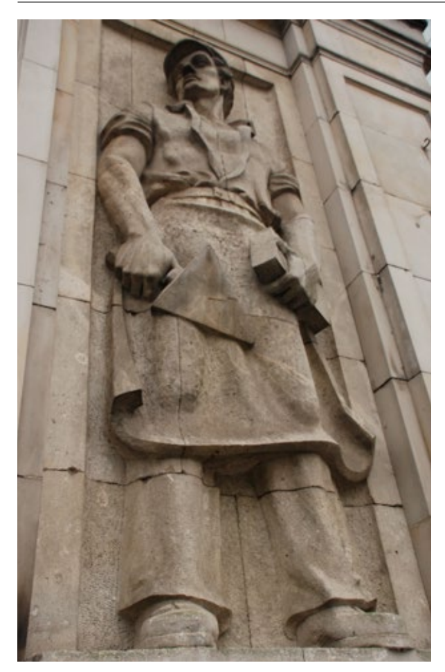
Fig. 8: Ludwika Nitschowa, "The Bricklayer" sculpture, MDM, Warsaw, 1952