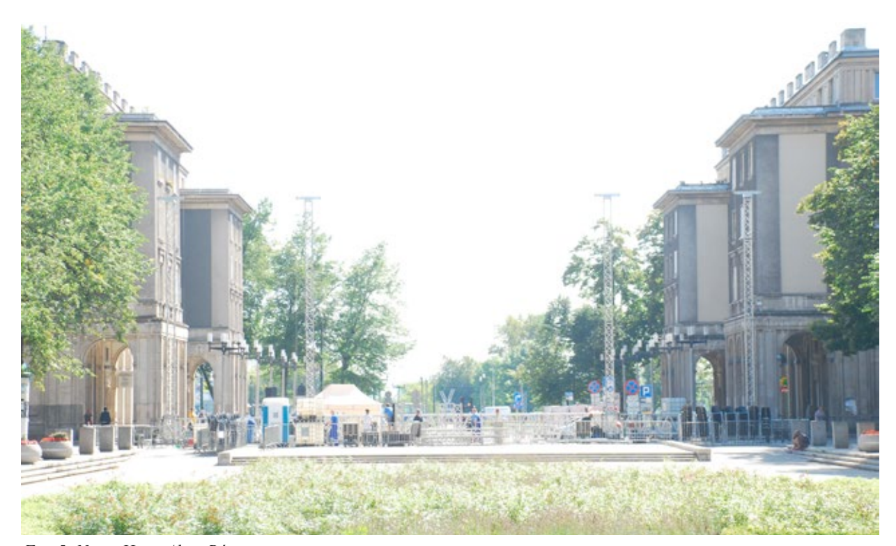
Fig. 5: Nowa Huta, Aleja Róż main axis

MDM adapted the existing structure of the city using the existing urban axis of Marszalkowska Street and the round city squares that were part of the neo-classical concept of Stanisław August Poniatowski, the last Polish King. Nowa Huta combines the idea of a Renaissance ideal city with elements of a garden city concept – a pentagonal square with