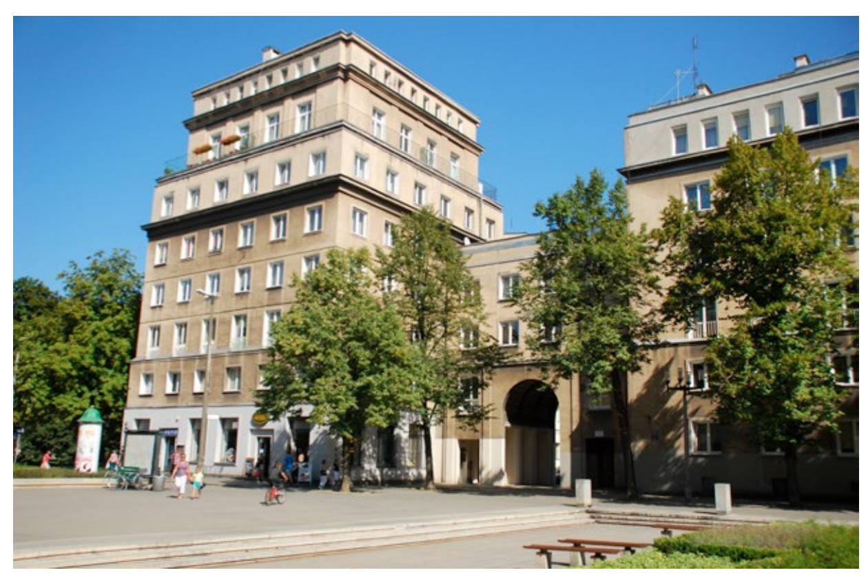
Fig. 3. Nowa Huta, Krakow, Aleja Róż, Tadeusz Ptaszycki (and others), 1949 – 1950 – 1956