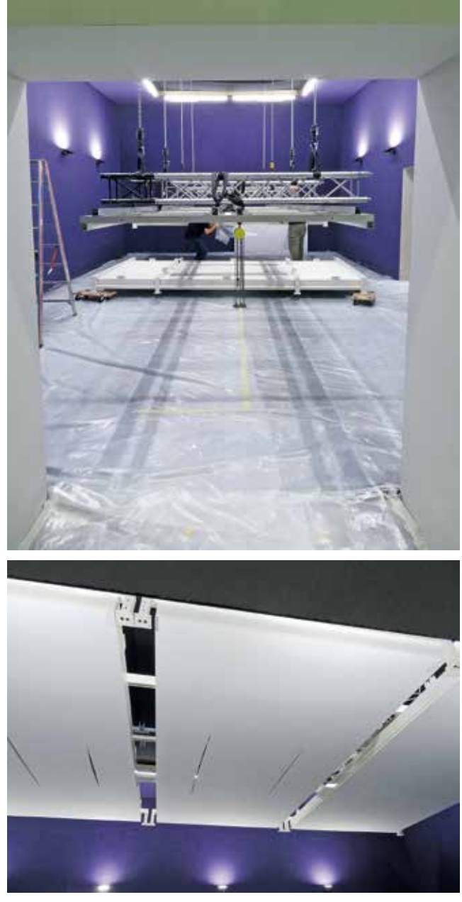
Figs. 7 and 8: Lucio Fontana, Spatial Environment with Cuts, 1960, Milan, during the installation on the ceiling