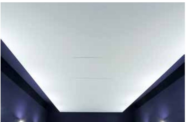
Fig. 6: Lucio Fontana, Spatial Environment with Cuts, 1960, Milan, installation on the ceiling

Operations like the one described above, which require the removal of artworks from their original locations, always pose numerous questions. Is it better to lose works that were created for a specific context, leaving them to historical documentation to prove their existence, or is it better to conserve them in new contexts? Although, as seen in all museums, artworks have often been removed from their original contexts, each time taking on new connotations, how can we ensure that these moves will not lead to the loss of their original values over time?