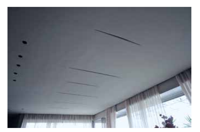
Fig. 4: Lucio Fontana, Spatial Environment with Cuts, 1960, Milan, plaster, six cuts in a white background, 400 x 814.3 cm