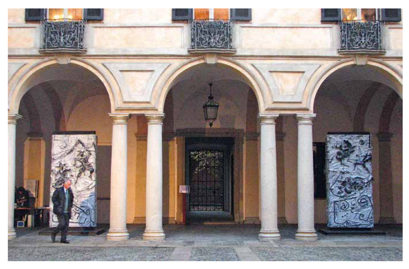
Fig. 2: Lucio Fontana, Pilastro, 57 A 3, 1957, presented in two halves

does not always happen, and the case we are going to present will demonstrate this.