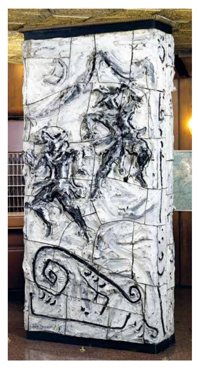
Fig. 1: Lucio Fontana, Pilastro, 57 A 3, 1957, ceramic, 310x160x70cm, Hotel Alpi, Bozen, Italy

based company, Equilibrate, to design a weight-bearing mobile structure. Given the considerable weight of the pillar, it had to be possible to completely dismantle it, so a solution was required that simplified its detachment, subsequent assembly, and storage. Due to its placement almost directly in front of the reception desk, the bas-relief composed of 78 cemented tiles had suffered damage from numerous incidents, some still visible and others roughly hidden by restorations that had altered considerably over time. We further identified cracks and chipped areas due both to the assembly technique and to stress caused by failing weight-bearing structures as well as old "stabilising" procedures carried out with cement and various kinds of glue.