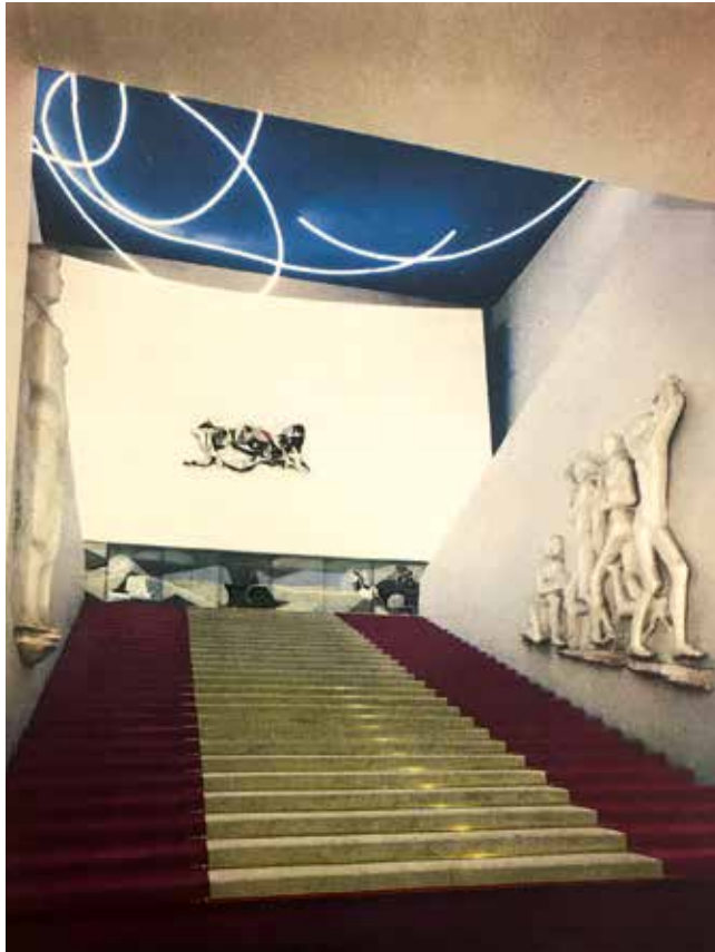
Fig. 10: Lucio Fontana, Neon Structure for the 9th Triennale of Milan, 51 A 1, 1951, leaflet by VIPLA, 1951