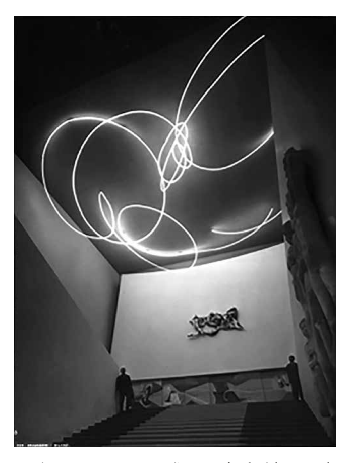
Fig. 9: Lucio Fontana, Neon Structure for the 9th Triennale of Milan, 51 A 1, 1951, Milan, white neon crystal tubes, 2.80 ca x 12 x 10 m