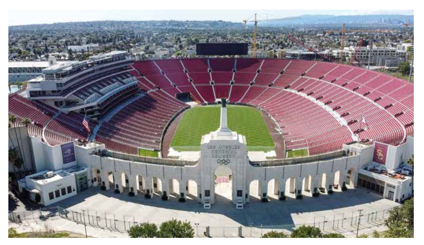
Fig. 1 Los Angeles Memorial Coliseum, 2019

In the late 1910s, elite boosters in Los Angeles saw stadium construction as a strategy to enhance the national and international visibility of their city. The stadium they proposed