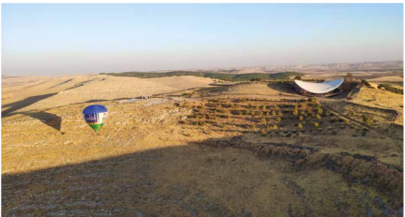
Fig. 3: Balloons over Göbekli Tepe, 2020