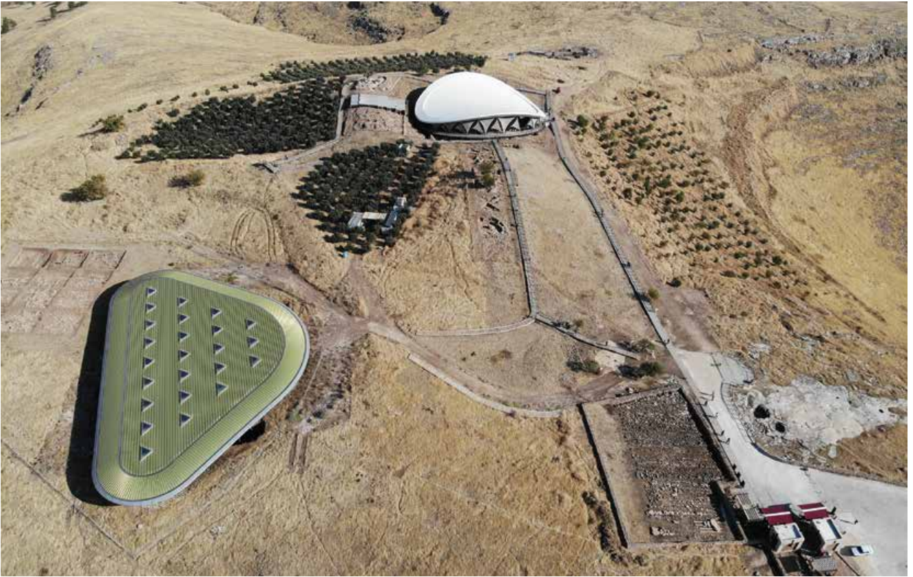
Fig. 1: Göbekli Tepe Aerial shot from West, 2019

23/02/2016 of Şanlıurfa Regional Council for Conservation of Cultural Properties. Although the boundaries are defined by law, it will take time and further stakeholder consultation meetings before the buffer zone is fully recognized by the local population, especially as it impedes the grazing of livestock in areas that were previously accessible to local communities.