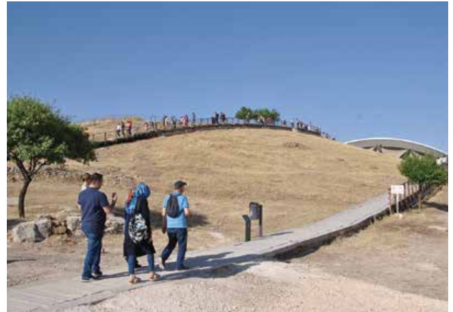
Fig. 4: Göbekli Tepe, Wooden walkway, 2019