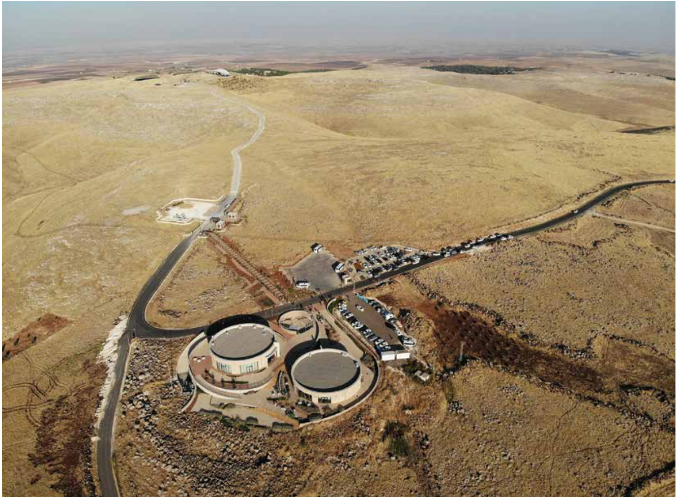
Fig. 2: Göbekli Tepe Visitor Center from west, 2019