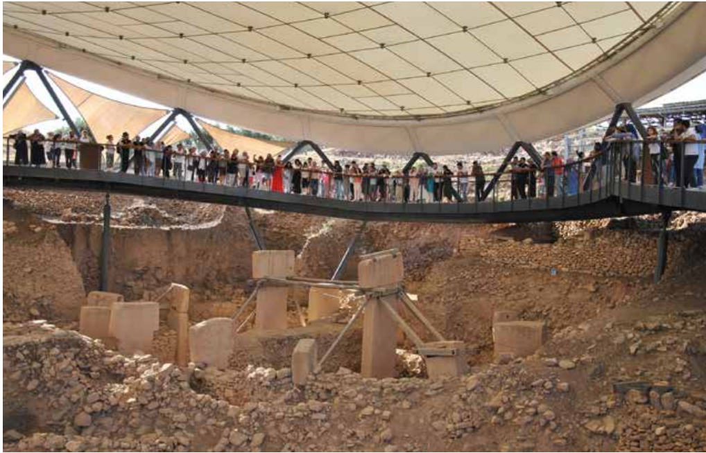
Fig. 6: Göbekli Tepe newly built Shelter GT1 over main excavation area, 2019

vulnerable locations around the site. These walls, which channel the rain water away from the trenches, have since proven extremely effective. Temporarily placed sandbags complete the barrier system in the winter months.