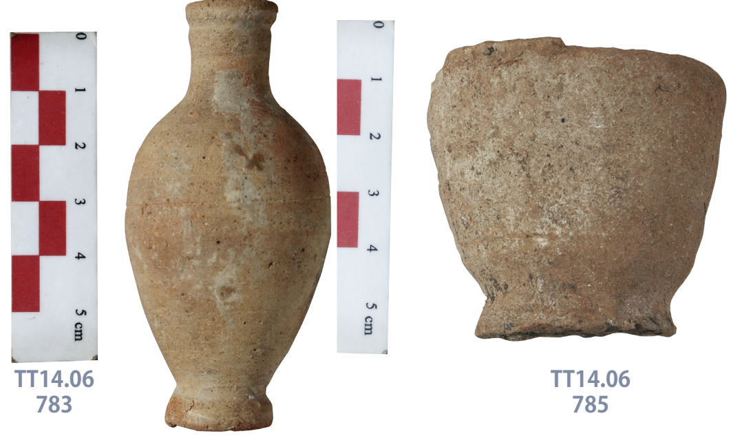
Figure 5. The balsamarium.

As for the balsamarium (fig.5) and the beaker (fig.6), they were found in one of the burial