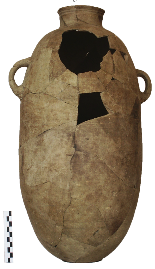
Figure 4. The amphora with embalming material found in MIDAN.05 (Photo of the Missione Italiana a Dra Abu el-Naga (reproduced with permission of prof. Marilina Betrò).

The original context and disposition of pots and mummified bodies found during the excavation is not always easy to reconstruct because of the alternating events through the history of the tomb: first, its constant reuse, often resulting in a shift of the grave goods, then -and more impacting- the devastation caused by floods and looters. The mud and debris flow in some cases invaded the two tombs with such a violence to destroy everything on its path, in particular vessels, whose fragments were scattered throughout the floor. Looters entered the tombs both in ancient and in recent times,