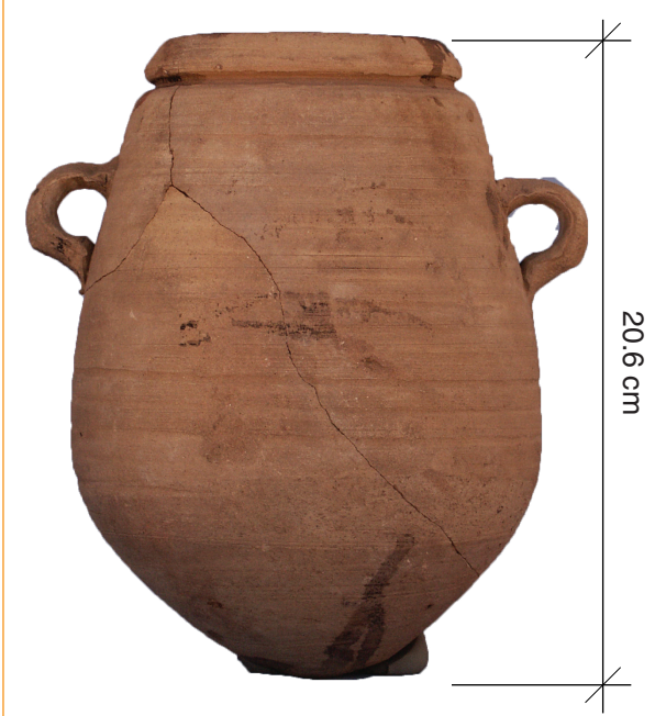
Figure 7. The amphora with embalming material found in TT 14 (Photo of the Missione Italiana a Dra Abu el-Naga (reproduced with permission of prof. Marilina Betrò).

the tomb. In one of these chambers, in fact, fragments of sarcophagi rishi ( 16^{th} century BC. approximately) and vessels from the Roman period ( 2^{nd} / -3^{rd} century AD) have been found. In particular, the beaker and the unguentarium were found in a recess around 80 cm wide, 25 cm