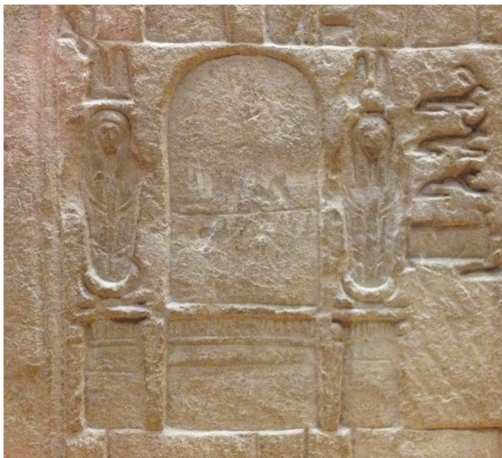
Figure 2. Two anguiform statues with female faces on either side of a stela (detail of the relief Florence inv. 5412).