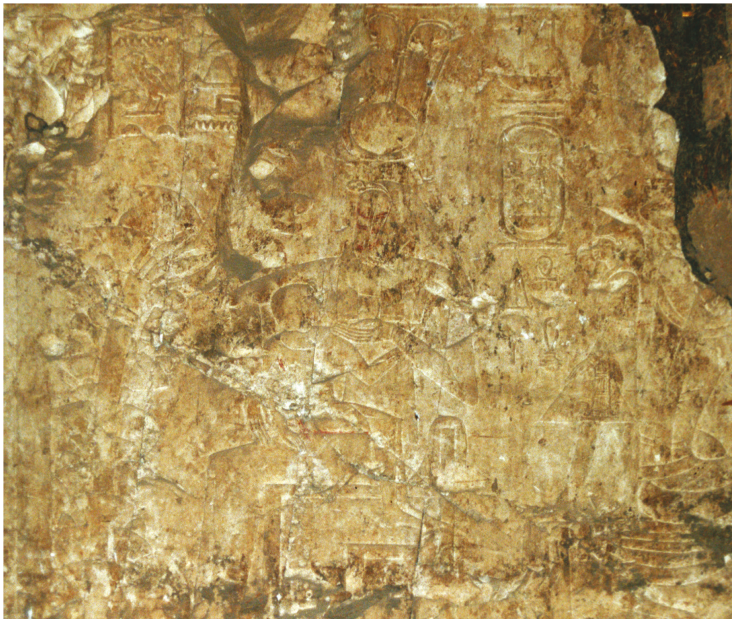
Figure 4. Anthropomorphic nursing image with a snake's face (Theban tomb 48).