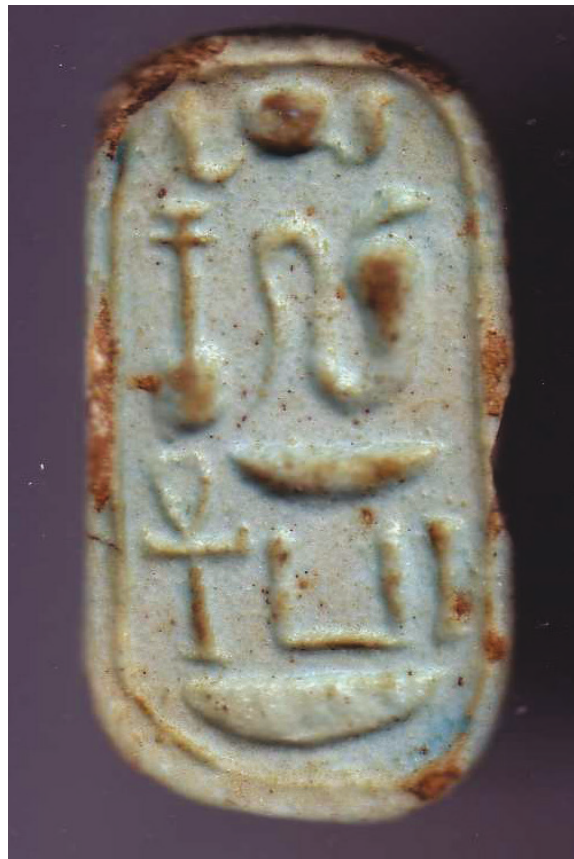
Figure 5. b) Seal (private collection).