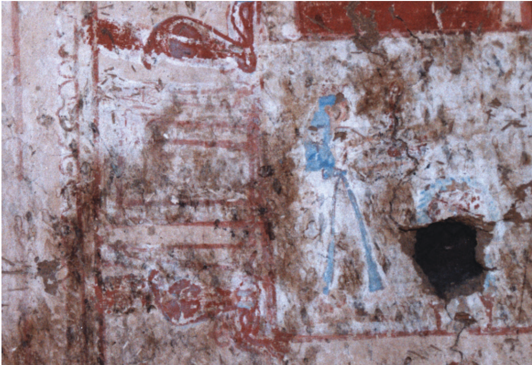
Figure 3. Two anguiform statues with female faces (Theban tomb 284).