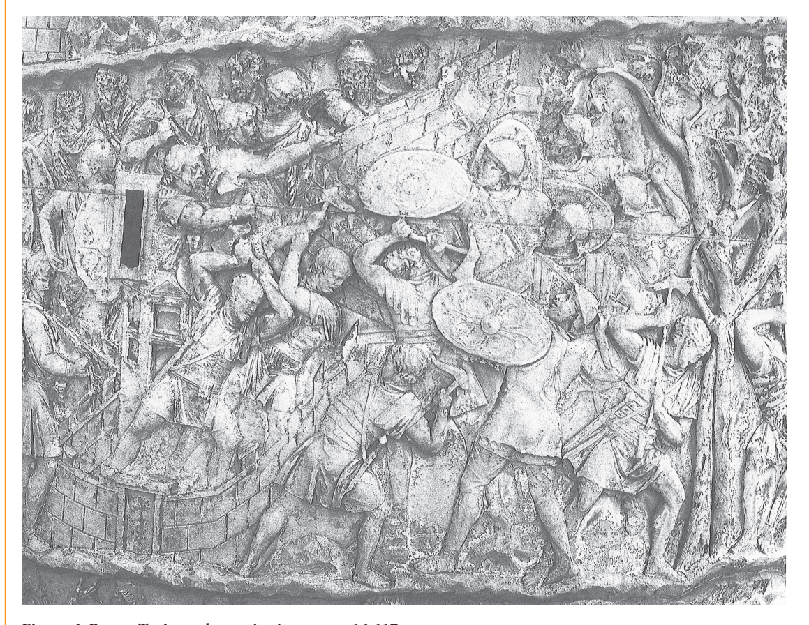
Figure 6. Rome, Trajan column, in situ: scenes 16-117