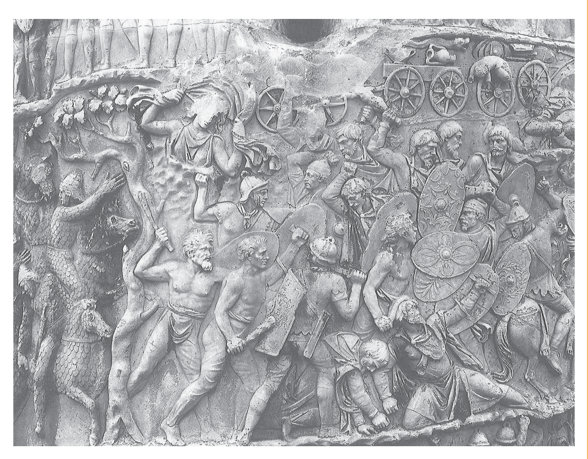
Figure 3. Rome, Trajan column, in situ: scenes 37-38