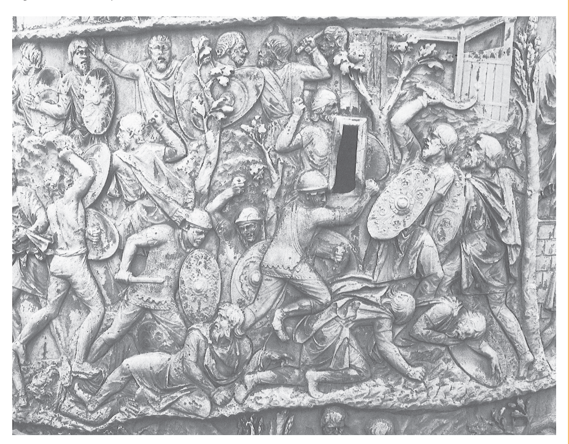
Figure 8. Rome, Trajan column, in situ: scene 72