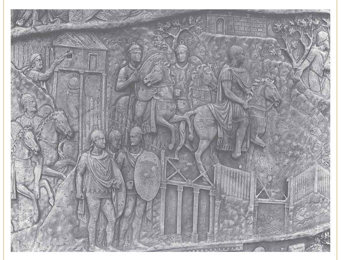
Figure 4. Rome, Trajan column, in situ: scenes 57-58