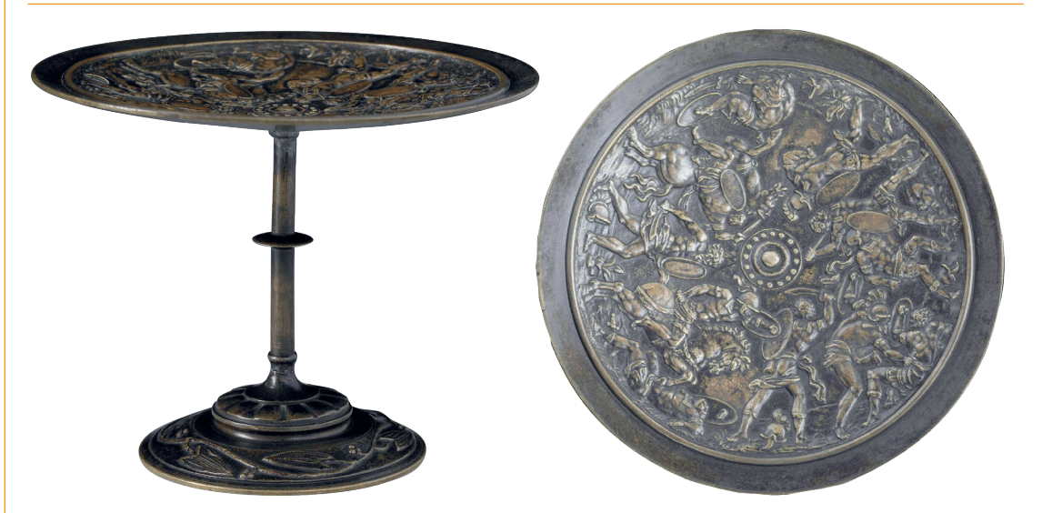
Figure 1-2. gilt-bronze goblet at Berlin, SB Sammlung, attributed to Galeazzo Mondella from Verona.