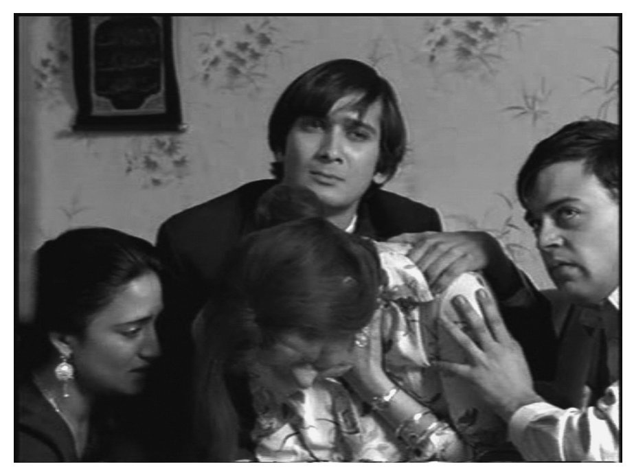
6 East is East: Consoling the Mother

than as victims of so-called honour killings or arranged marriages say about the visual repertoire of the Western images of migrants, let alone the almost complete absence of the representation of queers with a migrant background?