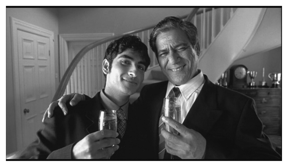
1 My Son the Fanatic: Happy Days: Father and Son Happily United