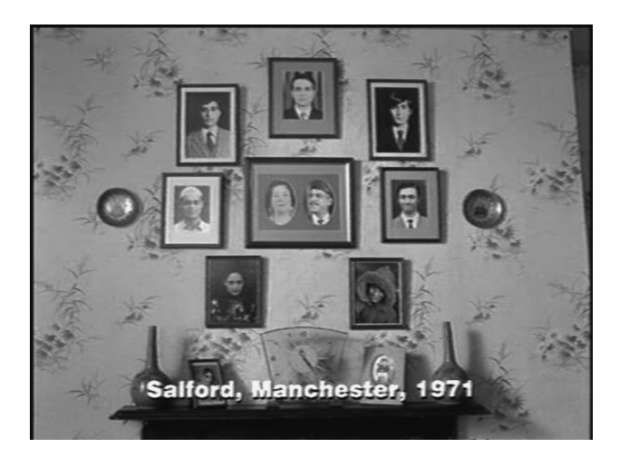
3 East is East: The Family: Still Intact Grouped around the Parents