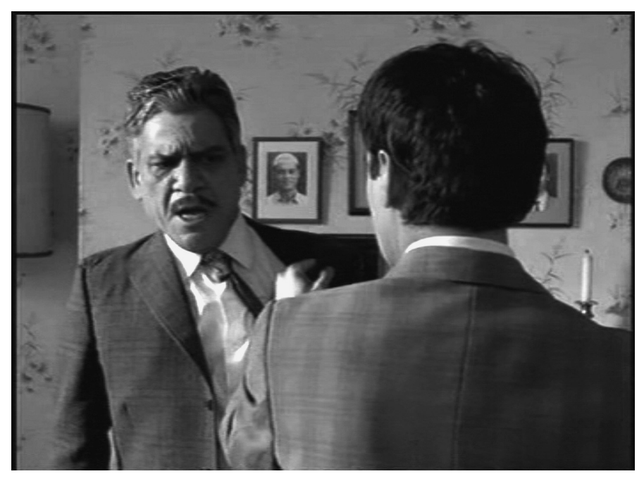
5 East is East: Finally Opposing the Patriarch

In the light of George's attack on them, the children no longer obey the law of the father and his power over the family is finally and definitively broken.