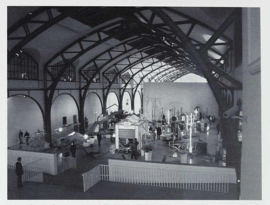
2 Jason Rhodes: Creation myth. 2004. The Friedrich Christian Flick Collection, Chapter 1, Hamburger Bahnhof, Berlin, 2004

The museum also sponsored debates about the relationship of collectors to museums and the Flick Collection. The press and academics continued to criticize.<sup>26</sup> Blume's position was that there is no need to include non-art related material in the exhibition: its absence is a key element in keeping the debate alive.<sup>27</sup> It is too early to tell what the discussion about The Friedrich Christian Flick Collection generated. One repercussion may be that Flick finally did pay five million Euros into the Slave Labour Compensation Fund in April 2005. Another may have been preventing Flick selling work to the Museum of Modern Art in New York.<sup>28</sup>