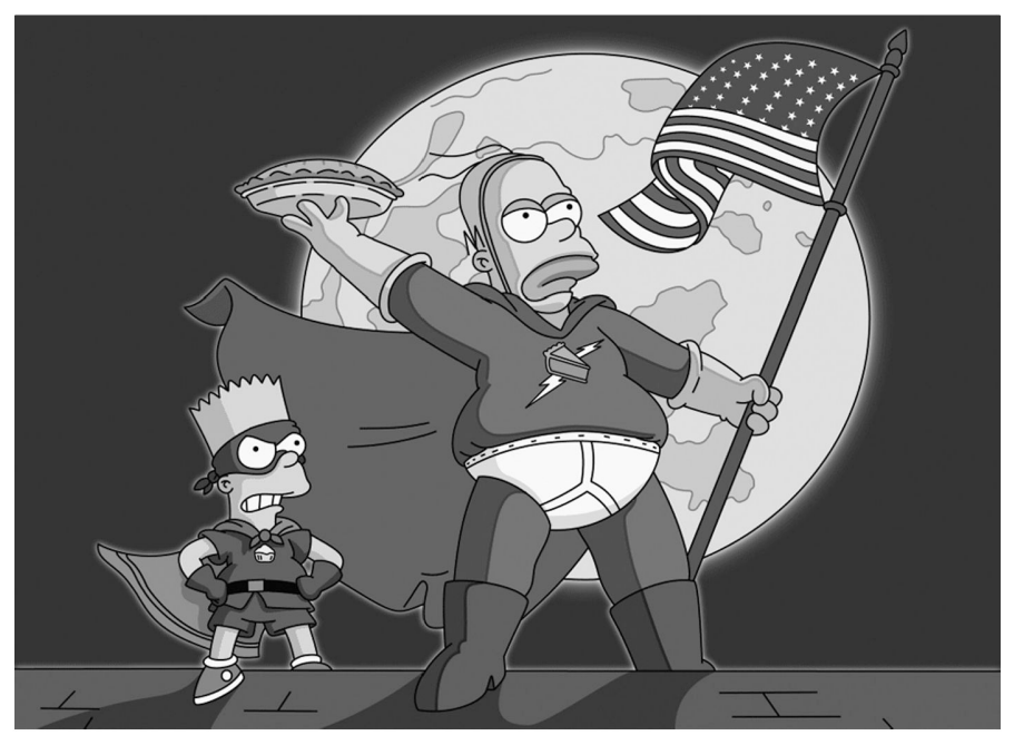
5 Homer and Bart Simpson as The Pieman and Cupcake Kid: The Simpsons , from the episode Simple Simpson (200Δ)