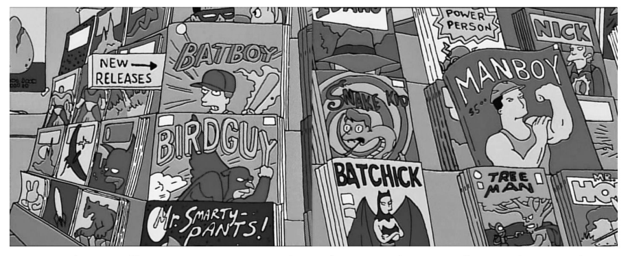
1 A look into the different superheroes, present in the Simpsons-universe: The Simpsons , from the episode Radioactive Man (1995)

Bart Simpson and his friend Milhouse Van Houten during the opening of the episode Radioactive Man , produced and first aired in 1995, makes clear, Bart loathes other – seemingly new – superheroes as weak imitations of Radioactive Man and he even points out their raison d'être : the greediness of the comic book industry which wants to cash in as much money as possible by creating a new superhero every week.