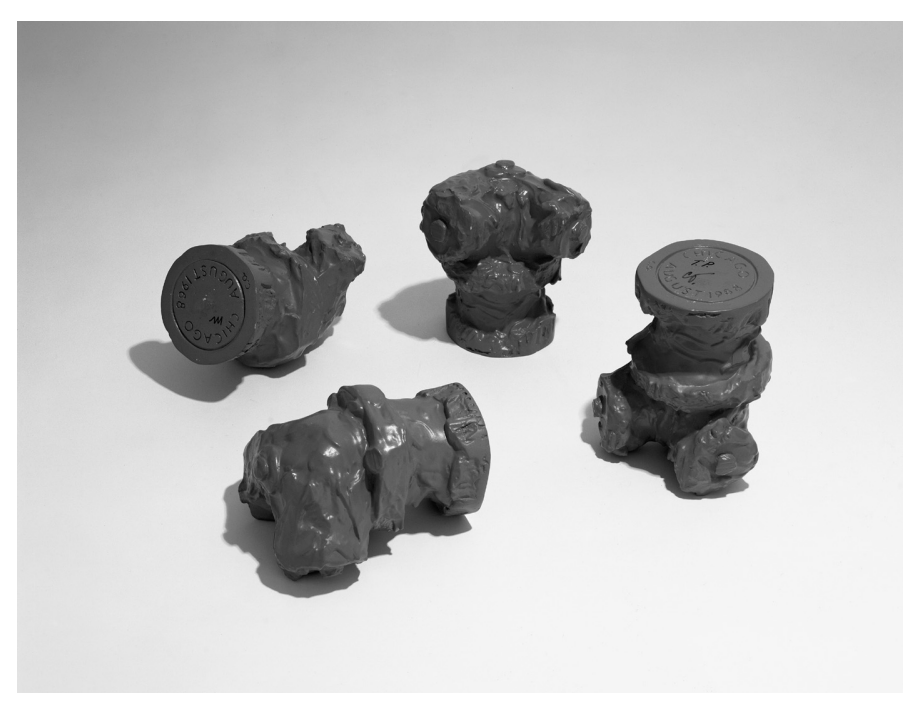
5 Claes Oldenburg, Fireplugs, 1968, cast plaster and acrylic paint.

infringement. His soft sculpture «of» the Picasso maquette (and note it was a replica of the maquette and not the monument) is certainly no simple replica. The Soft Picasso (complete title: Soft Version of Maquette for a Monument donated to Chicago by Pablo Picasso) recreates the «thing» at a scale that makes it easy to apprehend as an object of common use; it domesticates it. The Picasso's scale is grand, important, official, and its curves and angles stark and hard. Oldenburg's «version» looks homely and slightly sad, like a forlorn stuffed animal. Sewn as a deliberately irregular version of the Picasso (the placement of the eye «socket» is askew relative to the original), its «rods» sag deeply, like other soft, or soft-seeming, objects Oldenburg was making. He fitted the object with a flexible spine that allowed it to be twisted into different shapes.