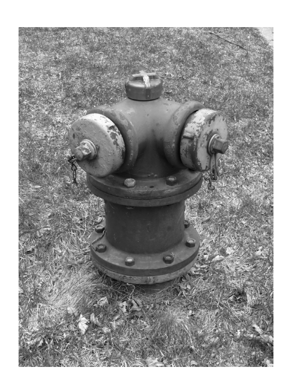
6 A Chicago fireplug, 2011.

curious relationship to the Picasso: each seems to transform readily into the other. Fireplugs would be an unusual souvenir, Oldenburg suggested, because they are a souvenir of a multiple: «A souvenir is usually a memento of something of which there is one, and only one». These, on the other hand, refer to a different kind of public monument—a multiple one. The fireplug—the real one (Fig. 6)—might be seen as a ubiquitous, multiple, piece of public sculpture. Unlike the Picasso it has a concrete function as a bricks-and-mortar public good. It is the sign and representative of an invisible network, the city's water system. It is also, by its shape, in Oldenburg's hands, an acephalic figure with protuberances that might yet grow, a public sub-object, a stubby and scruffy thing—emergent, networked, ridiculous, ubiquitous. Oldenburg emphasizes its gender ambiguity and sexuality (it seems to have breasts when «done in dripped plaster»). 38