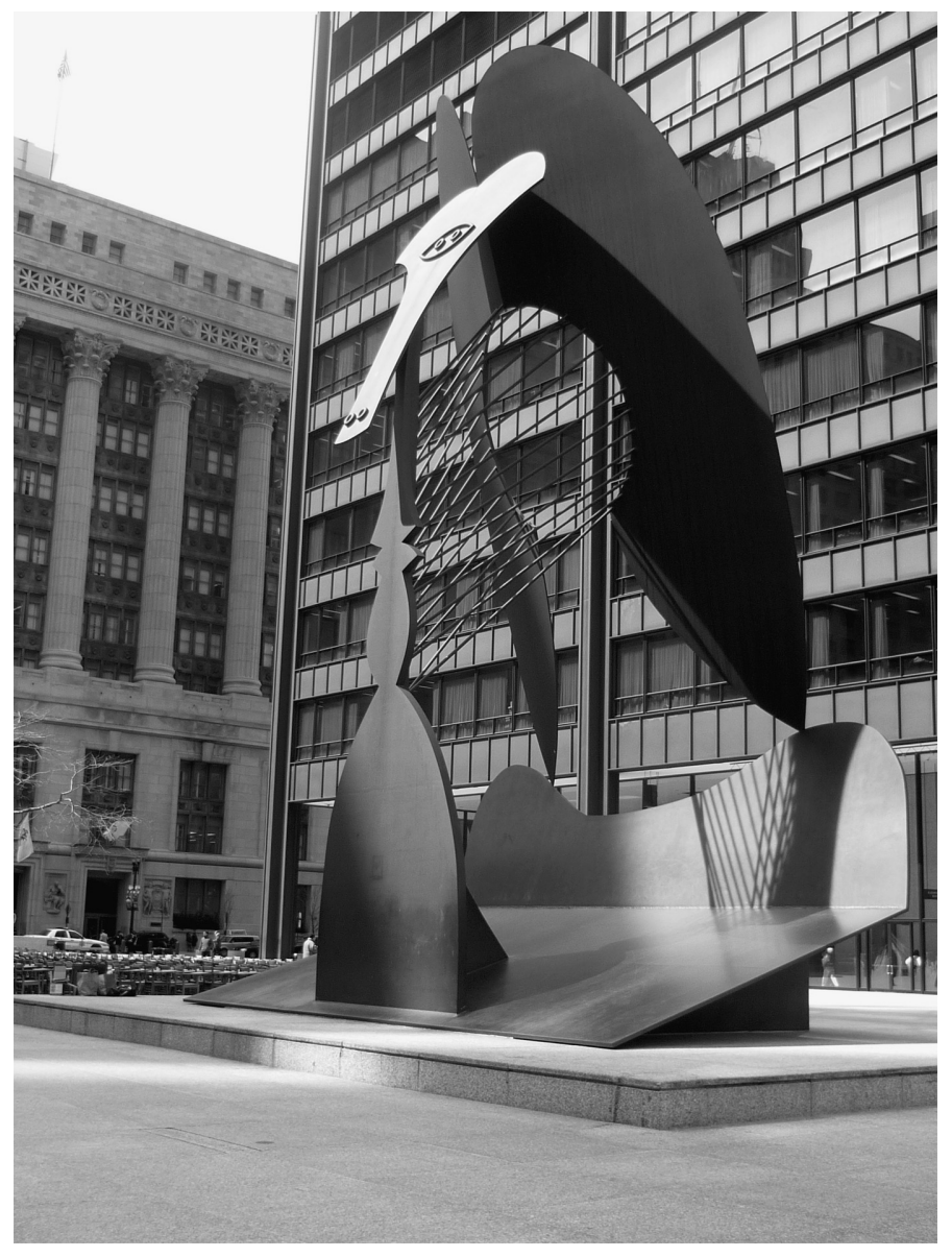
1 Pablo Picasso, Untitled (The Chicago Picasso), 1967. Cor-Ten steel. Daley Plaza, Chicago.

As "thing" the monument is both less than a work of art and more than a work of art. In its material existence, as a big structure made of steel, it signifies Chicago as a city of things—the "city of big shoulders" where skyscrapers are built and commodities traded. And yet calling it a thing also opened up the possibility of giving it many other names—making it more than a mimetic object in its ability to call up endless associations. As such it suggested the possibility of a new liberal pluralist consensus for the city. The city's ludic embrace of this mutable object of modern art, which gave itself over to plural interpretations, sug-