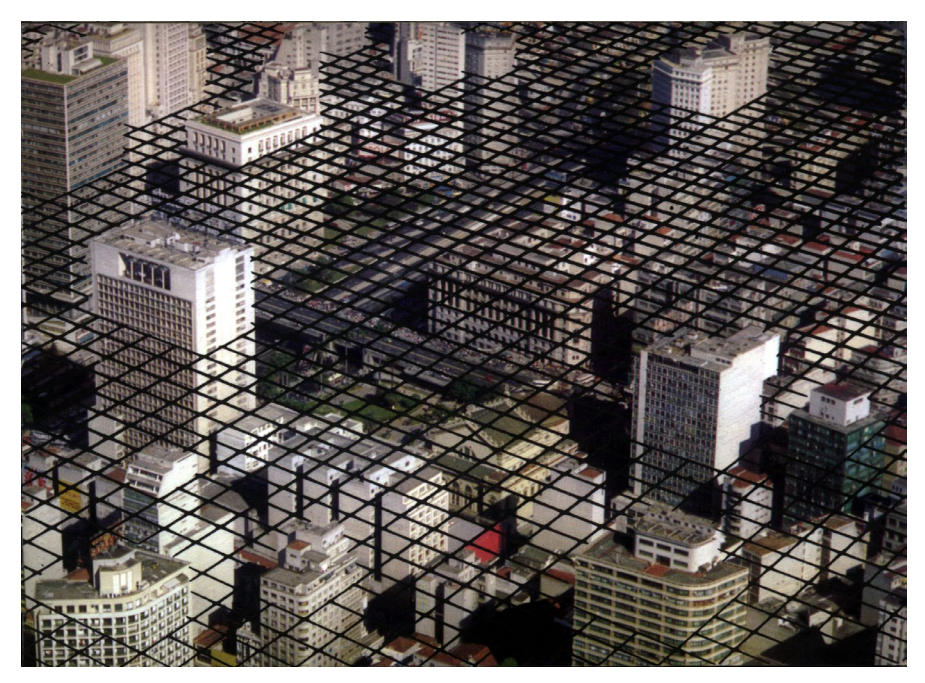
1 Regina Silveira, Brazil Today. The Cities, self-published 1977, 10,5 × 15 cm, serigraphy on postcard, 6 pp., edition of 40