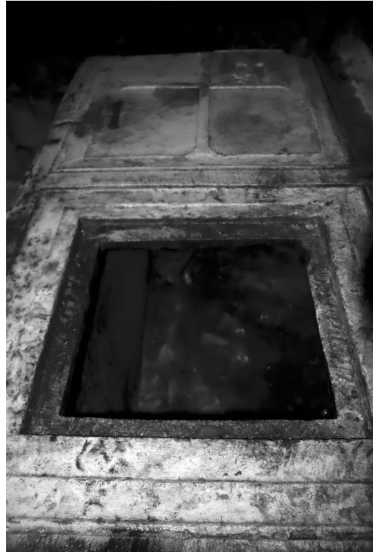
Fig. 2. Istanbul, Silivri-Kapı mausoleum, lid of the principal sarcophagus

It could be suggested that this opening allowed other burials to take place in the same sarcophagus. This hypothesis has to be discarded, however, as the opening is too small, and is planned to be used way more frequently than for occasional supplementary