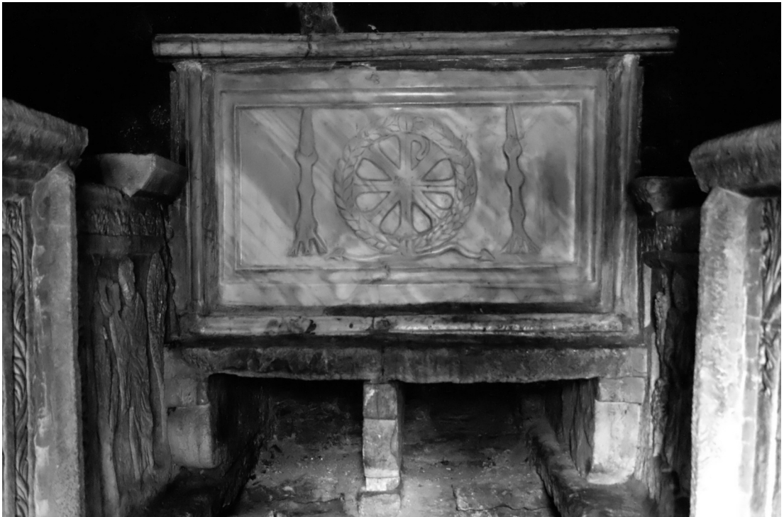
Fig. 1 Istanbul, Silivri-Kapı mausoleum, principal sarcophagus

At the time of its discovery, the mausoleum sheltered frescoes: five human figures impossible to identify precisely were represented on the walls. The interior fitting comprised five sculpted sarcophagi, four of which were in limestone, situated symmetrically on either side and decorated with narrative scenes – the Christ doctor amongst the apostles, Abraham's sacrifice, Moses receiving the Law Tables, and praying figures around a cross.