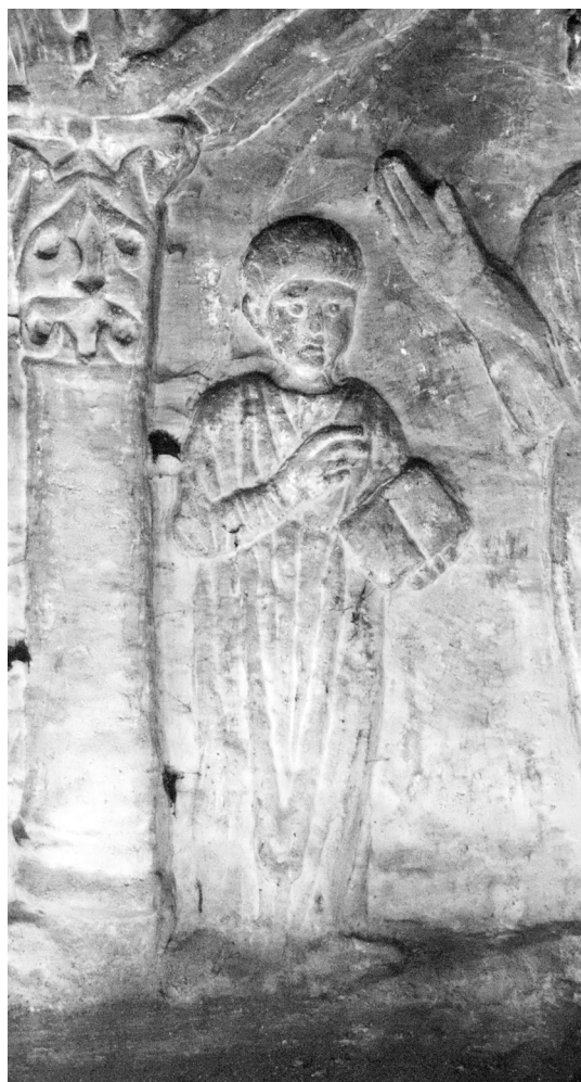
Fig. 4 Istanbul, Silivri-Kapı mausoleum, limestone sarcophagus, detail of the relief