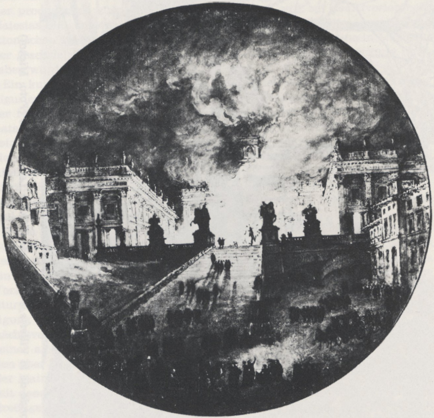
Abb. 2 Charles De Wailly: Kapitol. Um 1755. Wien, Albertina