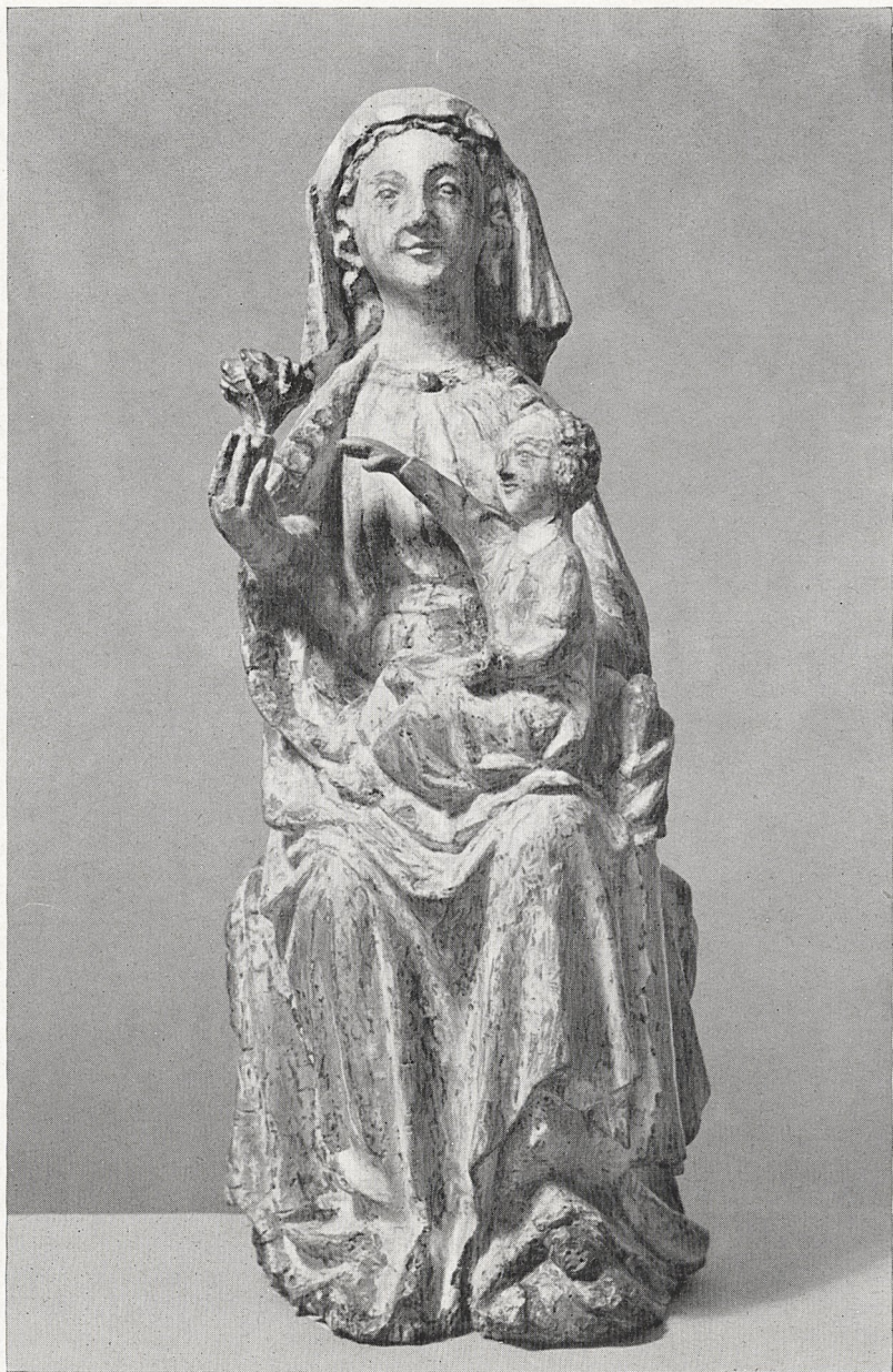
Abb. 2 Thronende Mutter Gottes. Mittelrhein, um 1250. Mönchen-Gladbach, Slg. H. Schwartz