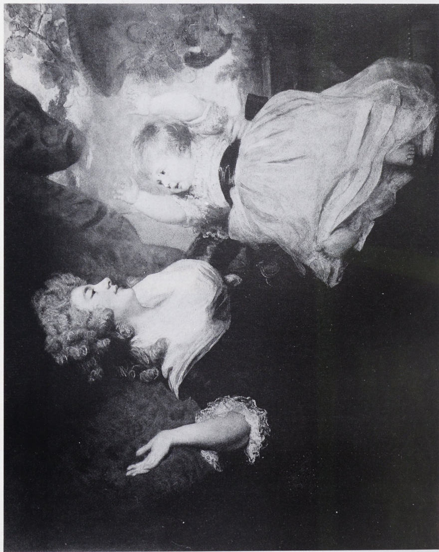
Abb. 2 Joshua Reynolds, Georgiana, Duchess of Devonshire, with her daughter, Lady Georgiana Cavendish, 1786.