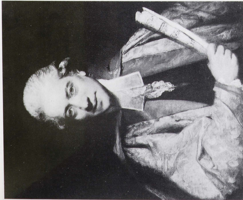
Abb. 1a Joshua Reynolds, Dr. Charles Burney, 1781. London, Nat. Portrait Gallery