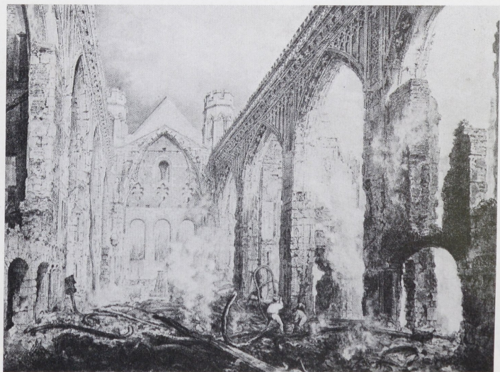
Abb. 8b London, West- minster Palace, St Stephen's Chapel, after the fire of 1834, drawing publ. 1844 (J. Bony, The English Decorated Style, Oxford 1979, ill. 329)