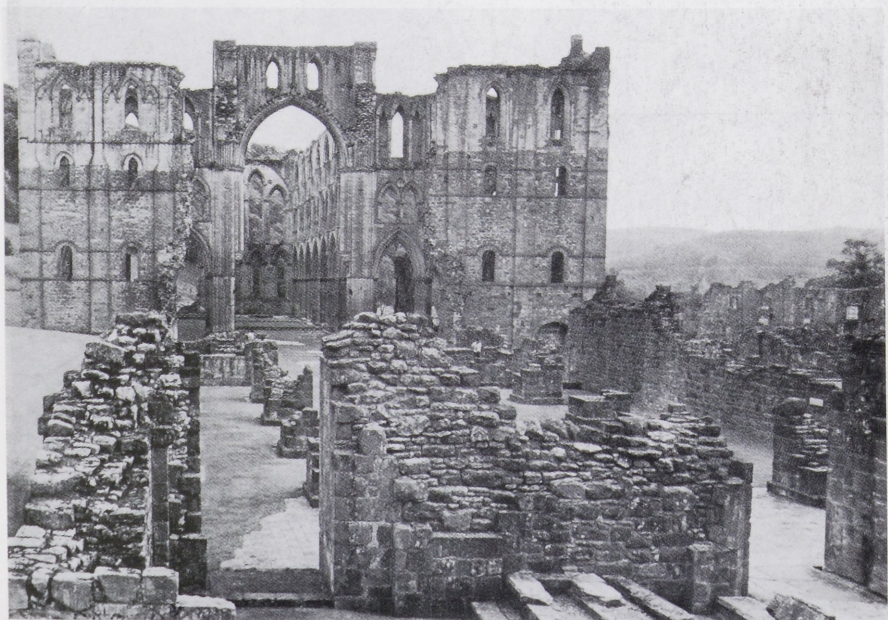
Abb. 5b Rievaulx Abbey, nave looking east (P. Fergusson, Archit. of Solitude , Princeton 1984, pl. 2)