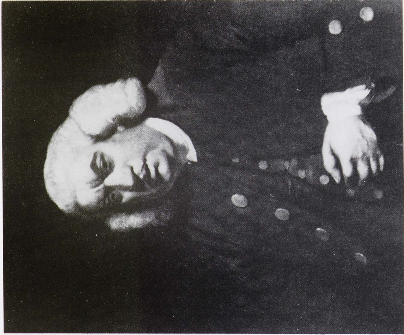
Abb. 1b William Doughty nach Reynolds, Samuel Johnson, 1799, Mezzotinto.