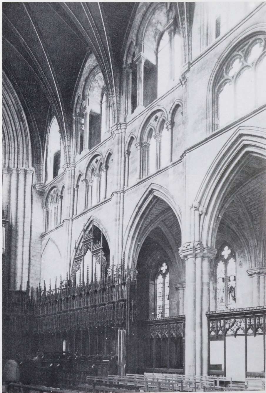
Abb. 6 Ripon Cathedral, choir, north side view to west (ibid., pl. 90)