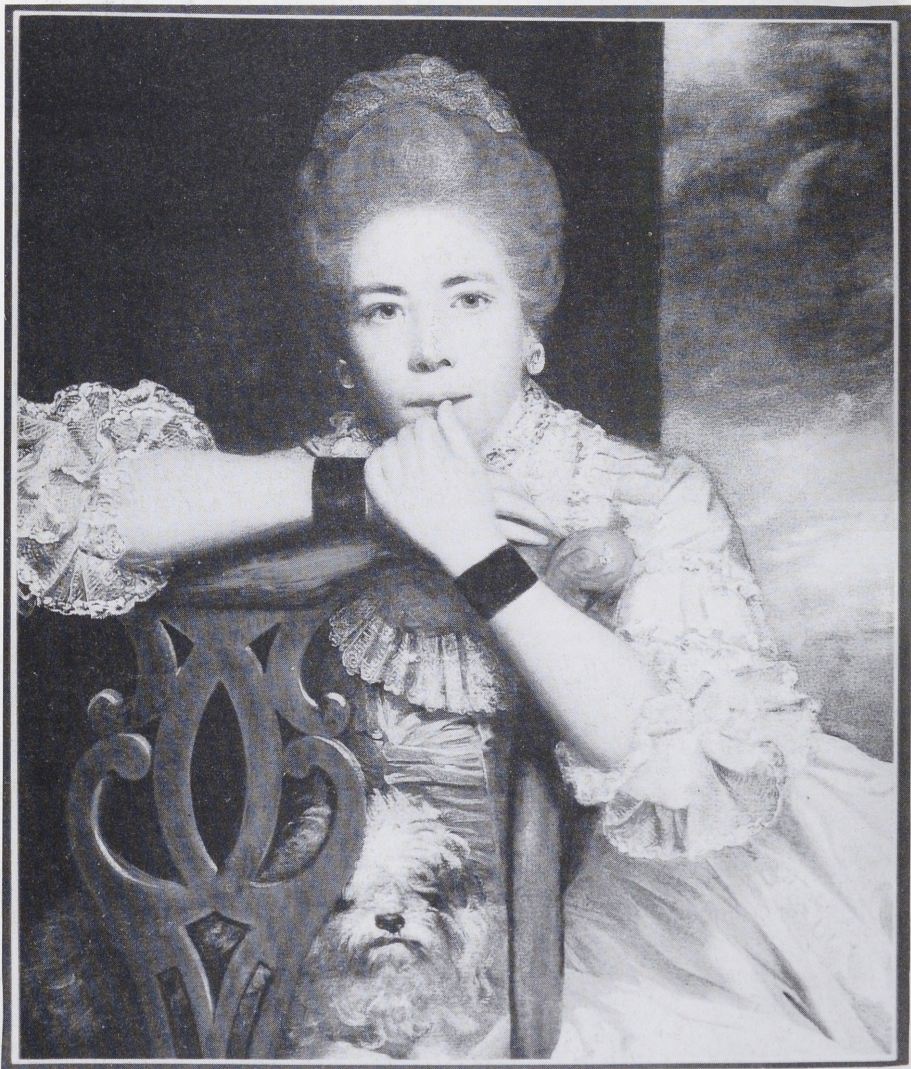
Abb. 4 Joshua Reynolds, Mrs. Abington als „Miss Prue“, 1771. Yale Center for British Art, Paul Mellon Collection