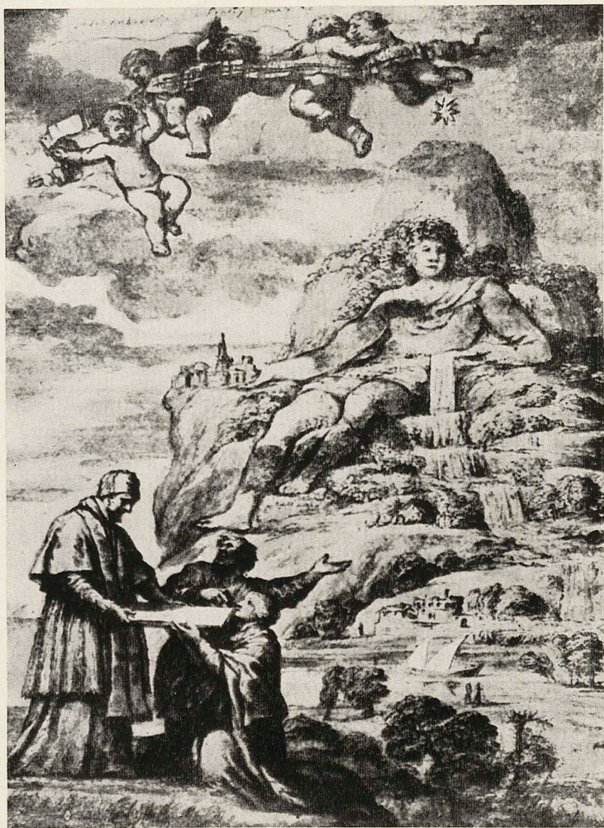
Abb. 1 Pietro da Cortona: Der „Alexanderberg“ Papst Alexanders VII. London, British Museum.