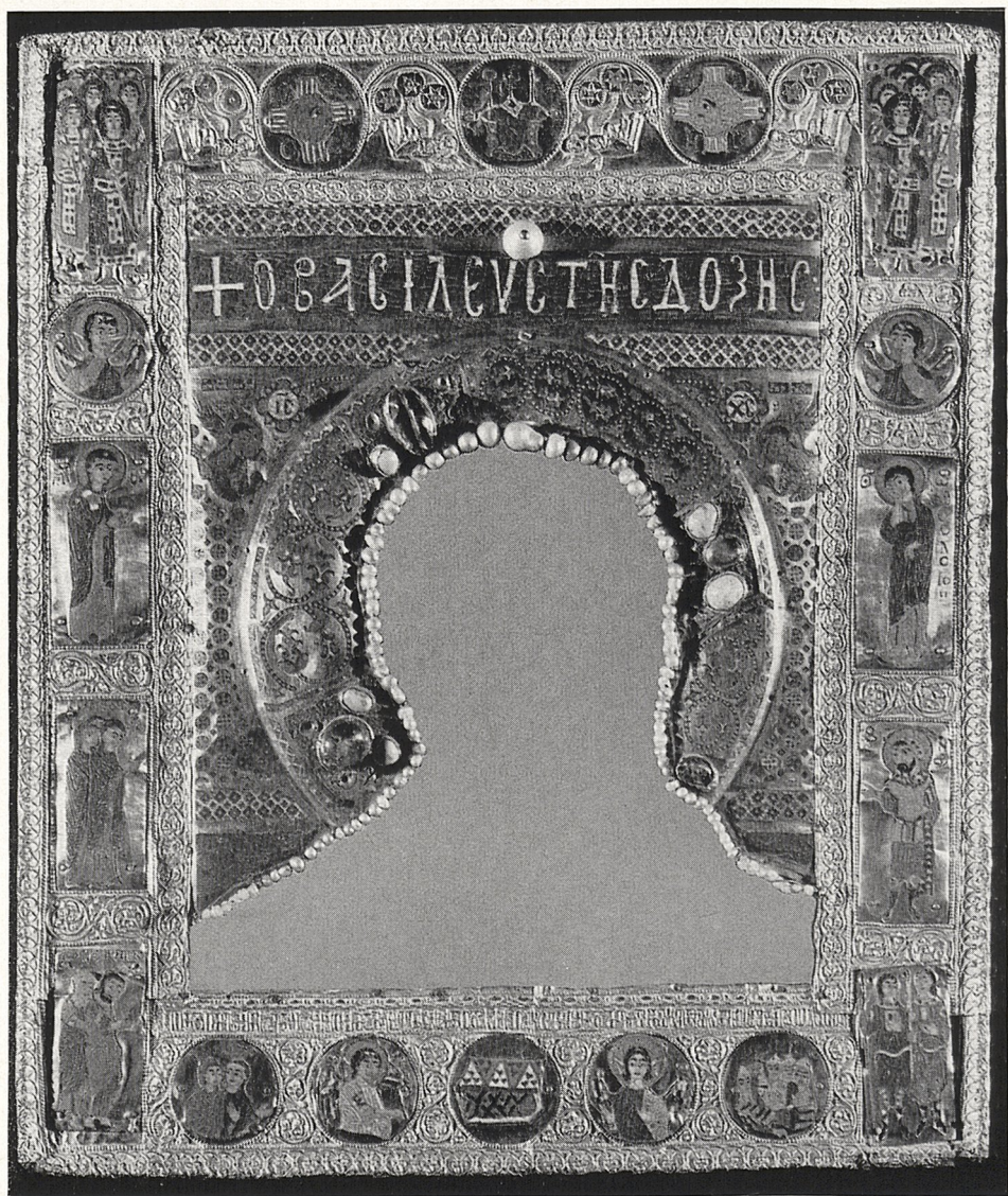
Abb. 4 Schmerzensmann-Ikone. Jerusalem, Grabeskirche