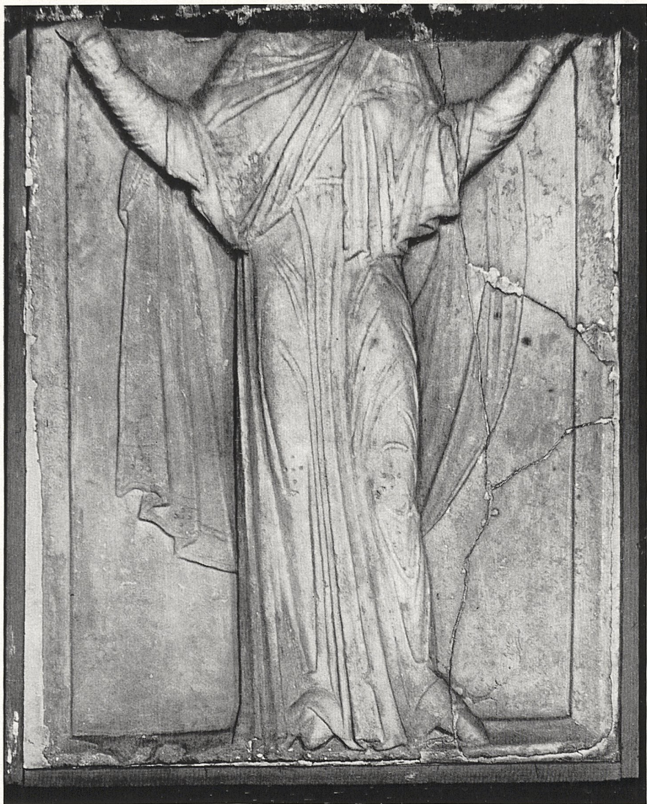
Abb. 1 Orantin. Saloniki, Hagios Georgios