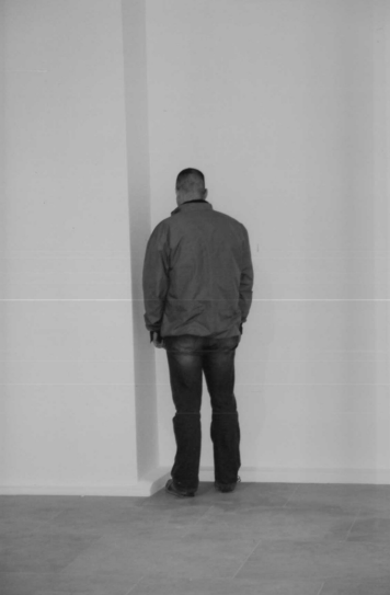
Fig. 2: Group of people facing the wall and person facing into a corner, Oktober 2002, Lisson Gallery, London.

Six people are standing facing one of the gallery walls, another person, likewise with his back turned towards the other people in the room, in a corner. I see the performance only on the black and white photographs authorised by Sierra as official documents. I see how close the group of six is standing together and what a strong contrast exists between that agglomeration and the single man – it appeals to me like an artistic arrangement. I see the group of six and am valuing the clothes. Does the depravation show up in them? The women to the left and right correspond in their appearance to my stereotype. The woman with short hair and in black suit in the middle irritates me. I am studying details, for instance the strange style of the flower skirt on the right, that reveals the feet in sneakers.