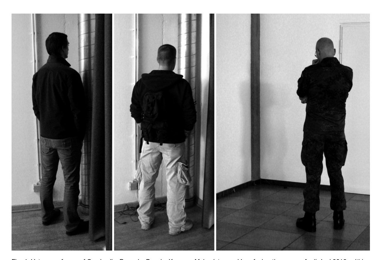
Fig. 4: Veterans of wars of Cambodia, Rwanda, Bosnia, Kosovo, Afghanistan and Iraq facing the corner, April-Juni 2012, within the exhibition 30 Künstler – 30 Räume, Neues Museum Nürnberg - Staatliches Museum für Kunst und Design. Kunsthalle Nürnberg. Institut für Moderne Kunst Nürnberg. Kunstverein Nürnberg - Albrecht Dürer Gesellschaft.

Veterans of war are standing faces to the wall in corners of the exhibition space. Not all men are wearing uniform – attire, posture and also the distance to the corner are varying. People in back view are special projection surfaces. Depending on the inclination of the head, I see pride, indifference or shame. All seems to have already happened here – veterans are invoking images of survived wars. The physical isolation seems ambivalent: The actors have been recruited with the officially communicated aim of criticising the common disinterest in the situation of the former soldiers. Now they are addressing me as victims – not only of the common ignorance regarding the politics of war, but of the exhibition situation where the standing in the corner is inevitably degrading the men to objects of my look.