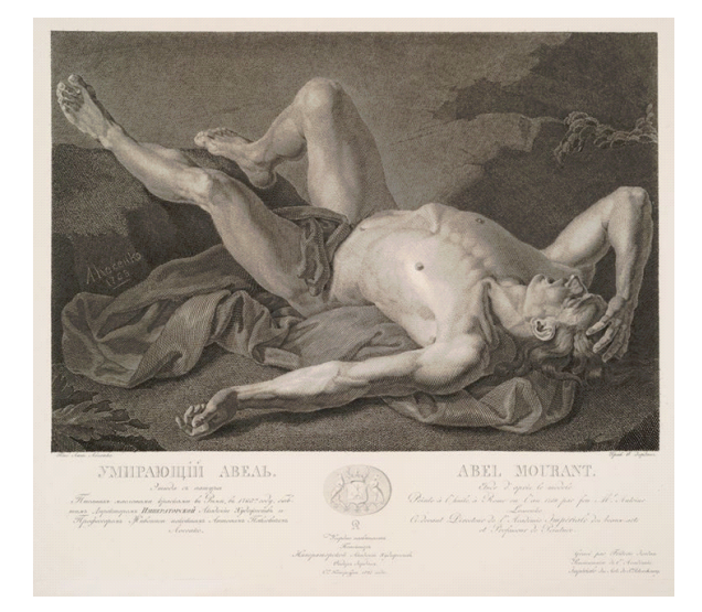
Fig. 4 Fedor Iordan / Anton Losenko; Dying Abel; photographic reproduction; published in Nikolai Ivanovich Utkin: ego zhizn' i proizvedeniia by Dmitrii Rovinskii, St Petersburg 1884; Slavic and East European Collections; The New York Public Library