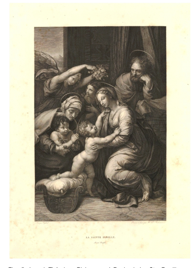
Fig. 5 Joseph-Théodore Richomme / Raphael; La Ste Famille; c. 1822; engraving, etching; 49.8 x 35.5 cm; London; The British Museum

second gold medal for his engraving Mercury and Argus (after Petr Sokolov), and the first gold medal in