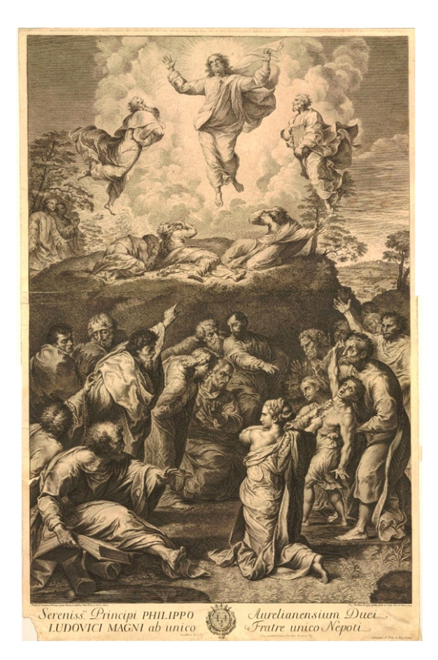
Fig. 12 Nicolas Dorigny / Raphael; The Transfiguration; 1705; etching, finished with engraving; 78.9 x 51.1 cm; London; The British Museum

the engraving Tsar Nicholas I observed, "Good, but sieve-like."<sup>35</sup> In contrast to Morghen's celebrated versions with their varied cross-hatchings, lordan's final state of Transfiguration used a uniform system of solid, smooth, and steady lines. The resulting visual effect was more sculptural, relief-like, rather than painterly. In addition to the tsar's comment, other, more disparaging remarks followed. In an 1850 letter, Ivanov informed Nikolai Gogol that he had finally seen lordan's engraving, as the latter had exhibited it at a local shop in Rome before returning to St Petersburg. Ivanov wrote: