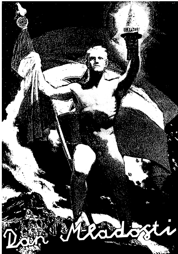
Fig. 3 New Collectivism, Youth Day , 1987.

a painting by a German artist of the Third Reich, Richard Klein, with the Nazi symbols replaced by Yugoslav symbols. The totalitarian aesthetics made the poster proposal an instant favourite with the federal jury. Before long, however, it was discovered what the poster was based on and a nationwide scandal erupted.