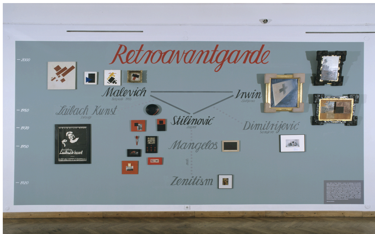
Fig. 5 Retroavantgarde , 2000; installation view at the exhibition Irwin Live , Moderna galerija, Ljubljana, 2000.

art historians. In reality, Irwin was never interested in national art per se , but in its broader international contextualization. Neue Slowenische Kunst is not national art; it is symbolic capital pertaining to a space entering into international exchange. In addition to the Slovene context, also the Yugoslav context was crucial for Irwin, and, over the last 20 years, most of all, the Eastern European context. A turning point in this sense is the NSK Embassy in a private apartment in Moscow in 1992 (fig. 6). This included discussions about a common Eastern European identity, which was never understood in the essentialist sense. The “Moscow Declaration” states that the Eastern European experience has a universal value, because the experience “of oppressive regimes (totalitarian, authoritarian), found in all more or less developed states throughout the universe, is common to more than half of the population. This is universal experience.” 8