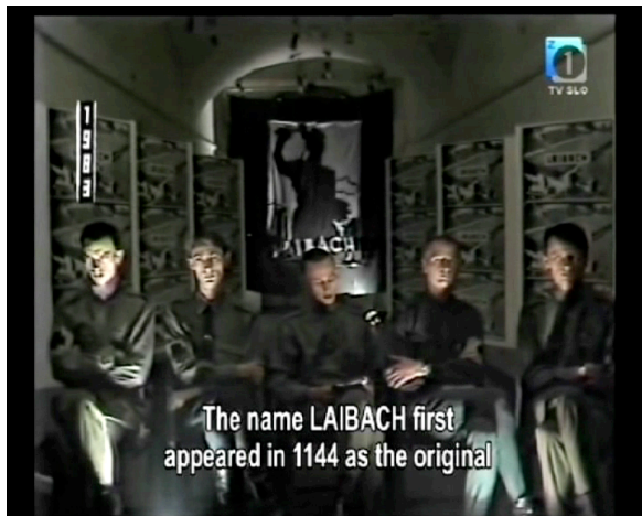
Fig. 2 Laibach, XY – unsolved , 1983, television interview.

Today, international exhibitions, art journals, and historical overviews all strive to represent artists from various parts of the world more equally. In the anthology Institutional Critique , two other cases from Eastern Europe are presented in addition to Laibach . Edited and published in the United States, the book understandably provides by far the greatest number of examples dealing with North American artists, followed by Western Europeans, then South Americans, and finally, Eastern Europeans. It classifies artists together according to their strategies, not the geopolitical context. But, it is precisely the geopolitical context that is one of the crucial points of departure for NSK, questioning all along not only who articulates knowledge, but also where from in terms of geopolitical hierarchy.