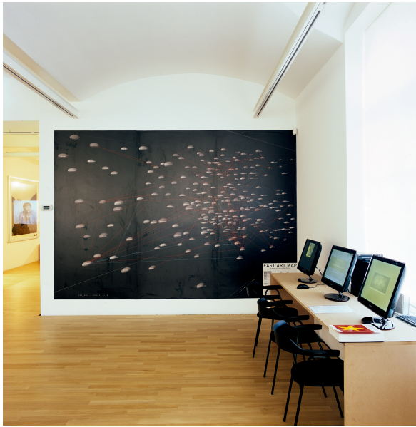
Fig. 4 Irwin, East Art Map , 2000-2005, installation view at the exhibition The Present and Presence , Museum of Contemporary Art Metelkova, Ljubljana, 2011.

Sisters of Scipio Nasica Theatre reconstructed Tatlin's Monument to the Third International in their monumental performance work The Baptism under Triglav , while an artist from Belgrade adopted the name Malevich and presented The Last Futurist Exhibition . The Retro-Avant-Garde project made visible an artistic tradition that had been excluded from the canonical history as a shared tradition. The members of Irwin found in the language of contemporary art a legitimate tool for constructing a new narrative. They themselves pointed to the fact that their Retro-Avant-Garde installation assumed a double role: it positioned itself in history both as an independent artwork and as a pragmatic tool for positioning.