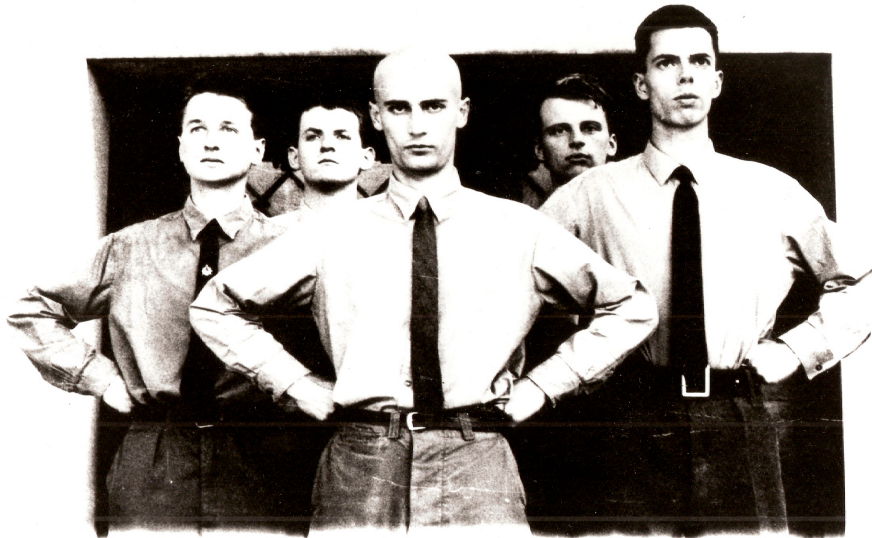
Fig. 1 Laibach, 1984.

operate in, with its own economy, an international network, and brilliant strategies of self-promotion – in short, everything the official institutions lacked. What I as a young director wanted to do together with my colleagues in the early 1990s, was to rearticulate the role of the museum, to make a stand against the war in the Balkans, and to define our international context. Moderna galerija found a suitable partner for this in the NSK parallel system rather than in the official national cultural policy. In this, perhaps peculiar way, the institution and its critique ended up on the same side.