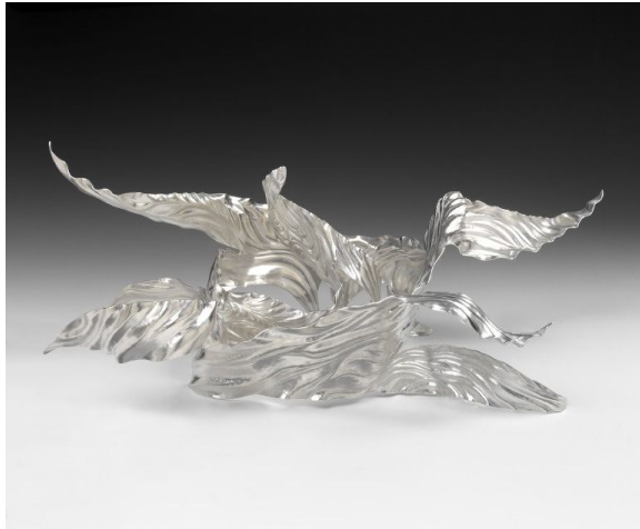
Fig. 9: 'Union' Centrepiece, designed and made by Miriam Hanid, 2013, silver, raised and chased, Victoria and Albert Museum, London, no. M.1-2013.