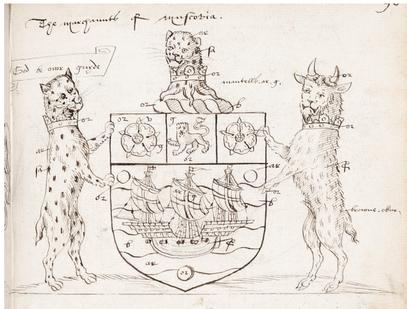
Fig. 8: Sketch for the Coat of Arms of the Muscovy Company, about 1555, pencil, College of Arms, London.

the early Romanovs and the re-establishment of trading and diplomatic relations under the Restoration of the British Monarch during the reign of Charles II (1660-1685). From royal portraits, costume and jewellery to armour and heraldry, Treasures of the Royal Courts told the story of diplomacy between the British Monarchy and the Russian Tsars through more than 150 magnificent objects. In addition to the rarely-shown painting of Elizabeth I (now on loan to Tate Britain), Shakespeare's First Folio, a suit of armour tailor-made for Henry VIII generously lent by Her Majesty the Queen and the legendary ruby-studded Drake Star jewel presented by Queen Elizabeth I to Sir Francis Drake. The V&A and Moscow Kremlin exhibitions revealed the spectacular world of kings, queens, merchants and courtiers from 1509 to 1685. In Moscow the Golden Age of the English Court attracted 146,000 visitors; in London, Treasures of the Royal Courts achieved 76,000 visitors. The combined visitor numbers of nearly quarter of a million reflects the exciting design provided by specialist colleagues at both museums. In Moscow, the visitors' excitement was enhanced by dramatic displays directed by Elena Tarasova in the historic contemporary settings of the One Pillar Chamber and the Belfry Chamber which are linked across the Kremlin courtyard with its dramatic