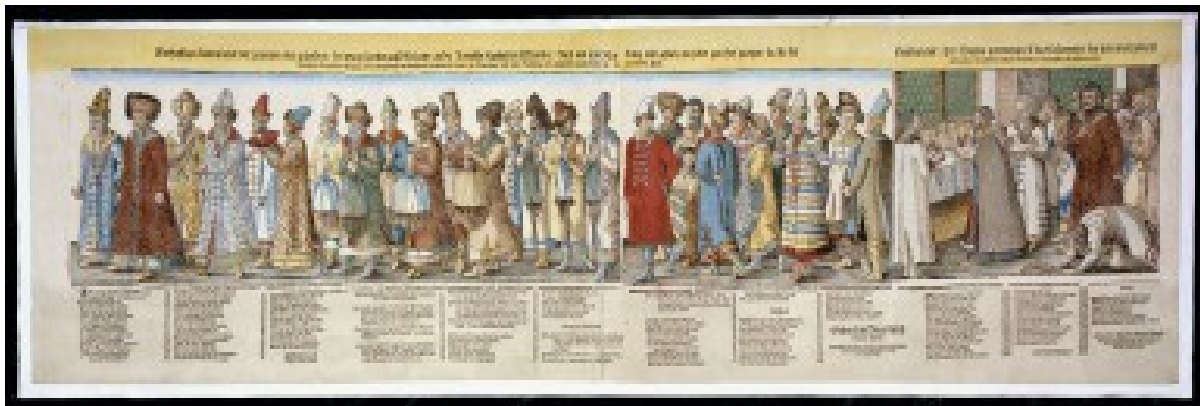
Fig. 5: The Russian Delegation to the Holy Roman Emperor Maximilian II at Regensburg in 1575 , engraving, copy of a 16 th century German woodcut, London, Victoria and Albert Museum.

with a banquet, which cost 200 pounds, as I was assured.[8]