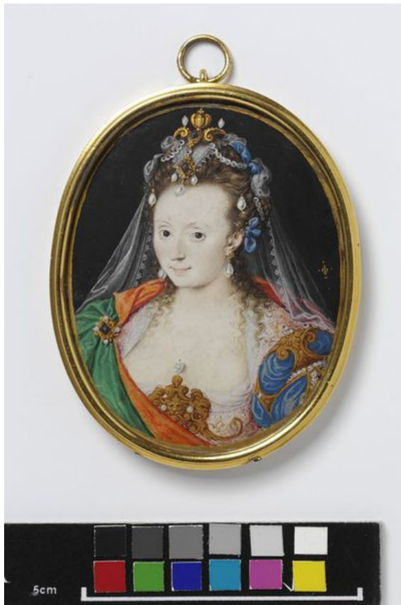
Figure 2: Isaac Oliver, Unknown Woman in a Masque Costume , 1609, watercolour on vellum stuck to plain card, Victoria and Albert Museum, London, P.3-1942.

Portrait miniatures first appeared at the English court in the 1520s. Painted in watercolour on vellum these tiny portraits developed from the art of decorating handwritten religious books. Few miniatures survive from before the 1560s. Many of the surviving miniatures are of royal sitters and served as diplomatic and personal gifts. The art developed from the 1570s in the hands of Nicholas Hilliard, whose patrons included Elizabeth I and her courtiers, as well as wealthy London merchants. At the V&A the opportunity to show selected miniatures and jewellery in the exhibition provided an introduction to the South Kensington museum's permanent galleries of portrait miniatures and jewellery, encouraging a wider audience to engage with these collections.