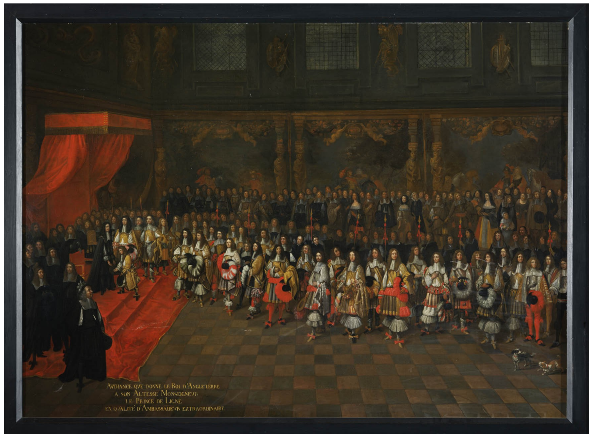
Fig. 7: Charles II Receiving the Spanish Ambassador in 1660, attributed to François du Chastel, oil on canvas, Southern Netherlands (now Belgium).

other supporter is an aple, a beast that resembles a bull, but has a bear's tail, perhaps then thought to be a Russian beast. When Sir Jerome Horsey represented Queen Elizabeth at the Russian Court in 1587 he presented the Tsar Fyodor with "a goodly white Bull all spotted with natural black dapples, his gorge hanging down to his knees, washed with sope and sleeked all over, with a green velvet collar studded and a red Rose, made to kneele before the Emperor and Empresse". [10] Was this unusual beast intended to represent one of the supporters of the Muscovy Company?