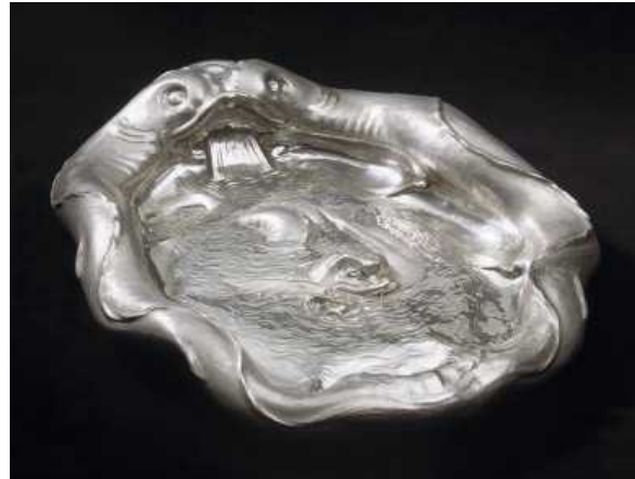
Fig. 10: The Dolphin Basin, Christian van Vianen, 1635, Victoria and Albert Museum, London, no. M.1-1918.

equivalent in sophisticated diplomatic gifts in precious metal. The V&A commissioned the young British-born goldsmith Miriam Hanid to make a piece of table silver (fig. 9) in response to the silver dolphin basin made by Christian van Vianen, goldsmith to Charles I in 1635 which was also included in the exhibition (fig. 10).