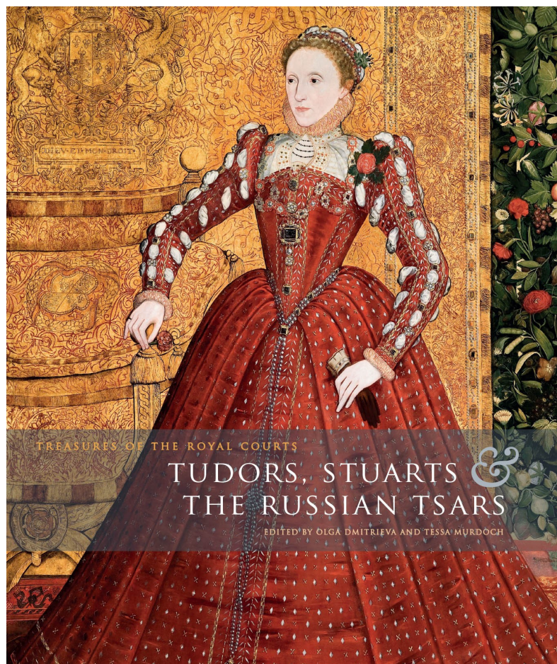
Fig. 1: Elizabeth I (The Hampden Portrait), attributed to Steven van Herwijck or otherwise Steven van der Meulen, c. 1563, oil on canvas, Private Collection (currently on loan to Tate Britain), as shown on cover of V&A exhibition publication.

The Golden Age of the English Court from Henry VIII to Charles I , Moscow Kremlin Museums, 27 October 2012 to 17 th January 2013 --- Treasures of the Royal Courts. Tudors, Stuarts and the Russian Tsars , Victoria and Albert Museum, 9 th March to 14 th July 2013