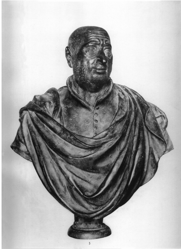
Fig. 1: Giulio Mazzoni (?). Bust of Francesco del Nero, bronze, Berlin.

ed. 10 We have covered the intricacies and perplexities of this story elsewhere. 11