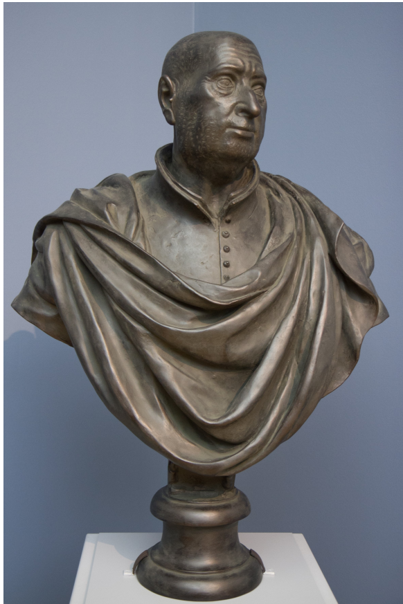
Fig. 3: Modern plaster cast in the halls of the Bode-Museum, 2015.

what befell their eyes (Fig. 6). Inferior, shoddy workmanship during the bronze casting process (and not the subsequent fire damage), leading to holes and other defects everywhere in the sculpture, was detected. Visible seams from a multi-part mold used for the casting process, most evident around the eyes and ears of the model, spoil the bust and make the plaster copy with its muted contours somewhat preferable aesthetically. Regardless of whether these defects were caused by the imperfect bronze casting technique available to the craftsmen in the 16th century, or just exacerbated as a result of heat and war damage, the aforementioned comparison has motivated us to put the attribution of the bronze bust under closer scrutiny.