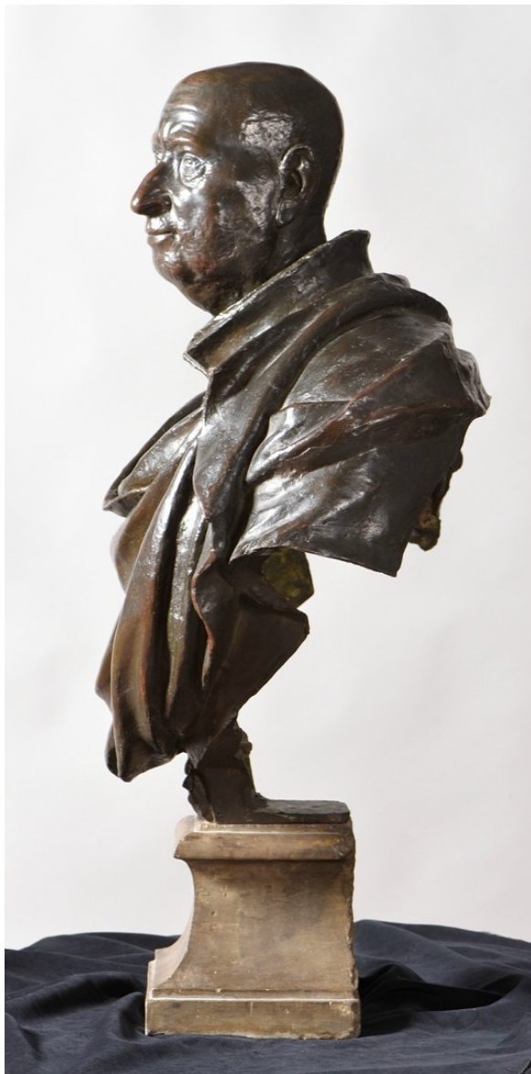
Fig. 11: Portrait of Francesco del Nero (here referred as 2nd bronze version).

marble bust itself – the corners have been added along two sides, as can be seen in the photograph (Fig. 8). This, in turn, is most logical if indeed the marble is the original one described by Vasari – and it is as such that it is featured in August Griesebach’s 1936 book dedicated to portrait busts in Roman churches. 47 Or, for that matter, in Arturo Pettorelli’s 1922 monograph on Giulio Mazzoni, which disregards the Berlin bust completely but gives eloquent praise to the marble: