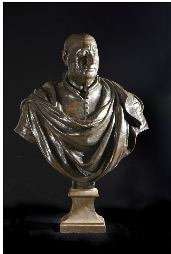
Fig. 10: Portrait of Francesco del Nero (here referred as 2nd bronze version).

Michelangelo, as Charles Davis rightfully notes in his paper investigating the probable Bartolomeo Ammannati participation in the tomb design. 45 The more harmonious design of Michelangelo's drapery details is much closer in execution to the marble bust of Del Nero on the tomb and not to its bronze counterpart. The awkward stand-up collar of the latter looks like a simplification in comparison, made by a less-than-stellar copyist for reasons of practicality – simpler cast shape, easier casting process.