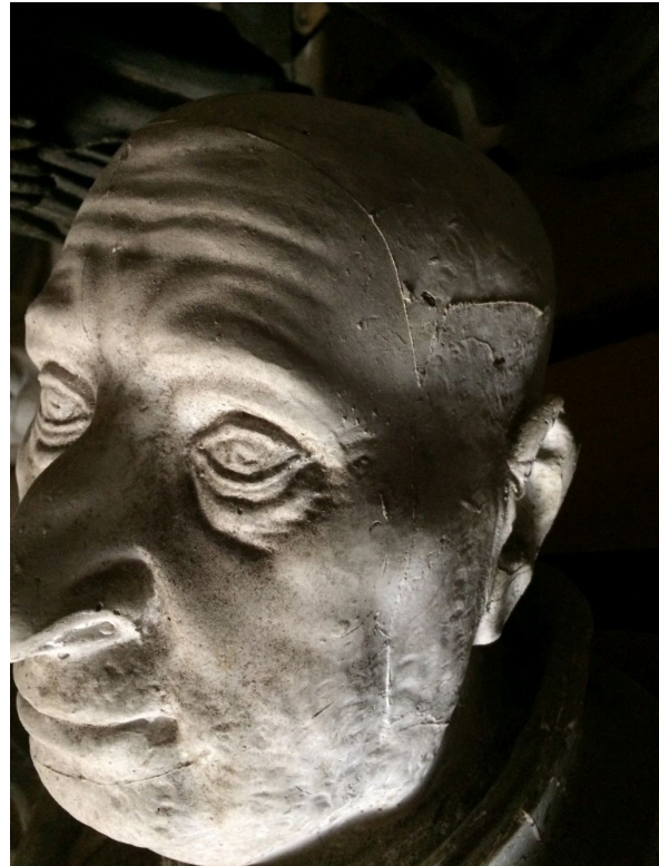
Fig. 14: Plaster cast in the Palazzo Mozzi.

cussed above. 52 Unlike the pristine Berlin Gipsformerei-copies, this one was never brought to completion, left unfinished, unpainted, devoid of a mount, and was subsequently broken on the sides (Fig. 13). Crude, visible seams of a composite casting form on the surface of the plaster were left untouched. Why is it there? What was its original purpose?