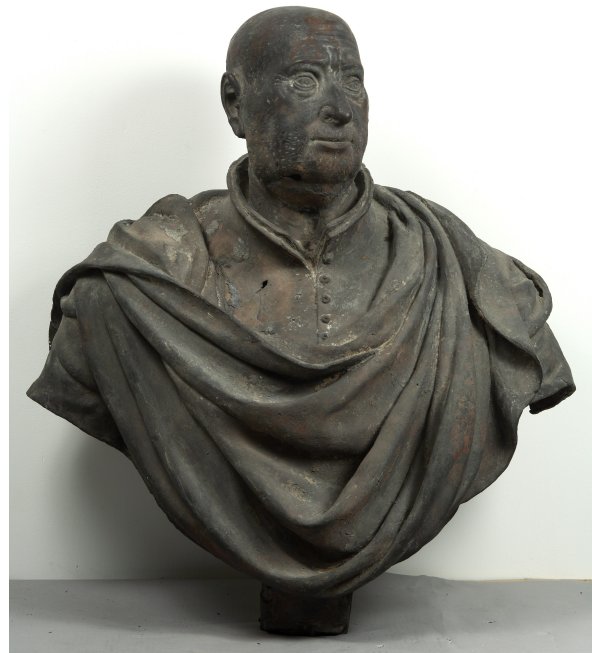
Fig. 4: Bust of Francesco del Nero, SKS 2261/3C-224, before the restoration, 2015.

Who is the author of the bronze bust and what is it? The answer should of course to be found in three subsequent editions of the Berlin catalogues of the Italian bronze sculptures. According to Bode's 1904 first edition, and the 1930 posthumously published last pre-war edition, as well as in Fritz Goldschmidt's 1914 interim rendition of the same, the bust is representing Francesco Del Nero, papal treasurer to pope Clement VII Medici, and comes from the Palazzo Del Nero (Torrighiani) in Florence, being acquired in 1895. 17 This last provenance detail is extremely important in itself. Torrighiani palace, expanded and rebuilt in the 19th century, has incorporated the older Palazzo del Nero dating back to 1530's, thus allowing both Bode and present-day scholars to identify the Berlin bust with a documented portrait of the sitter that stood in his family home. 18 According to the 1914 catalogue of Goldschmidt, a reworked marble version, made later and lower in quality, was put on the grave of Francesco del Nero in the Santa Maria Minerva church in Rome. 19 Interestingly, the 1930 Bode catalogue drops this "lower in quality" definition completely.