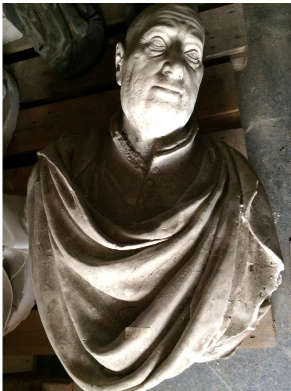
Fig. 13: Plaster cast in the Palazzo Mozzi.

been sold at Sotheby's Monaco auction in 1986, resurfacing most recently on a smaller art auction in France. 50 Extremely similar in overall appearance and patina colour, it differs from the Berlin version in a few areas, the most obvious being the mounting system with a quadrangular base made of Florentine stone (Figs. 9, 10). No information about the provenance is given by either of the auctioneers. While the attribution to Mazzoni is expressed with a degree of uncertainty in all cases, the proposed dating is still 16th century. Which one, if any, is the original mentioned by Bocchi?