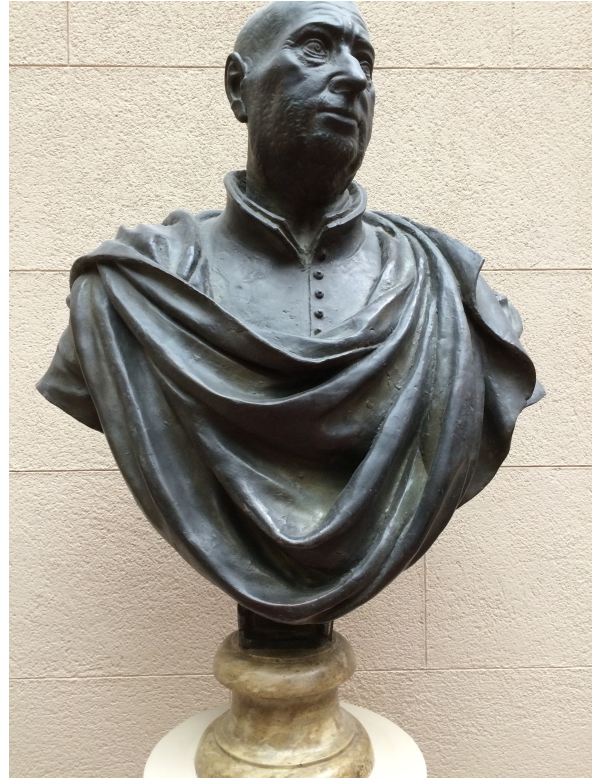
Fig. 2: Plaster cast of Berlin SKS 2261, 1899-1912, Moscow, Pushkin State Museum of Fine Arts.

gether in the Italian Hall seemed like a good idea (Fig. 4).