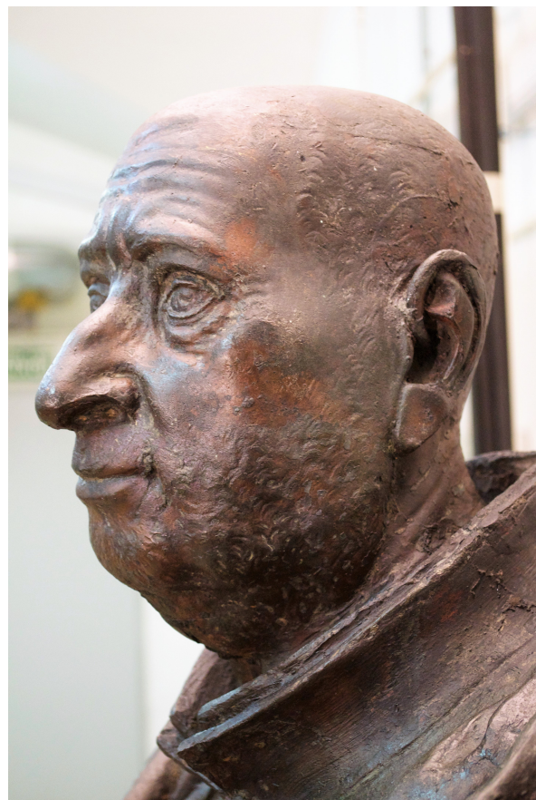
Fig. 6: Bust of Francesco del Nero, SKS 2261/3C-224, after restoration, 2016. Close-up view of head showing cast seams.

nal Capodiferro, producing admirable works there, not in stucco only but in painting also, stories namely, both in oil and fresco; and these have procured him high commendations which are fully merited. The same artist has executed the bust of Francesco del Nero in marble, a portrait taken from life, and so good a one that it does not seem possible to produce a better, from all which we may fairly hope for him the most distinguished success; nay there can be no doubt but that he will ultimately attain to the highest point of perfection in our arts.” 21