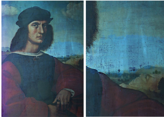
Fig. 11: Miquel Herrero: Copy of the Agnolo Doni, after Raffaello; 2014; oil on panel. 44 x 59 cm. Centre d'Art d'Època Moderna, Universitat de Lleida (CAEM archives). Ultraviolet Fluorescence UVF image, and detail. A noticeable varnish cleaning is visible on the sky at the right side of the figure, in its face and in the dress. This is a didactic reproduction for the students of the Master in Expertise, Evaluation and Analysis of Art Works Degree, Universitat de Lleida (Spain).

But forgers usually pay attention to the varnish, since it constitutes the real skin of the painting, especially when working with flat surfaces like those provided by panels, on which an enameled appearance is expected. They usually prefer an old looking varnish over the painting in order to enhance and warm the colors, to get a tonal improvement that properly integrates all the parts, and especially to mask the painting layers.