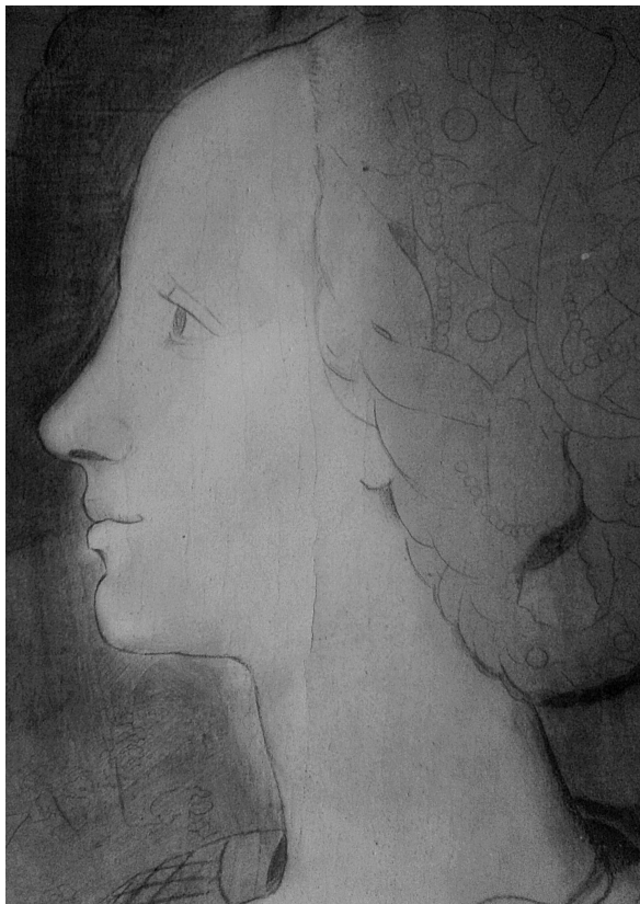
Fig. 9: Miquel Herrero: Copy of the portrait of Simonetta Vespucci, after Piero di Cosimo; 2014; mixed technique on panel. 46 x 55 cm; Valencia, Private Collection. Detail of underdrawing, done with a charcoal tracing paper.

temperature exposition and humidity are also used with these aims, although their power of alteration is not so visually effective, and while these elements can cause the degradation paint layers, they are difficult to control. Friction, abrasion and other calamities are carried out over the surfaces to wear them, many times with no logic at all. Getting dirty or oxidized tanned tones used to be an easy trick for forgers, who sometimes applied inks, dirty water solutions, or walnut stains over the painting before the varnishing.