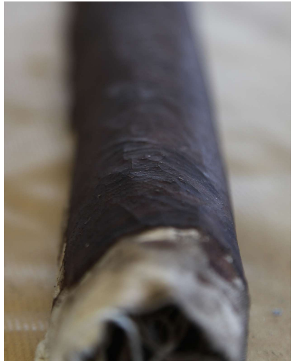
Fig. 15: A rolled canvas, already prepared and cracked. Centre d'Art d'Època Moderna, Universitat de Lleida (CAEM archives). This is a didactic reproduction for the students of the Master in Expertise, Evaluation and Analysis of Art Works Degree, Universitat de Lleida (Spain).

Other times, cracks are produced with the canvas mounted over the stretcher. The forger applies the preparation to the canvas that is partially loose and lets it dry. Then they tighten the canvas using the keys, until a certain point. This usually causes the typical stretcher cracking, developed in the painting's corner in a diagonal sense, and caused by overtightening. After this first tension, dents, impact crackles, or stress cracks are very often produced by pushing the canvas from the back, what causes certain deformation of the cloth, warping, and cleaving. When a canvas is totally stiff and well dried, it becomes extremely brittle, and applying pressure from its rear with a soft rubber ball can cause spider-web patterns of cracks. 54 After this, the cloth is tightened again in the stretcher, which almost always means that the inner space between cracks increases, hence making the lines more evident.