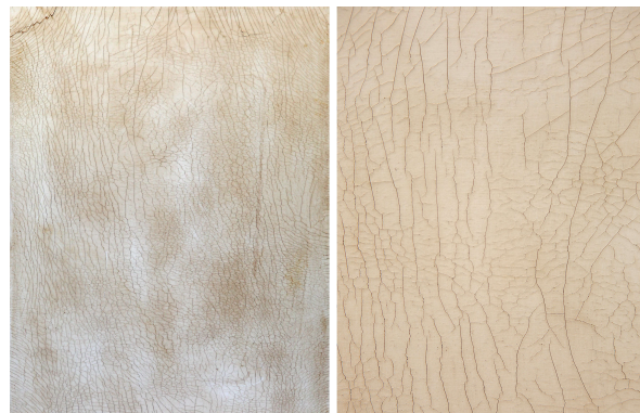
Fig. 6: Example of physical-mechanical cracking of the gesso on a panel, as a result of quick changes in humidity and temperature. Although the cracks grow randomly and look natural, their appearance is not that of a common aging pattern for a panel. Centre d'Art d'Època Moderna, Universitat de Lleida (CAEM archives).