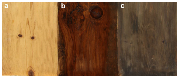
Fig. 2: Three examples of wood along a simulated process of aging. a) A plain pinewood support. b) Pinewood dyed with walnut stain. c) Application of ashes while the stain dries. Centre d'Art d'Època Moderna, Universitat de Lleida (CAEM archives).

common for this purpose since they have a moderated tanned tone that can be increased by repeating the application. 13 In addition, they dry quickly (especially if solved in alcohol) and do not smell. A dusty effect is generally achieved by adding ashes (Fig. 2). However, a stained wood is not a real old wood, and there are always elements that warn the perception and lead us to suspect of it. 14 Smoking the whole support is also a very common trick. 15