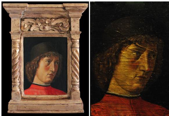
Fig. 4: Miquel Herrero: Reproduction of a head after Domenico Ghirlandaio; 2014; mixed technique on panel. 21 x 30,5 cm; Valencia, Private Collection. (photo by Nemesio Jiménez). An example of reproduction with cracks texture. Tents are induced in the preparation and then covered by painting to achieve a non flat surface effect, as it can be observed on the right image taken with a vertical racking light. This is a properly identified museum quality reproduction, documented and dated, not to be confused with an original or with a forgery.

The consequence or result of each aging method is different and depends on which stage of painting these techniques are applied at. Experienced forgers cause these alterations when the wood has already been covered with the gesso and the priming layers, but before starting to paint. 17 They are conscious that if they do it just for the plain wood, much of the alterations that they'll obtain will then be covered and masked by the gesso. Instead, if they wait for the painting to be finished, they can experiment a certain lack of control in the aging, causing important damages to the paint layers and alterations that they cannot really control. Depending on the way they induce aging, the selection of materials becomes crucial. But, even if this is the most followed methodology, when cracks are induced before painting, it's very easy to inadvertently partially cover them, 18 as can be easily observed if a sample is taken for a cross-section study, 19 but even by looking through a magnifying glass, since paint layers do not correspond with the gesses' crackle action (Figs. 4 and 5).