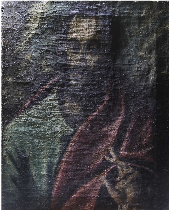
Fig. 16: Unknown: Apostle (imitating the style of El Greco); 19 th century; oil on canvas; 52,5 x 42 cm. Catalonia, Private Collection. Centre d'Art d'Època Moderna, Universitat de Lleida (CAEM archives). Detail of the image taken with vertical racking light. Horizontal tent crack-lines produced by the rolling of the canvas are noticeable.