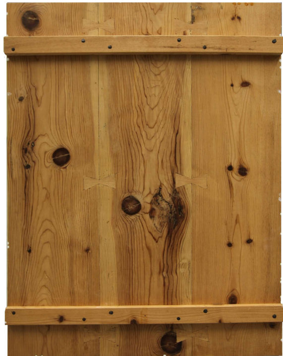
Fig. 1: Reverse of a new wooden panel assembled imitating a Spanish Renaissance panel with Italian inspiration, like those found in la Corona de Aragón. Three vertical boards of pinewood have been assembled with dovetails, and reinforced with horizontal slabs. The color of the wood is still light, since it is not a historic panel. Centre d'Art d'Època Moderna, Universitat de Lleida (CAEM archives).

operations can be done only for the assembled panel, when it is still covered with a gesso ground, or finally for the whole finished painting. As will be discussed in the next section, this used to be done when the gesso was already applied. But the bending of a board or panel can be achieved by exposing the wood to humidity and mechanically causing bending or, if the board is not very thick, by applying several layers of a strong organic glue (like a skin size) on one of the sides. When this glue is hot and liquid, it penetrates a bit into the pores, and when it starts to dry and gets colder it usually contracts. The more layers are applied the stiffer it becomes, and the more strength it has, the strain then increases and causes the natural bending of the wood.