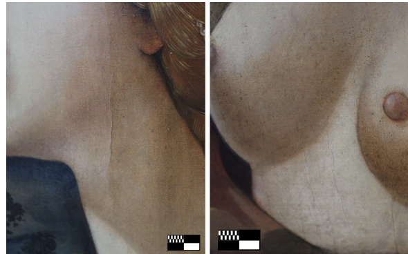
Fig. 5: Miquel Herrero: Copy of the portrait of Simonetta Vespucci, after Piero di Cosimo; 2014; mixed technique on panel. 46 x 55 cm; Valencia, Private Collection. Detail of a split of the wooden support (left) and cracks in the preparation (right). This is a properly identified museum quality reproduction, documented and dated, not to be confused with an original or with a forgery.

or even a blend of both. They can also contain other materials like ash, earthen pigments, or white lead, depending on recipes. But their mechanical behavior is very similar in all the cases. The glue and the mineral filler form a gesso putty that is susceptible to cracking when it cools and dries, and when it is exposed to movements of the support. Such movements can be caused by many methods: either by mechanical actions or by environmental reactions to humidity and temperature. All this results in the forming of a special net of crackles, that are often independent of the wood grain. Such cracking nets have been described sometimes as premature drying results, 21 but they are, in fact, a product of changes in humidity and temperature (Fig. 6).