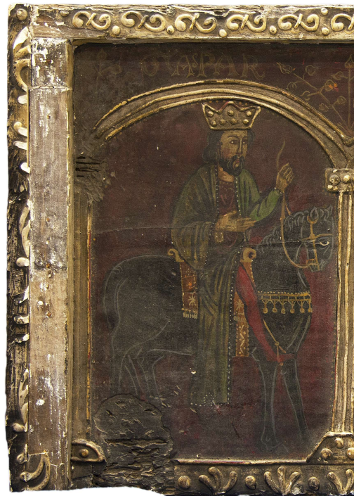
Fig 10: Unknown: Copy of a fragment of the Altar Frontal of Santa Maria de Mossoll; 20 th century; mixed technique on panel. Catalonia, Private Collection. Centre d'Art d'Època Moderna, Universitat de Lleida (CAEM archives).

Since almost every painting on panel has been varnished at least once, it is very frequent to find this element associated with paintings on this support. In fact, it is very typical to find many overlapping varnishes in imitations and forgeries of Medieval and Renaissance artworks. Some of the layers may have been applied by the forger if it is not an old piece, and others can be the result of actions carried away by their owners to improve the appearance of the artwork. Sometimes even selective cleanings of varnish are found (Fig. 11).