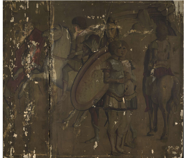
Fig. 14: Unknown: Riding Soldiers and Infantry (imitating the Renaissance style); 19 th century; tempera on panel; 50 x 57,5 cm; Inv. CL.1 n.1101; Venezia, Museo Correr (Verona, LANIAC, Università di Verona/Venezia, Museo Correr). Notice the dirt and tan colour achieved by smoking the surface.

even if all other parameters are the same. Thus, the canvas as a support can reveal a great amount of useful information that partially serves to verify its age and possibly its provenance. This has traditionally been used as an analytic evidence, and forgers know it.