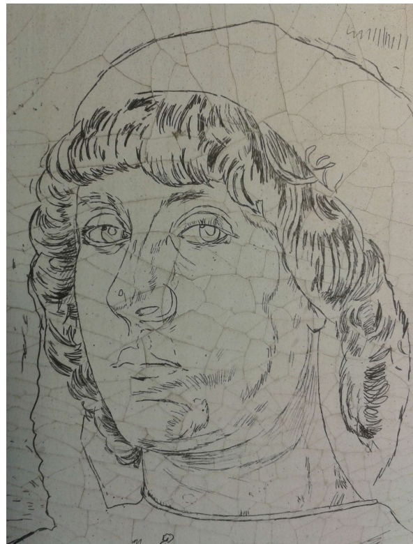
Fig. 8: Detail of a cracked panel with the drawing already on it before the phase of colouring.

Putting aside the question of the selection of material and procedures, it's also a fact that color layers are difficult to age, especially when the support is panel. Unlike gessos and chalk grounds, paint (tempera or oil) is much more flexible and it's difficult to produce cracks on it. There are plenty of ways to achieve these results, but none of them is really effective. Egg temperas are capable of producing subtle cracks, 30 while oil paint on panel, due to its flexibility, is very difficult to crack. Even when craquelure is achieved, they do not seem real because they tend to affect only the paint and not the gesso layer, as is common in historic paintings. The addition of drying agents to quickly accelerate the polymerizing of oil is very common, although these results are very difficult to achieve on panel, and are really easy to obtain when using cloths supports, as will be shown later.