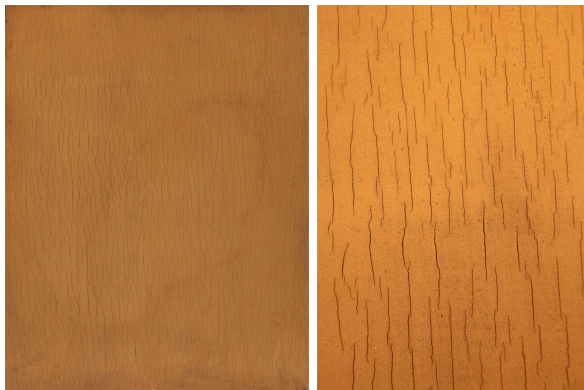
Fig. 7: Example of physical-mechanical cracking of the coloured gesso on a panel, as a result of slow changes in humidity and temperature during a long time. Natural cracks follow the grain of the wood.

As is known, wood supports change in thickness and shape when subjected to changes in humidity, especially those that have been forcefully and drastically induced. Humidity causes swelling and fiber expansion. Gesso cannot respond to such a movement in the same manner, and it starts to split until it finally cracks. On the other hand, drying causes contraction of the fibers, and once more gesso's response is different to wood's. Temperature fluctuation is another important factor, and is generally associated with humidity and often combined with it. High temperatures make the gesso very dry and fragile, with a high chance of cracking. When temperatures below zero pair with humidity, ice causes damage to the internal structure of the fissures making the edges of the cracks rise, and causing something similar to cupping (Fig. 6). In order to highlight the cracks, it is common to find dark dyes in them, such as ink, charcoal powder, or walnut stain. 22 Generally, panels that have been exposed to such extreme environmental conditions often present overcracking. Natural cracks are subtle, thin, and quite moderated, while overaging tends to be a common practice in forgeries for claiming authenticity (Fig. 7). 23