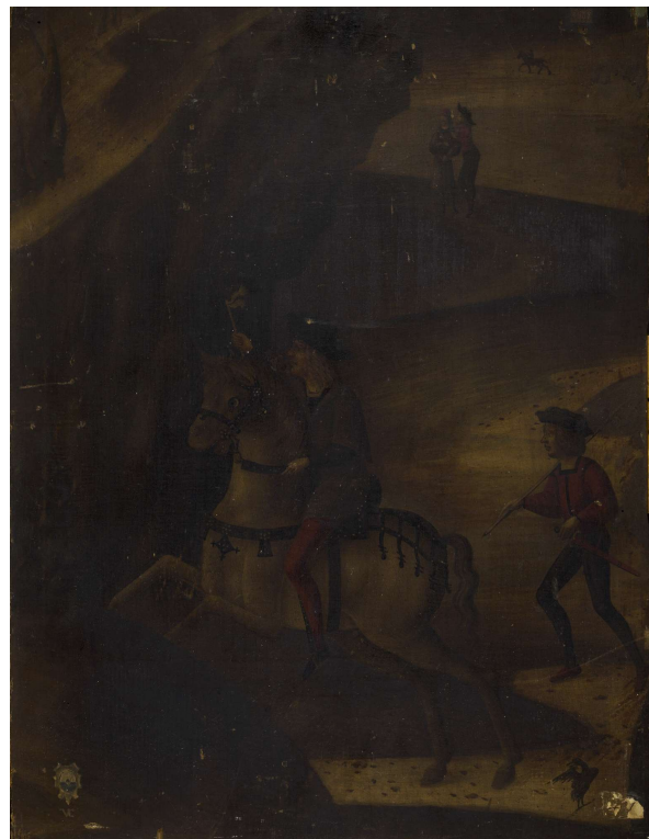
Fig. 13: Unknown: Nobleman on horseback (imitating a Renaissance style); 19 th century; tempera on panel; 57,5 x 43,5 cm; Inv. CL.1 n.1092; Venezia, Museo Correr (Verona, LANIAC, Università di Verona/Venezia, Museo Correr). Notice the dirt and tan colour achieved by smoking the surface.

some pigments that can have their own fluorescence and that will disturb the recognition of bitumen. Great forgers are aware of the real filth that must be on the surfaces, and do not doubt in adding previously collected dust or ashes, especially in the reverse and over the hidden parts (Fig. 2c).