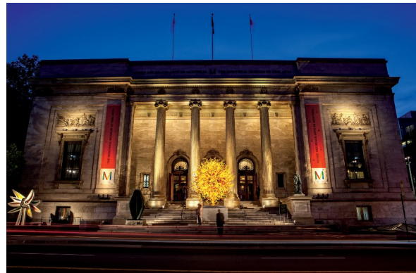
Fig. 1 Michal and Renata Hornstein Pavilion, exterior view; Montreal Museum of Fine Arts; photo: Terry Rishel.

with the cult of art. In this way, the new Canadian citizens performed a ritual in the building of the museum and its collections, compelled by their desire to be seen as civilised and civilising. 5 Traces of their passion not only for Western art, but also for "all things Asian" can be found in the museum reserves.