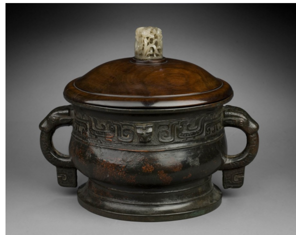
Fig. 3 Bronze ritual food vessel ( gui ), China; vessel, 10 th century BC, lid; 17 th -19 th century CE; 24.6 x 31.6 x 24.2 cm; MMFA Cleveland Morgan Bequest [1962.Ed.35a-b]; photo: MMFA, Christine Guest.

Among the archaeological relics he acquired first for himself and later bequeathed to the museum, is an unassuming ancient Western Zhou bronze gui vessel that provides an interesting tale of migration (fig. 3).