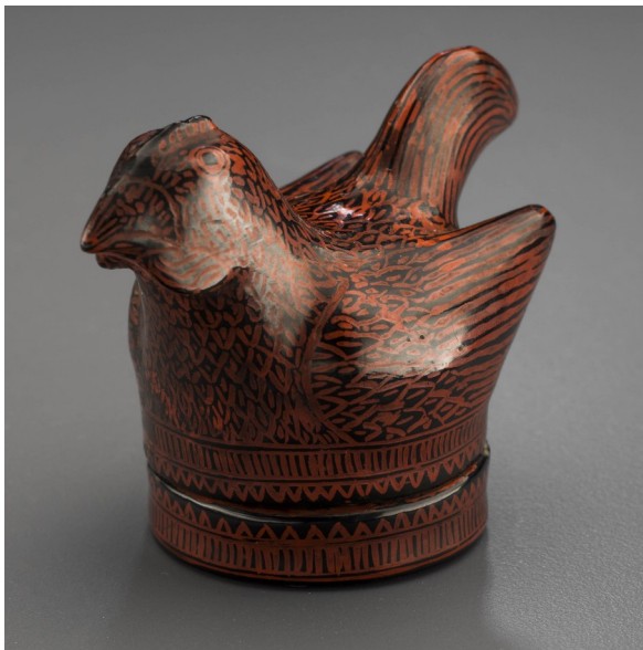
Fig. 9 Incense box ( kōgō ), Japan, Edo period, 19 th century; 5.7 cm; MMFA, gift of Joseph-Arthur Simard [1960.Ee.141]; photo: MMFA, Jean-François Brière.

A well-known political figure in literary and artistic circles in Paris, Clemenceau frequented not only Edmond de Goncourt and Gustave Geoffrey, but also eminent connoisseurs of Japanese art, such as Edward Sylvester Morse. 26 He also associated himself with the influential art critic Philippe Burty, whose kōgō would eventually join Clemenceau's collection (fig. 9). 27