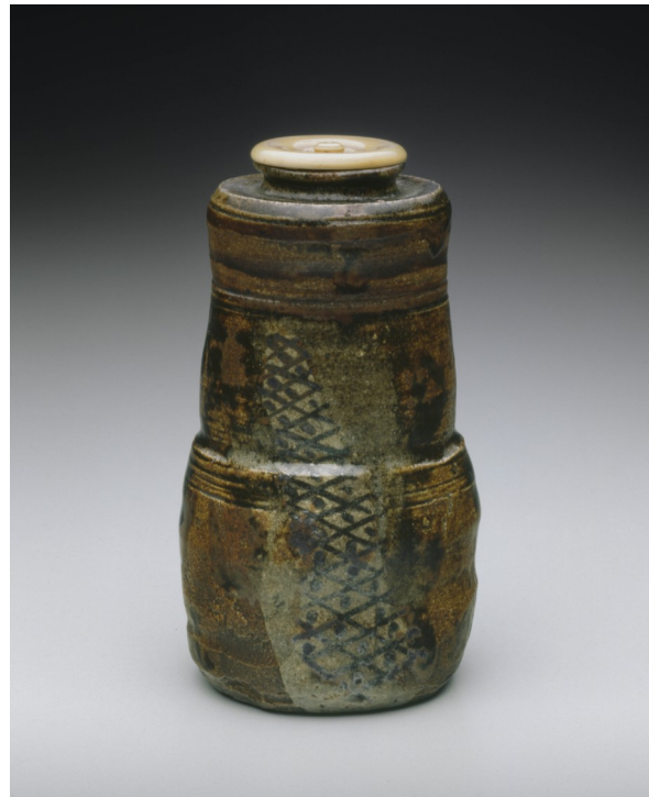
Fig. 8 Oribe-style tea caddy ( chaire ), with ivory lid, Mino, Japan, Edo period, early 17 th century; 11.3 x 6.5 cm; MMFA Cleveland Morgan Bequest [1962.Ee.43a-b]; photo: MMFA, Christine Guest.

By the mid-1940s, hundreds of chaire were stored in our reserve. All had been owned by Van Horne, Strathcona or Morgan, reflecting a taxonomic obsession that was shared. It is not the only taxonomic obsession represented in our holdings.