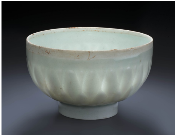
Fig. 11 Porcelain bowl ( qingbai –pale blue-white glaze), Jingdezhen, China, Southern Song dynasty (1127-1279); 7.9 x 12.9 cm; MMFA F. Cleveland Morgan Bequest [1962.Ed.14]