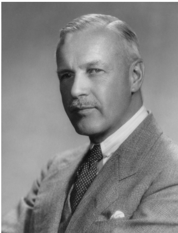
Fig. 2 Ross Ballard, Ashley and Crippe Photography, Portrait of F. Cleveland Morgan , gelatin silver print; Archives of the Montreal Museum of Fine Arts, Photo Archives, MMFA.

It was during its Golden Age, from 1912 to 1947, that the Museum acquired the first Asian objets d'art . In 1916 the Art Association appointed Frederick Cleveland Morgan (1881-1962) chairman of the new museum's section that was to exhibit antiques and modern decorative works, including "all objects tending to the education of the designer and worker". 7 This decision would change the Association's orientation, morphing its profile from a purely western art gallery to a survey museum. Morgan fostered a real momentum: in a trend shared by many North American institutions of the time, a number of rich benefactors bequeathed their possessions, including several Asian works, to the newly established museum.