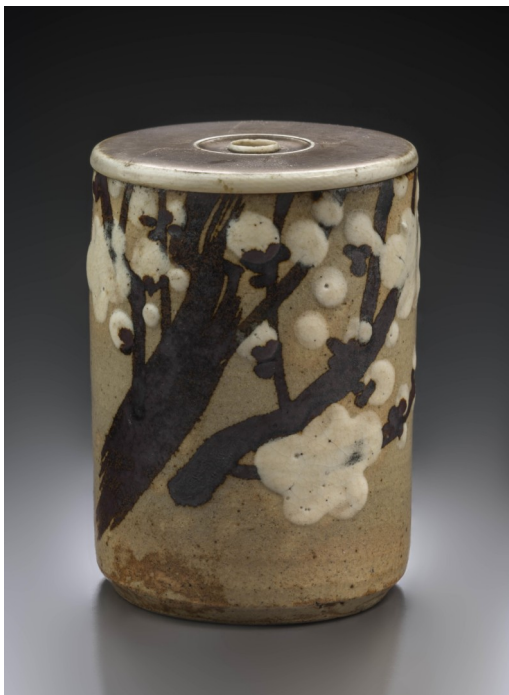
Fig. 5 Stoneware tea container ( chaire ), attributed to Kenzan, Japan, early 18 th century; 6.8 x 4.9 cm; MMFA Adaline Van Horne Bequest [1944.Ee.17a-b]; photo: MMFA, Christine Guest.

Van Horne’s collection was wide-ranging in both quantity and quality: his large mansion included thousands of artefacts, ranging from Japanese export ceramics to Chinese furniture and Anatolian rugs. But his inquisitive mind had a strong penchant for Japanese domestic pottery. His inventory, which he carefully compiled with hand-drawn illustrations and beautiful watercolours, mentioned thousands of objects, including bowls, bottles, water jars, tea caddies and sake cups originally intended for the tea ceremony (fig. 5).