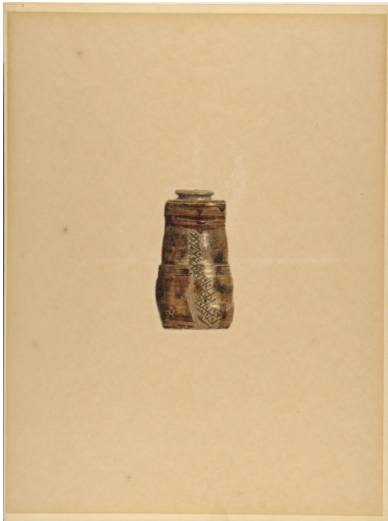
Fig. 7 Oribe-style tea caddy ( chaire ), ink or black and white watercolour, by F. Cleveland Morgan, Montreal 1881-Montreal 1962; 41.1 x 30.5 cm; MMFA Private collection [13.2017]; photo: MMFA, Christine Guest.

Their idea of containable Japanese objects trickled down to the MMFA, as chaire were among the first objects to be collected, perhaps as a tacit tribute to Van Horne’s obsession. Morgan saw Van Horne as his mentor, and followed him not only in collecting tea caddies but also in skilfully painting them (figs. 7-8).