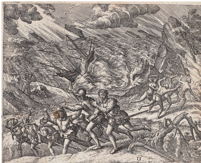
Fig. 6: Theodor de Bry, Ein schrecklich und unerhörtes Ungewitter, engraving, circa 1594, from Benzoni and De Bry, America (Band 4).

and bejeweled, Europeans lacked the experience of Indigenous Caribbeans when it came to the dangers and possibilities of hurricanes. It is telling that one of the earliest known European depictions of a hurricane was made by an artist who never crossed the Atlantic. Belgian-born artist Theodor de Bry included the engraving Ein schrecklich und unerhörtes Ungewitter/Horrenda et Inaudita Tempestatas (a terrible and unheard of storm) in one of his many illustrated books of the late sixteenth century (fig. 6). The print shows us a scene dominated by crashing waves, a sinking galleon, lightning bolts, and dark clouds radiating divine light. Spanish colonists gaze skyward in a penitent gesture in the foreground of the engraving. They flee along a rocky shoreline, strewn with discarded harquebuses. Half-nude Indigenous figures seek shelter under large stones in the background. The events in De Bry's detailed engraving match the accompanying text. A lengthy paragraph describes the horrendous storm, known as Typhon in Latin, Sturmwind in German, and Huracán in Spanish. The text