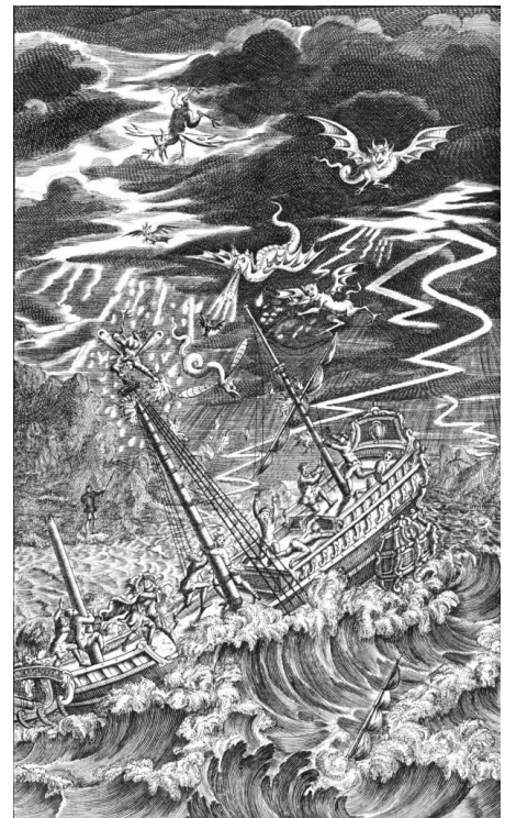
Fig. 9: Elisha Kirkall after François Boitard, Frontispiece to Nicolas Rowe's 1709 edition of William Shakespeare's The Tempest, engraving, 1709.

In Shakespeare's story, an enchanted storm washes the protagonist Prospero and his daughter Miranda onto the