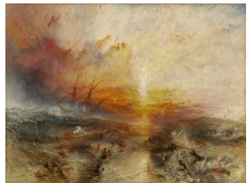
Fig. 11: J.M.W. Turner, Slave Ship (Slavers Throwing overboard the Dead and Dying—Typhon coming on), oil on canvas, 1840.