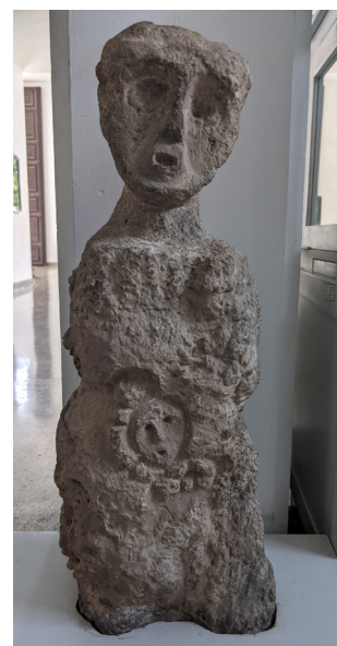
Fig. 3: Stone Idol (Showing Anthropomorphic Figure in Abdomen), incised stone, date unknown.

These older Indigenous Caribbean visualizations of the hurricane stand in contrast to the modernist image of Tufiño's Temporal men-