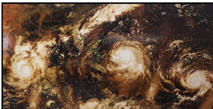
Fig. 14: Teresita Fernández, Caribbean Cosmos , glazed ceramic, 2020. Private Collection.

Fernández's image embodies the multiple chronotopes of the Caribbean hurricane in art and political iconographies. On one hand, we see a modern satellite image, likely to appear on any standard google image search for