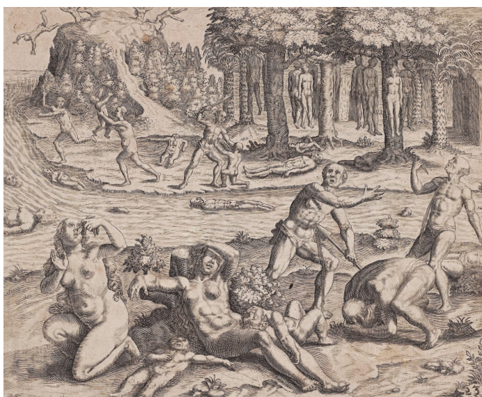
Fig. 7: Theodor de Bry, Indianer können der Spanier Tyrannen nicht länger leiden , engraving, circa 1594, from Benzoni and De Bry, America (Band 4) . Image courtesy of the University of Heidelberg Digital Library. Available at https://doi.org/10.11588/diglit.8296