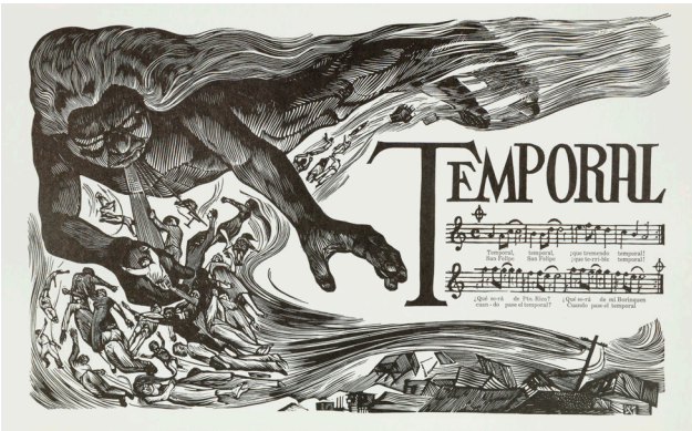
Fig. 1: Rafael Tufiño Figueroa, El Temporal , linocut, 1954. Instituto de Cultura Puertorriqueña Collection, San Juan, Puerto Rico

Blanco. It comprised a series of engravings representing different Puerto Rican folksongs or plenas . Only 850 copies were initially made of the collection. In Tufiño's illustration, a god-like figure sweeps away humble masses of men and women in one hand while reaching for clustered wooden homes with the other. The masculine-appearing deity blows out sublime winds over the multitude and their fragile places of dwelling. Beneath the image we see the rhythmic annotation of the plena itself. With a cut time signature, tied eighth notes, and held whole notes, the melody moves up and down the scale with a satiric beat matching the odd mixture of benevolence and malevolence in Tufiño's depiction of the storm god.