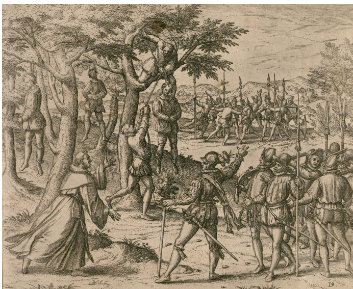
Fig. 8: Theodor de Bry, Columbus straffet die aufrührische Spanier, engraving, circa 1594, from Benzoni and De Bry, America (Band 4).

The engraved image of Indigenous bodies hanging from trees mirrors that of Columbus executing seditionists earlier in the book. The caption explains how Columbus' harsh punishment