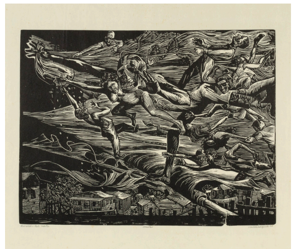
Fig. 13: Carlos Raquel Rivera, Huracán del Norte , linocut, 1955.

The political forces, whether US capitalists or local caudillos, that drove those post-disaster building projects would no less threaten the region’s most vulnerable populations for generations to come. Puerto Rican printmaker Carlos Raquel Rivera thus justly represented one such storm in his mid-century linocut Huracán del norte , (Northern Hurricane), as a visible metaphor for the ruinous effects of US-style capitalism (fig. 13). Like the