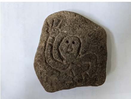
Fig. 4: Stone Idol (Showing Anthropomorphic Figure with Arms Surrounding a Central Head in Counterclockwise pattern), incised stone, date unknown.

Famed Cuban ethnographer Fernando Ortiz was among the first to discuss these enigmatic Indigenous objects in his book El Huracán: Su mitología y sus símbolos . The book appeared less than a decade after Ortiz coined the now widely used term "transculturation" – an influential if not controversial concept of cultural intermingling that sought to explain the African, European, Asian, and Indigenous origins of Cuban culture (Ortiz 1940). Expanding on his theories of transculturality, Ortiz suggested various cultural interpretations of the spiral-armed figures (fig. 4). They were symbols of a swirling dance; of fertility; of birth. He even wondered, anachronistically, if they could be a representation of Buddha and the divine cycle of life, death, and rebirth. The Cuban polymath ultimately decided that these figures encompassed all those elements (Ortiz 1947, 33-43). They were reifications of a sublime force better known as the Atlantic hurricane – a Caribbean agent par excellence of cultural and natural destruction, creation, and recreation.