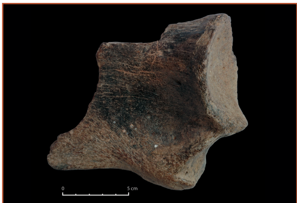
Colour-Fig. 1: Fossil Rhino partial scapula.