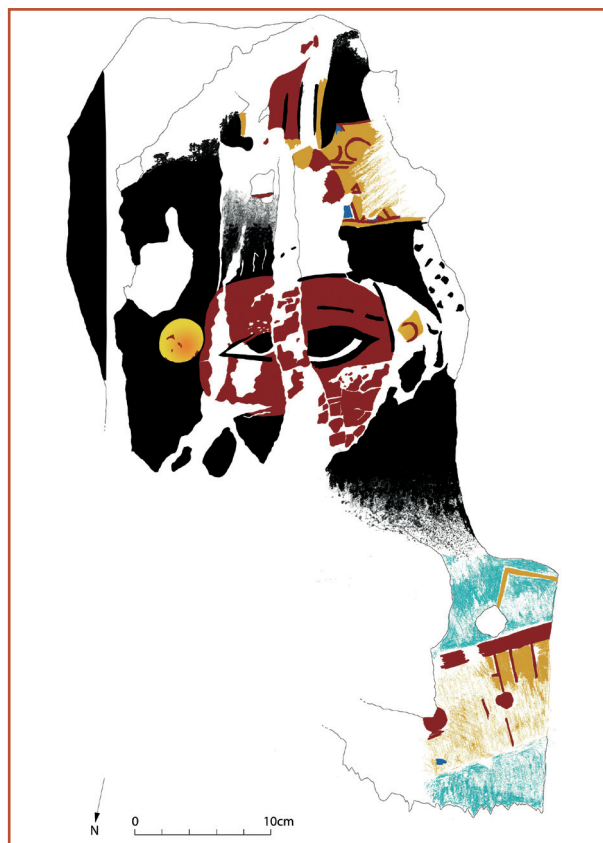
Colour-Fig. 7: Coffin mask (F8110) found in western chamber of tomb G309, Drawing by Elisabeth Greifenstein/Claire Thorne.