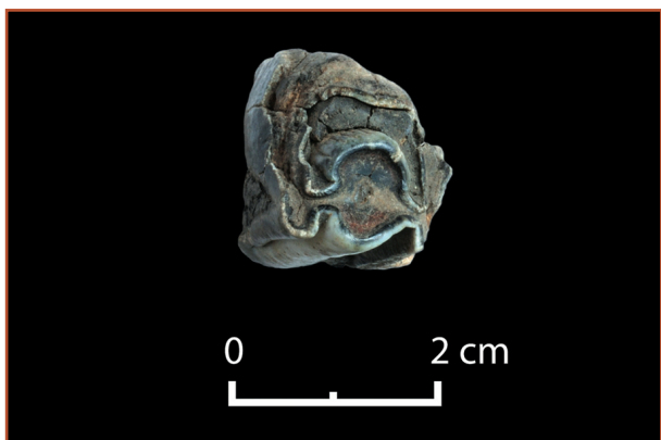
Colour-Fig. 3: Fossil Bovid tooth (occlusal view).