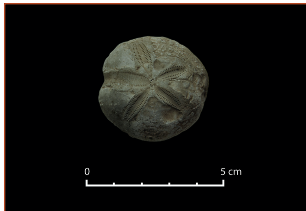
Colour-Fig. 5: Fossil sea urchin.