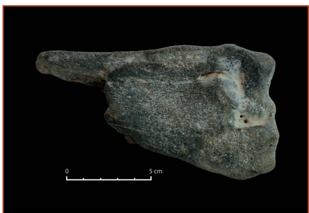
Colour-Fig. 2: Fossil Cameloid radioulna.