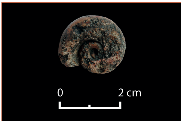
Colour-Fig. 4: Fossil Ammonite.