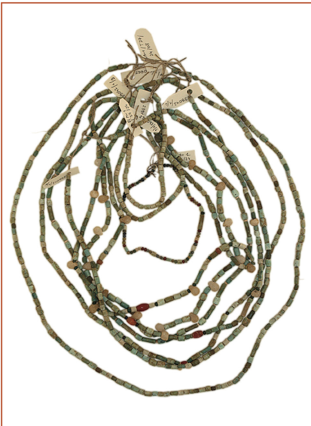
Colour-Fig. 1: Beads associated with a female burial from the Early Makurian site El-Ar

Titelbild: Grave I T 87 at Sedeinga: Ceramic and bronze vessels associated with Individual 4.