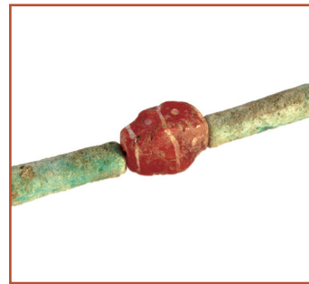
Colour-Fig. 2: 'Etched' carnelian bead from the Early Makurian site El-Ar