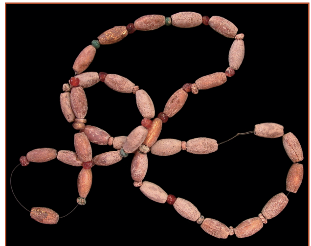
Colour-Fig. 3: Grave I T 87 at Sedeinga: Necklace.