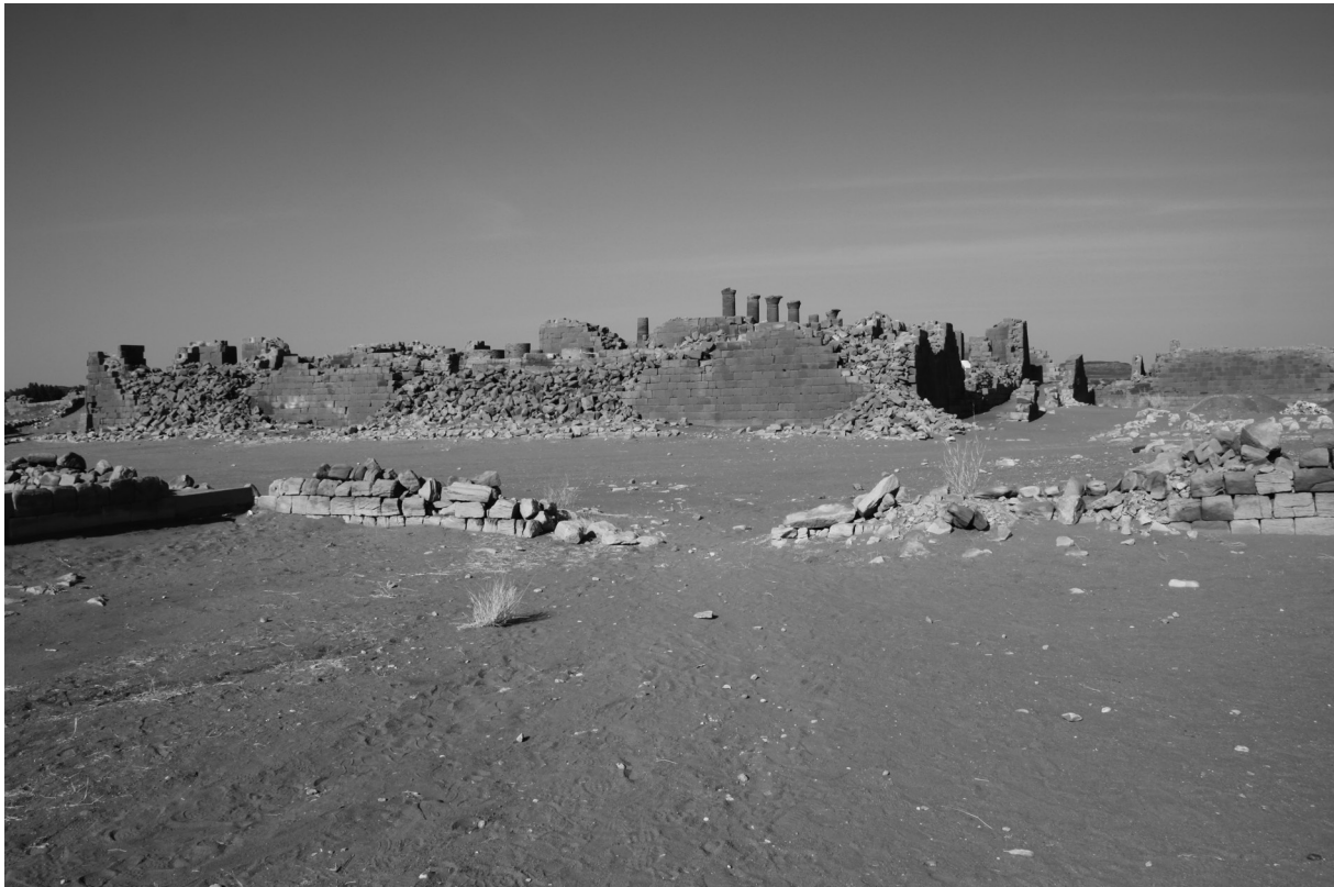
Fig. 11: Wall 117/304 with the gate towards courtyard 117 prior to conservation measures

307/E (2008) and 307/N (2009) to the current conservation-restoration strategy. 20 On the basis of the findings of condition mapping at the Great Enclosure and the planning of a visitor guidance system (see above), the western wall of courtyard 304 with its gate to courtyard 117 was identified as a major point of concern as this area will become part of the main visitation route envisaged for the monument. The wall in question was in a poor state of preservation and sections of it were only visible above ground as rubble heaps (fig. 11). The movement of larger numbers of visitors through this area would have necessarily led to further destruction of these remains. The aim of the conservation-restoration project therefore was to expose and clearly identify the ancient building substance, to consolidate it in situ and rehabilitate the ancient gateway in a way that makes it safely and sustainably usable for visitor movement without endangering the original substance and evoking its further loss.