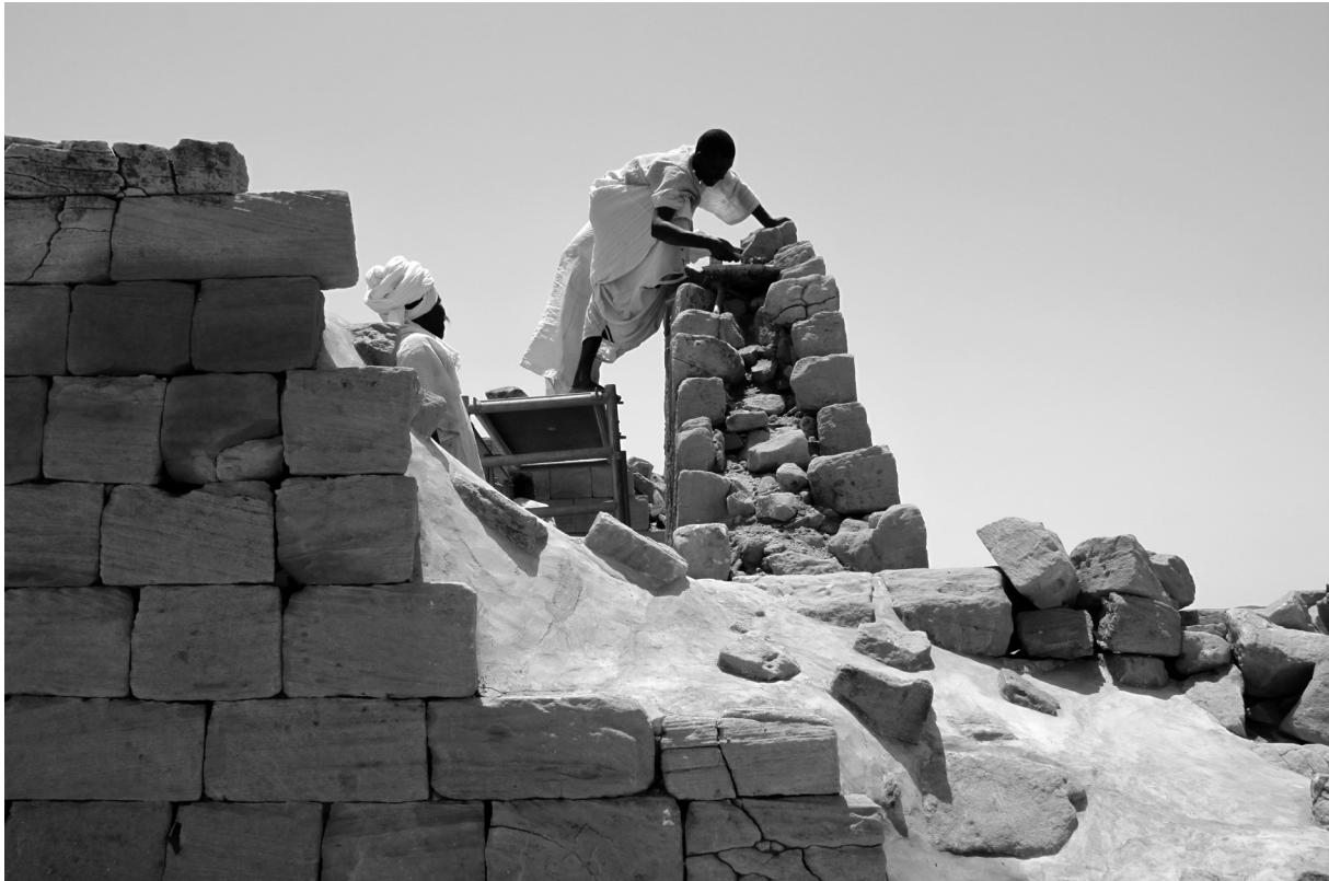
Fig. 14: Applying a lime mortar covering to an open wall top in Complex 200; in the foreground a wall top after treatment