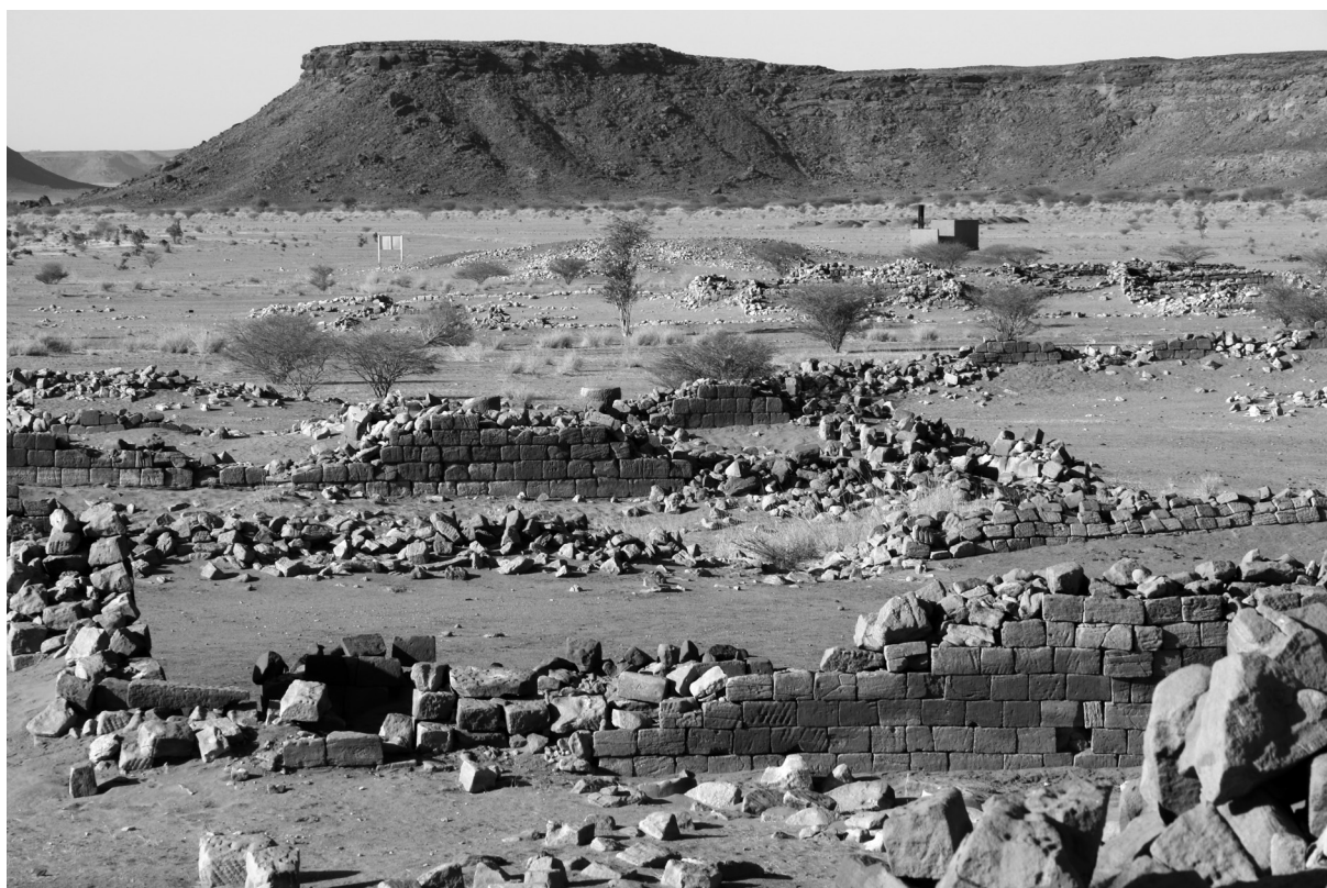
Fig. 2: View over the southern part of the Great Enclosure towards the Small Enclosure (I B) and the kom of debris from the excavation of the latter monument in the 1960s

ture change, corrasion (i.e. abrasion) through aeolian sand erosion as well as pressure relief. Missing capstones are the main reason for the loss of bond and the collapse of walls, which allow rain water to seep into the walls and destabilise their filling of earth mortar and rubble stones. Rain water also destroys the structure of the sandstone blocks by the mobilisation of soluble materials. Desquamation effects (i.e. the flaking of the outer block surfaces), are caused by daily temperature changes, whereas exfoliation along the block edges is caused by pressure relief. Other mechanical damage is mainly caused by animals, primarily goats and donkeys, and to a lesser extent by visitors (fig. 1).