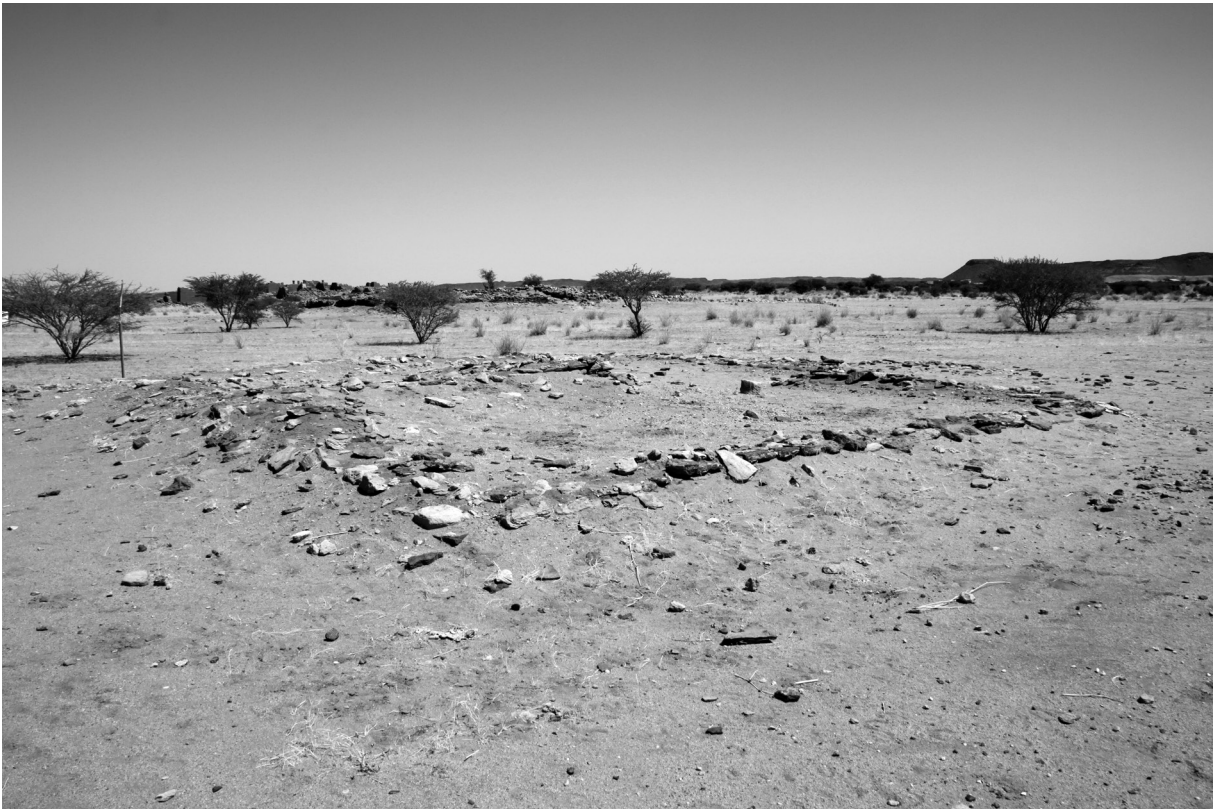
Fig. 4: The Smallest Enclosure (I C) south of the Small and the Great Enclosures