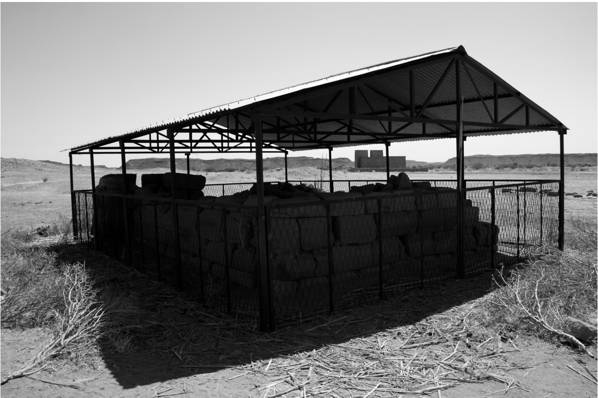
Fig. 5: Temple II A and its protective structure after the deterioration of its reed cover