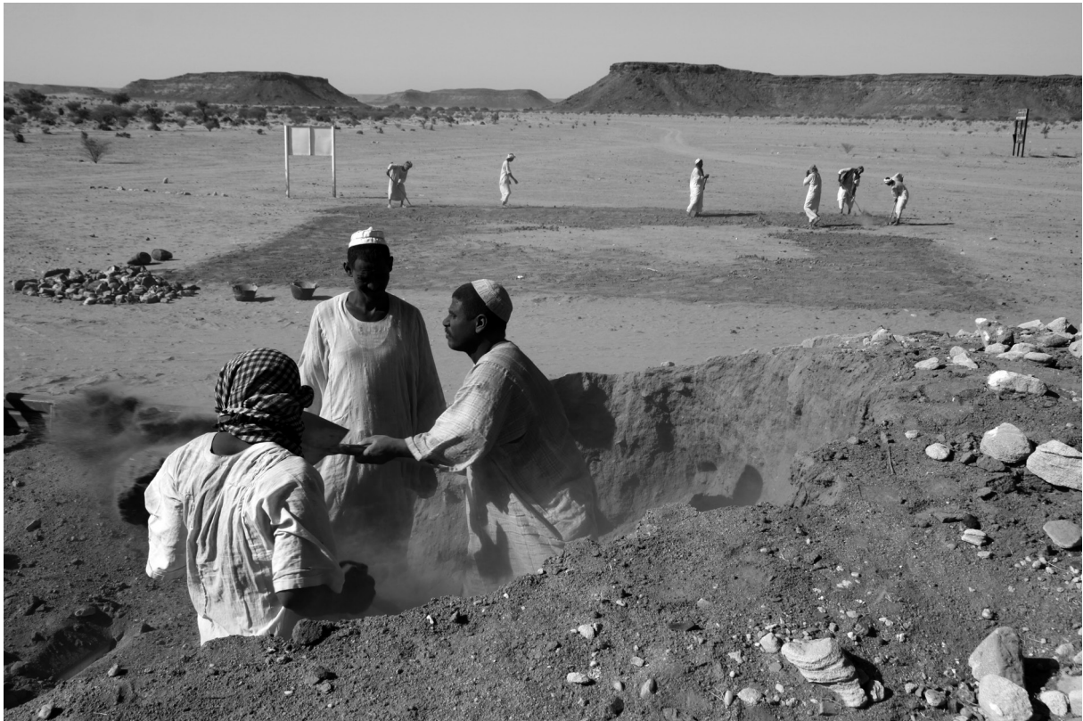
Fig. 16: Re-designing the area of the tourist police station, including the removal of an unused enclosure of the first police checkpoint; in the foreground work at the kom of debris south of the Small Enclosure