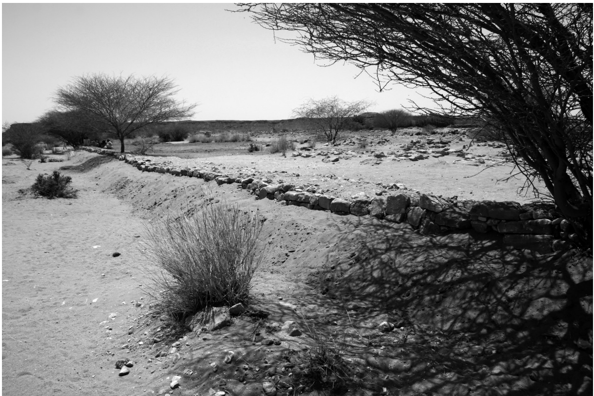
Fig. 10: The area east of the Great Enclosure with the rubble and earth platform and the newly constructed wall, covered by sand and equipped with a bank of sand on the wadi side