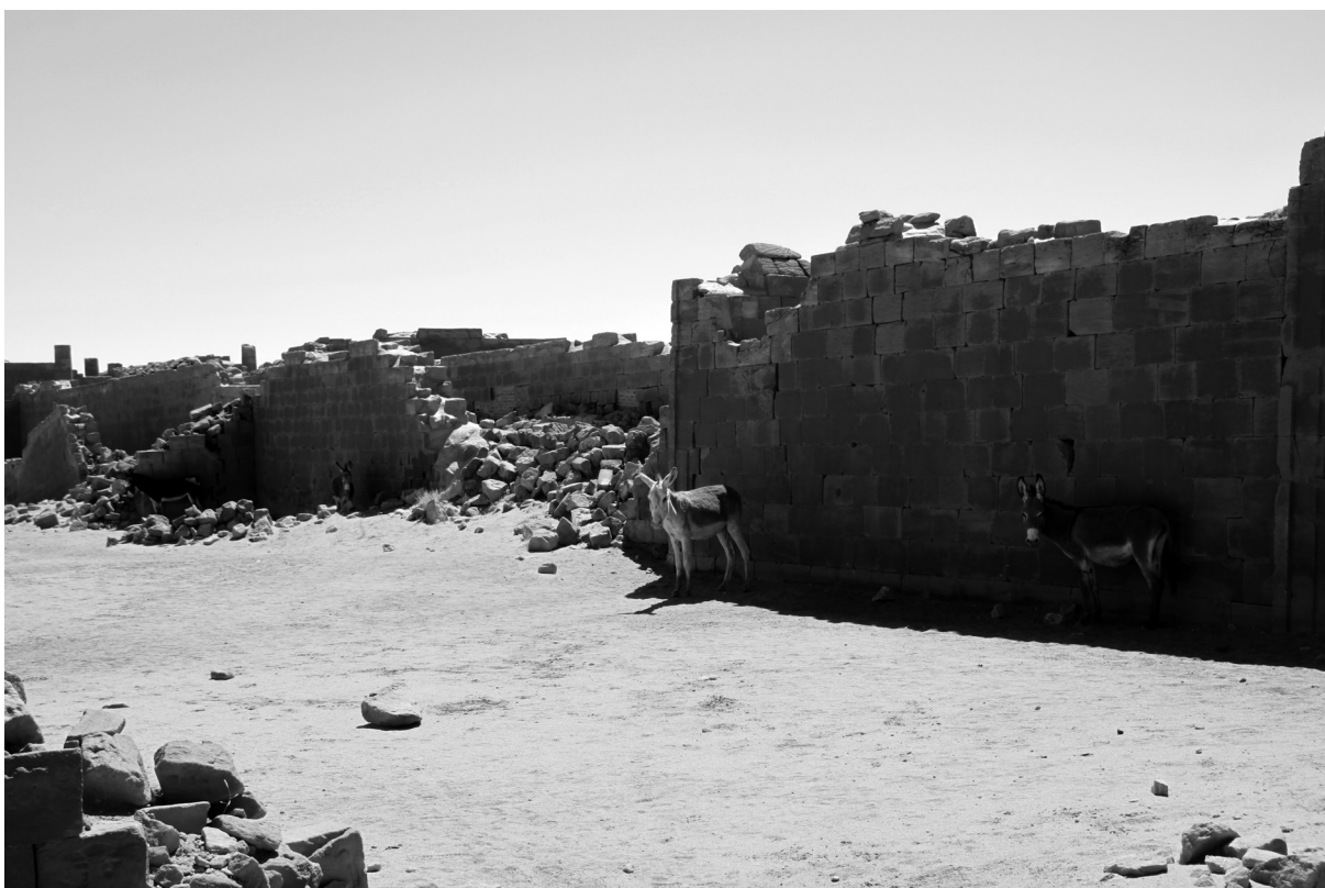
Fig. 1: Donkeys searching for shadow in the Great Enclosure

Great Enclosure. Fourthly, tasks necessary for the speedy implementation of the initial visitor guidance system were identified and preparatory work was undertaken along the proposed core visitor route. Consequently, consolidation-restoration measures were proposed, which primarily focus on those parts of the Great Enclosure that are planned to be presented to the public. Additional, urgent measures were undertaken when necessary.