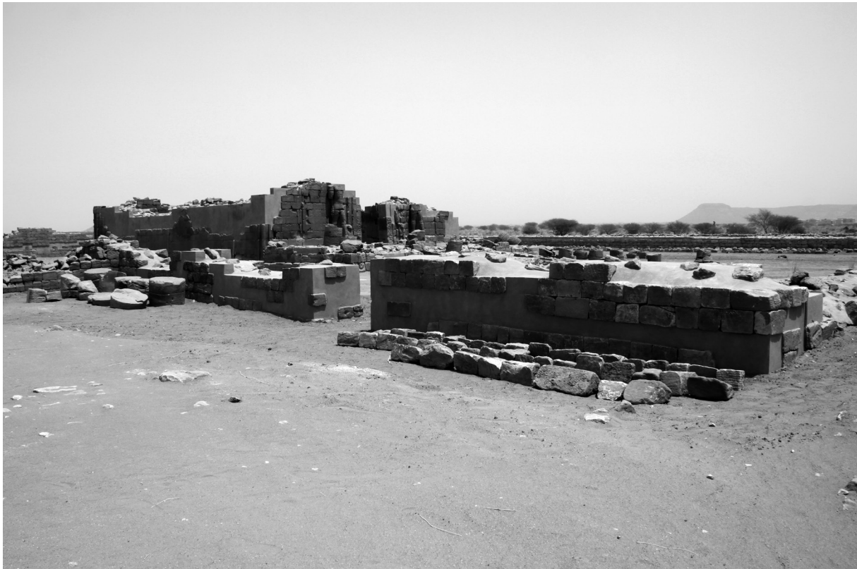
Fig. 12: Wall 117/304 with the gate towards courtyard 304 after reconstruction

a restored ruin. The top was eventually sealed with coloured lime mortar. This approach marks the wall as a consolidated original wall, partly reconstructed, but not pretending to extend to its original height (fig. 12).