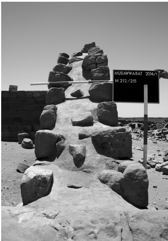
Fig. 15: Wall 212/215 with the protective cover of lime mortar in place

is concerned with protecting the walls of the Great Enclosure from further deterioration by water seepage. Almost all of the walls of the Great Enclosure have lost their original capping, the so-called donkey-backs i.e. sandstone blocks with a triangular section that aids water run-off to the sides of the walls. Most walls with their two-shell masonry and core of sandstone rubble embedded in earth mortar are now open for intruding rain water which erodes the earth mortar of the filling and destabilises the walls. An effective measure against this deterioration is to seal the wall tops with a layer of lime mortar that is then painted to match the colour of the sandstone blocks. The lime mortar wall covers are applied without physical intervention into the existing portions of the walls, apart from some cleaning of the wall tops from loose rubble before the application of the mortar. The new wall covers are clearly differentiated from ancient material and their application is reversible. In the 2013/14 season work in this project concentrated on Complex 200 i.e. the buildings and courtyard walls surrounding Temple 200. Altogether, more than 100m of walls received a lime mortar cover (figs. 14–15). 27