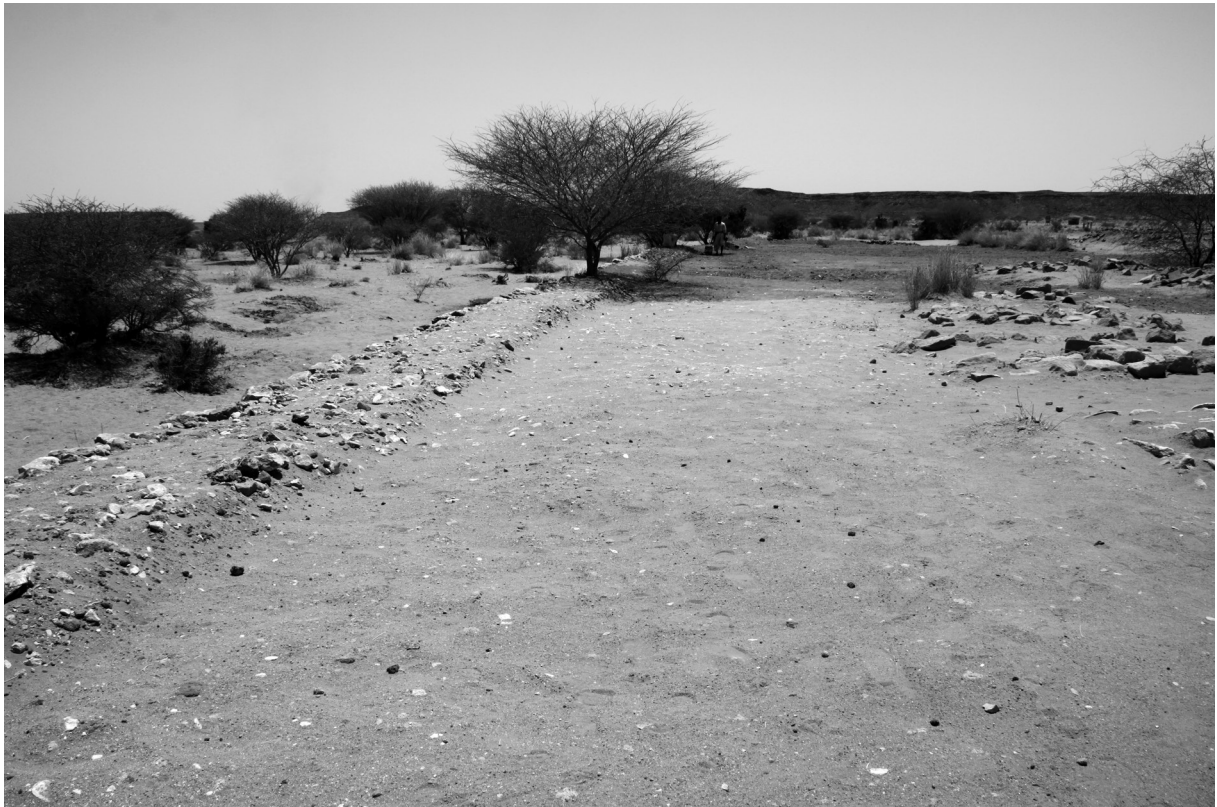
Fig. 9: The area east of the Great Enclosure, seen from the north, after its re-design with a low rubble and earth platform bordered by a low wall towards the wadi