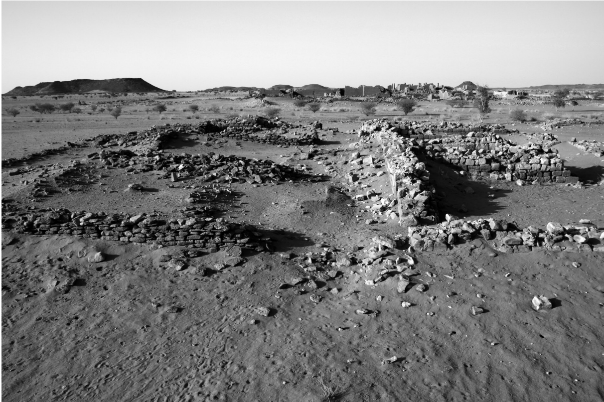
Fig. 3: The Small Enclosure (I B) south of the Great Enclosure