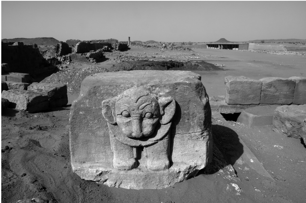
Fig. 13: The northern column base in room 108 after the removal of its temporary protective cover

of the column base, was rescued and consolidated in several pieces. To be able to re-exhibit the conserved shell of the column base, it was decided to construct a core from a concrete mixture, and re-position the relief-decorated shell around it, separated from the core by a layer of mortar. The new, strong column core will also allow the re-positioning of further column drums on the restored base. The completion of the conservation of this piece and the return to its original position is planned for the coming autumn season (2014/15). The brick encasings of all the other columns which had been opened were renewed for the further protection of these columns until they can receive conservation treatment.