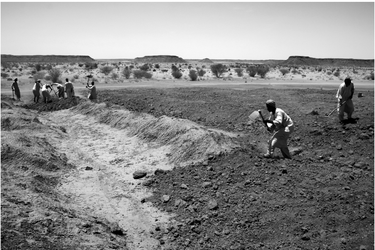
Fig. 19: Flattening heaps of modern debris from the excavations in the Great Hafir by the Sudan Civilization Institute in the mid-2000s