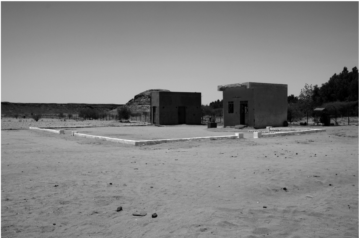
Fig. 17: The new enclosure at the police station