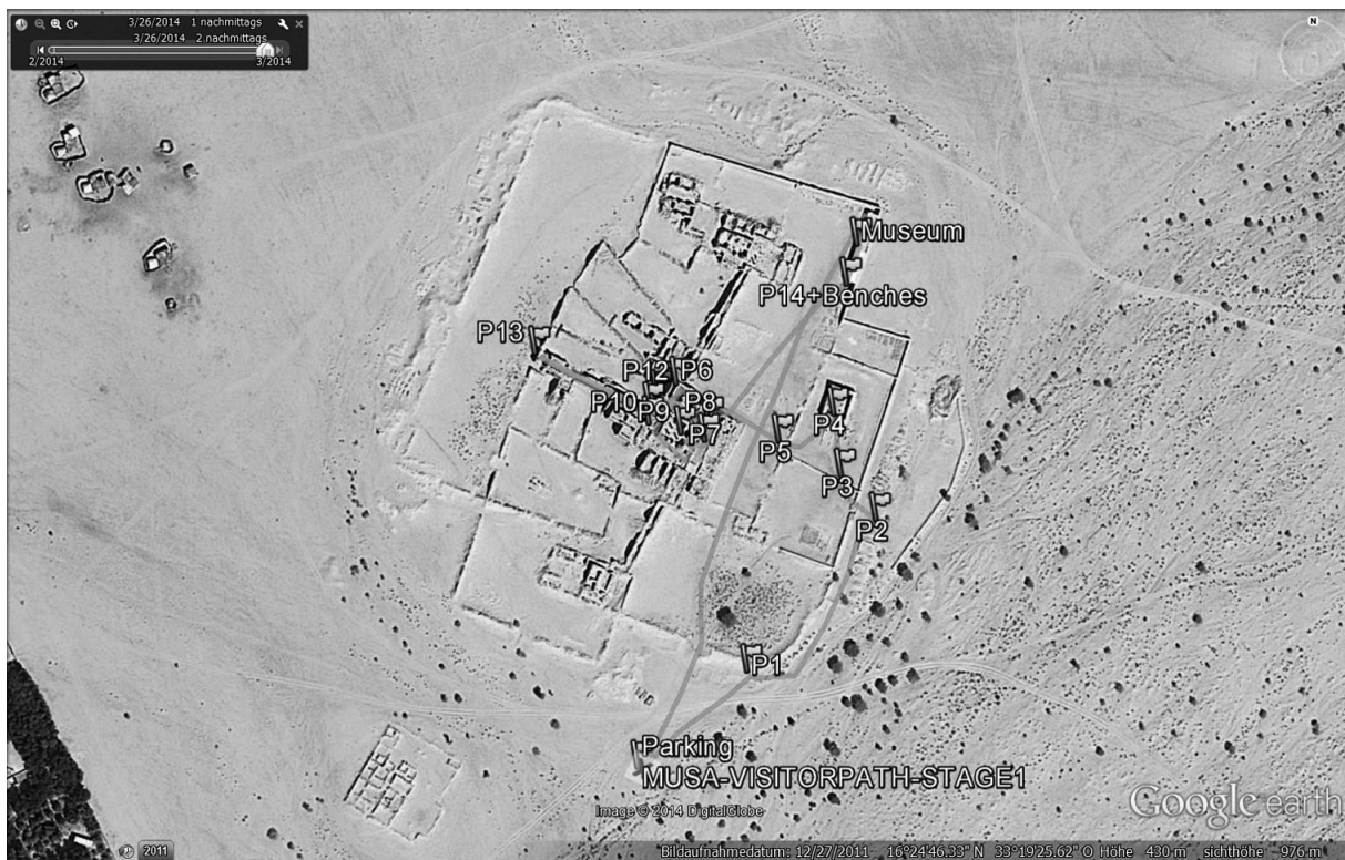
Fig. 7: The proposed visitation route, stage 1 (graphics: Google Earth and Cornelia Kleinitz)

For the Great Enclosure, a logical visitation route was developed with a number of view and information ‘hot spots’, which are to be equipped with information panels in the coming seasons. The route focuses on the eastern and central parts of the building complex (Complexes 300, 100 and 500), with its northern and southern parts (Complexes 200 and 400) deliberately omitted from this route as they need to undergo further study and consolidation before being opened for visitation. Overall, the visitation route – which can be extended at a future point – is suggested to follow the ancient routing through the site starting at the likely main entrance to the Great Enclosure (from the east into courtyard 305), passing Temple 300, accessing the Central Terrace via ramp 119, circling the Central Temple and finally arriving at the site museum (fig. 7). While visitors can become aware of the labyrinthine character of the site on this route, the route means they will cross (and damage) as few of the ancient walls as possible.