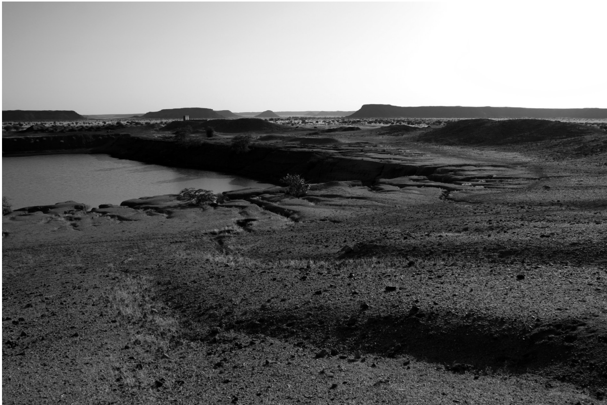
Fig. 6: The Great Hafir's interior with erosion channels

tion available to the visitors before and during site visitation (e.g. internet sources, guide books, guides). One aim was to establish what sets of knowledge and expectations visitors arrive with and what information they find or would wish to find at the site itself. While the exercise of tracking visitor movement across the site showed what apparent paths and 'hot spots' are attractive visual 'draws' for various kinds of visitors, the interview data added information on which 'stories' concerning the site visitors found most interesting and memorable. In addition to visitors, guides (including professional guides, archaeologists leading tours, interested 'enthusiasts') as well as owners and employees of tourist companies were interviewed on site and in Khartoum on their evaluation of, and approach to, Musawwarat as a tourist destination, and on their needs as 'handlers' of visitors to this remote site. Interviews were also undertaken with the guards of the Great Enclosure as well as the Lion Temple, who provided information on their daily experiences with visitors at Musawwarat, and on their wishes and needs for the future development of the site. The various elements of the visitor study will feed directly into site management planning at Musawwarat.