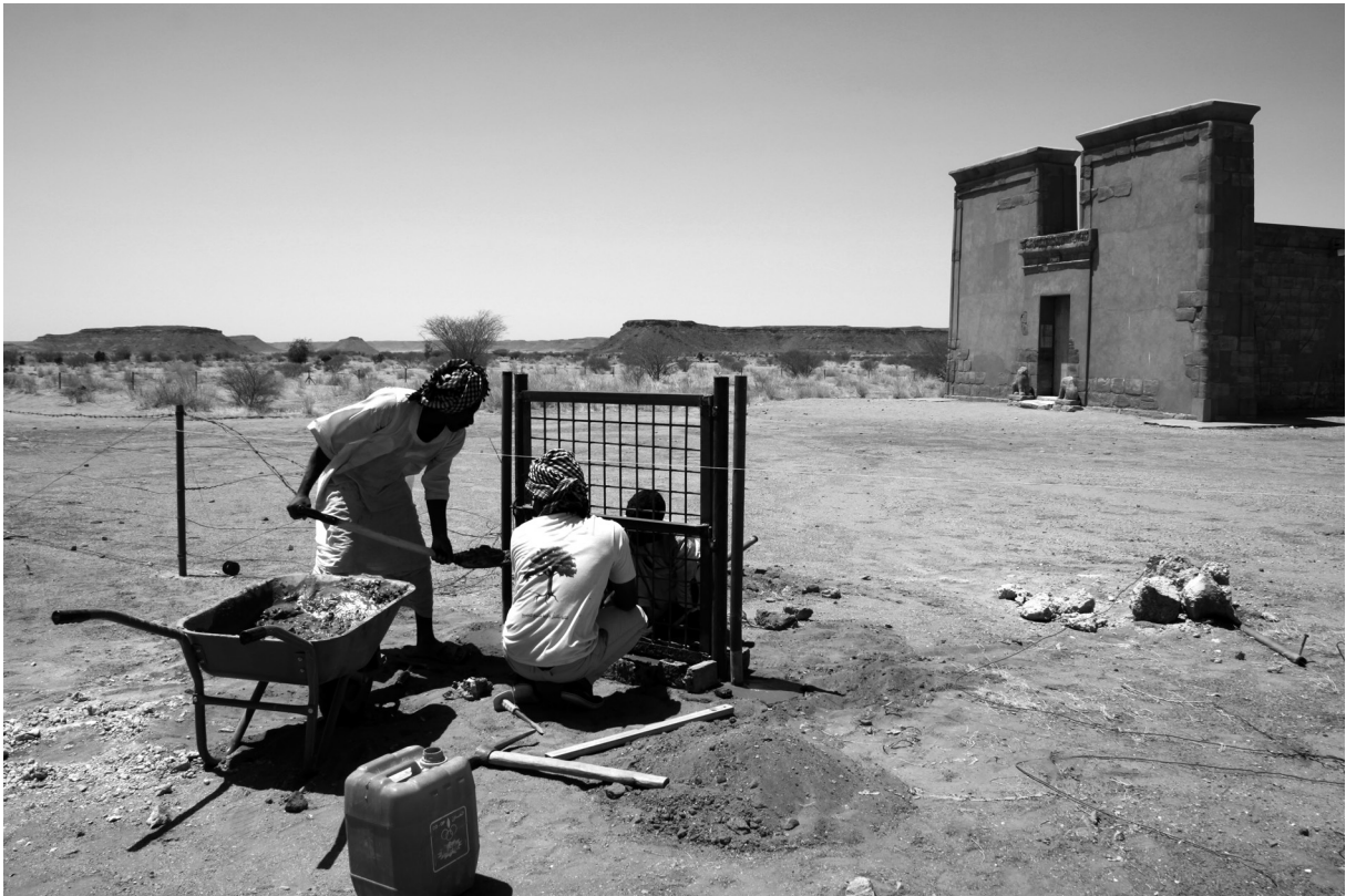
Fig. 18: Installing the new gate in the fence of the Lion Temple