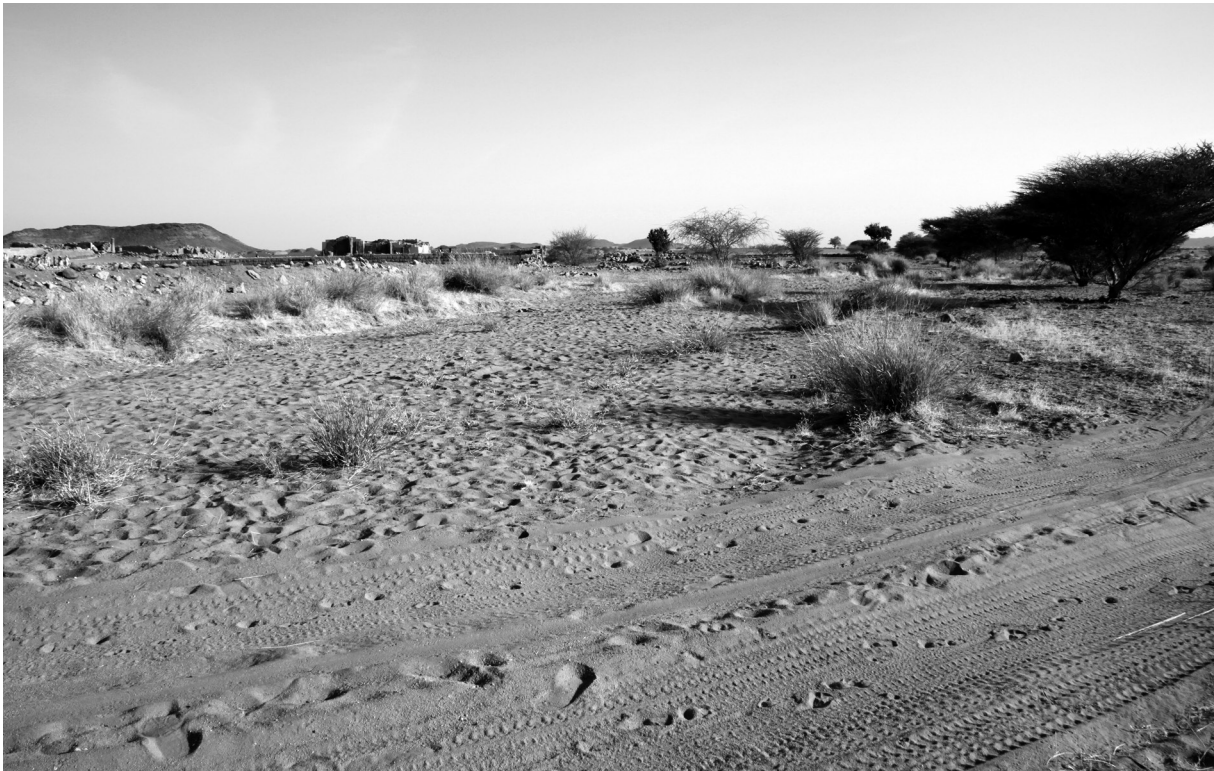
Fig. 8: The wadi east of the Great Enclosure, seen from the south, namely the 'old' track to the Lion Temple, prior to its re-design