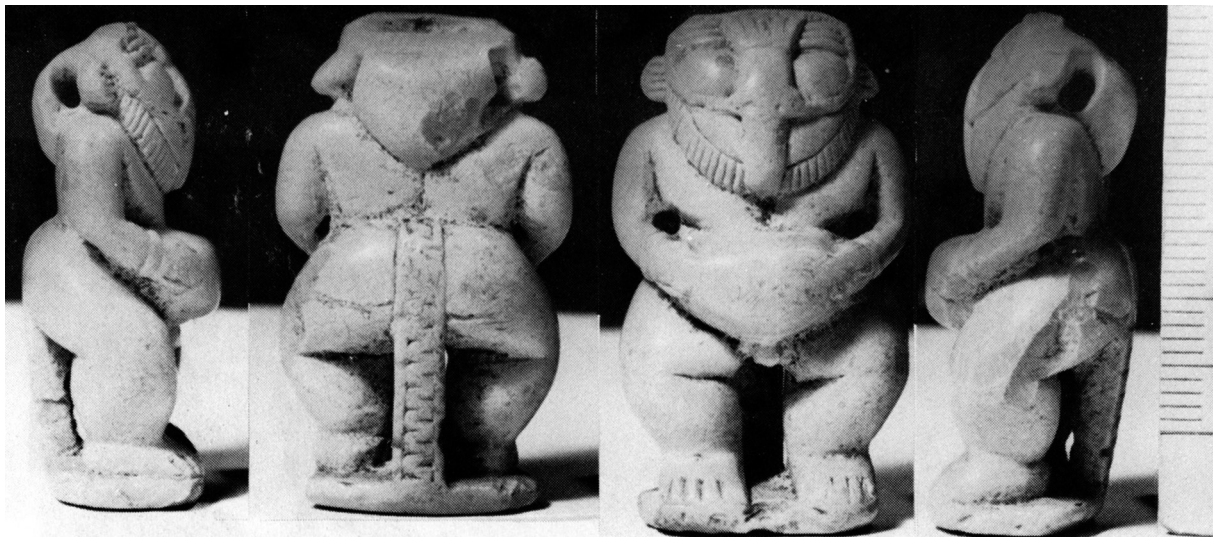
Fig. 4: The Bes of a private Swiss collection, after Chappaz 1981, 93.

synthesis, following the principle of adaptation of models, in order to express canons (funerary or not) respecting Egyptian traditions, and, at the same time, indigenous forms. Therefore, artistic experimentation took place creating a local trend, probably coming from a melting pot between popular background and poorly known traditions. As a solar and prophylactic image, Bes had a very good reception in both official and popular beliefs until the Meroitic period. We hope that new discoveries from the field can enlarge the collection of these Bes with pentagonal face adding new local variants of the same divinity.