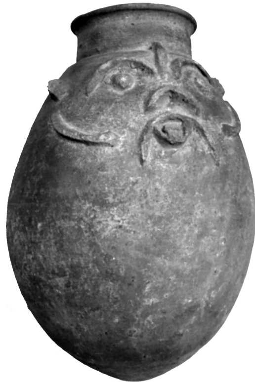
Fig. 1: The Bes-jar from tomb 772 of Sanam necropolis, unpublished photograph, © Royal Pavilion & Museums, Brighton and Hove.

However, during the Napatan dynasties, Bes image is frequently present among the components of jewelry and as amulets left inside the burials due to his apothropaic role, especially in non-royal tombs. 7 In general, Bes-amulets followed the standard models of the Third Intermediate Period and the Late Period: lion-rounded face, flat nose, wide mouth with thick lips, sometimes a feathered headdress on the head, and a necked dwarf body with arched and short legs. In Nubia, among the amulets