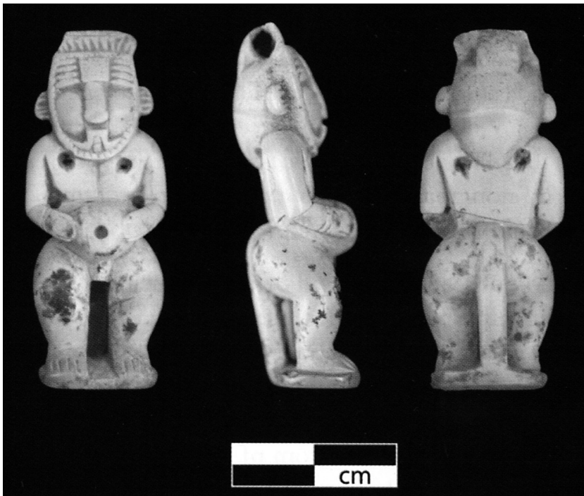
Fig. 3: The Bes recently found at Amara West, after Binder 2011, pl. 12, 46.

in the Egyptian Bes of the same period, i. e. a lower attachment of a feathered headdress which, in these Nubian models, has never been made.