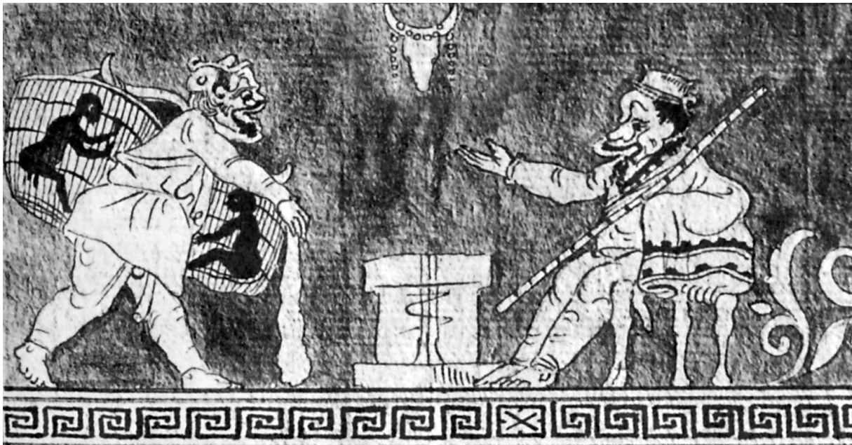
Fig. 2: Krater from Catania (F. Brommer, Herakles II. Die unkanonischen Taten des Helden (Darmstadt, 1984), S. 30, Abb. 12)

conveys the very quintessence of the episode under discussion. Can we consider the corresponding iconographic feature as the marker of scenes with the Kerkopes specifically, allowing to distinguish them from the whole lot of other representations connected with the theme of “Herakles’ robbery”?