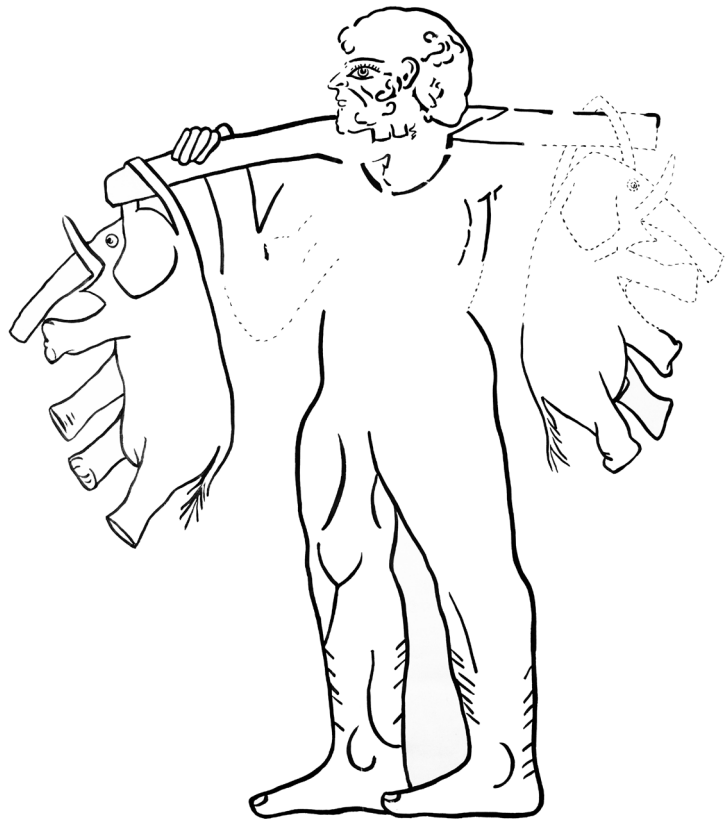
Fig. 1: Line drawing of the fresco of the Elephant-Bearer

It is worth recalling that the latter scene refers to the theme in Greek mythology conventionally described as the "Robbery of Herakles" or, to be more comprehensive, as "Herakles' pursuit of the robbers, who tried to steal his weapons