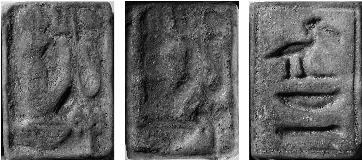
Fig. 1: Plaque from Sanam (Leiden, Rijksmuseum van Oudheden, Inv.-Nr. F 1940/11.49. Drawing: F. Joachim)