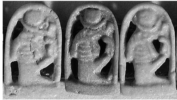
Fig. 2: Amulets from Sanam (Ägyptisches Museum und Papyrussammlung, ÄM 7815.)

13 openwork amulets were found in grave 0722 (fig. 2). 16 The tiny amulets are of blue and yellow glaze. Khonsu is squatting in a semicircular frame. He is again mummiform and falcon-headed. On his head there is a disc and a crescent of the moon. On his knees there is the feather of Maat and on its top a