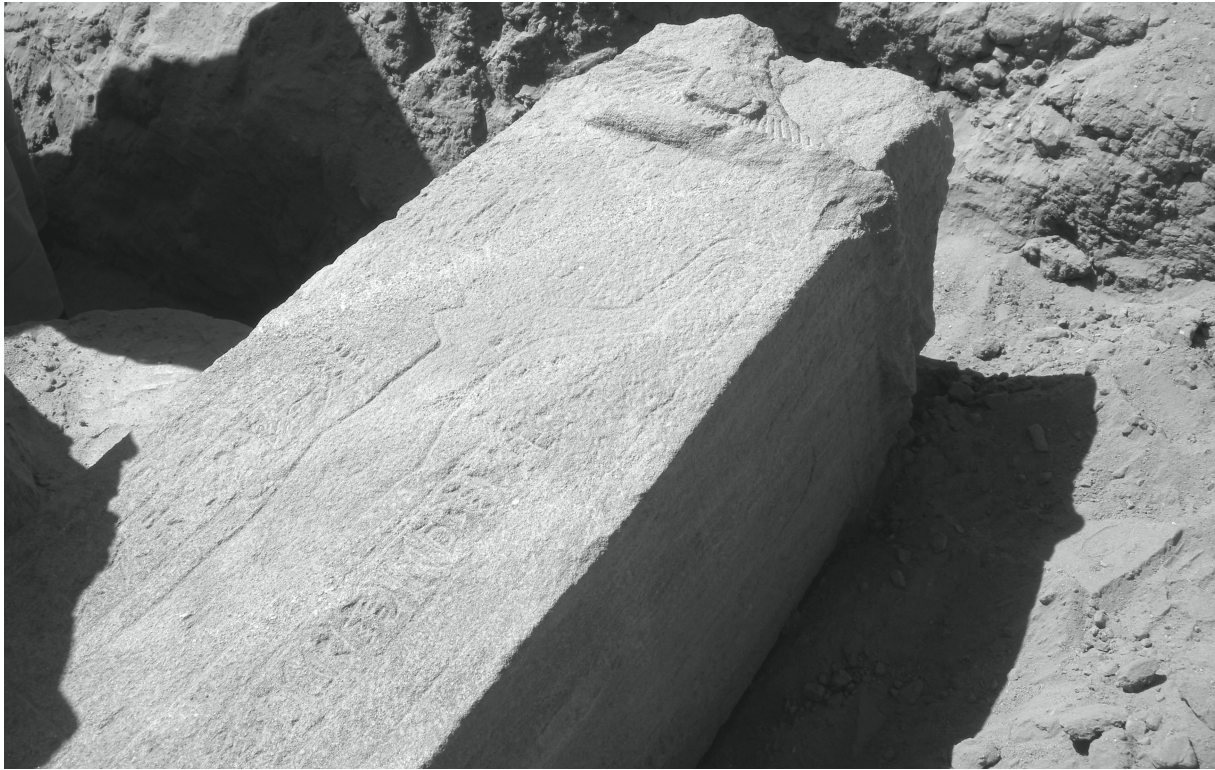
Fig. 4: Abu Erteila, Temple K 1000, Naos, Stand.