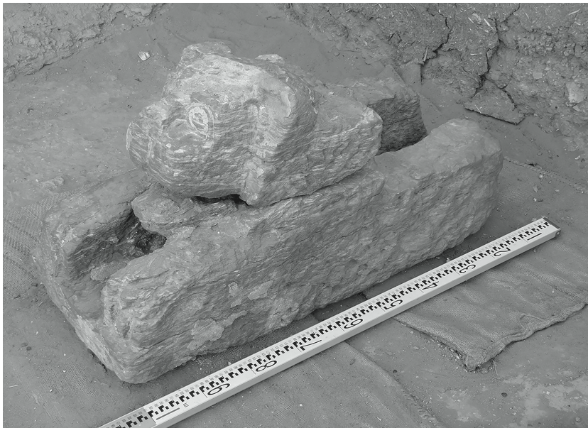
Fig. 5: Abu Erteila, Temple K 1000, Naos, Water spout.

tion is suggested by the finding of votive objects, as a bronze ring bearing a gryphon, 13 two sandstone lion statuettes 14 and faience beads.