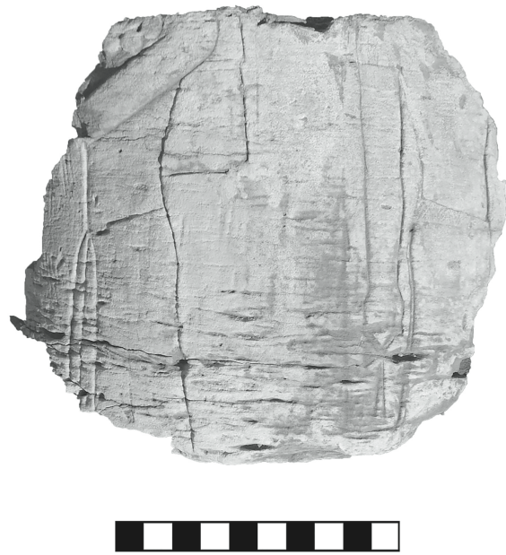
Fig. 6: Abu Erteila, Temple K 1000, Fragment of decorated column.