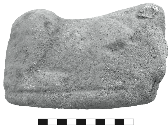
Fig. 7: Abu Erteila, Temple K 1000, Naos, Sandstone lion statuette.

The altar, found at a level of 391,22 meters, was cracked to a height of 97 cm; its square form is 52 x 52 cm width, and is crossed on each side by series of vertical incised lines and decorations in wavy form recalling a snake body. On the eastern surface of the altar the following dedication in Egyptian hieroglyph was engraved: