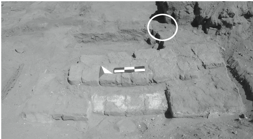
Fig. 10: Abu Erteila, Temple K 1000, Two-steps structure to south of K 1027. Behind it, on the right, is visible on the planking level the square door housing put in correspondence of the entrance to K 1027.