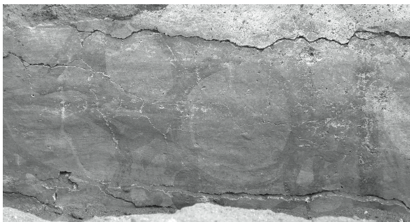
Fig. 9: Abu Erteila, Temple K 1000, Outer facing of the southern perimeter wall, Detail of the painting on plaster depicting a solar disk flanked by an ibis and a sphinx.