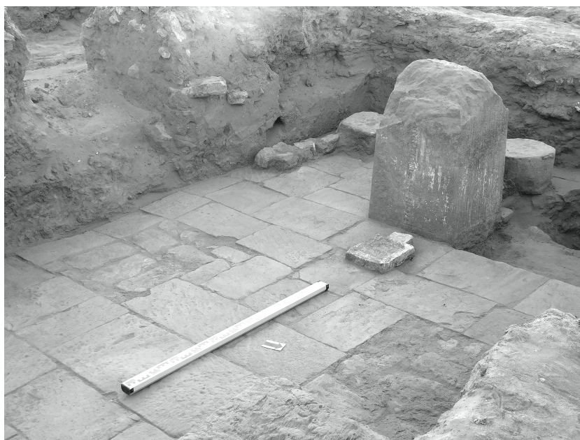
Fig. 3: Abu Erteila, Temple K 1000, Naos, Altar and offering table.

The dating of K 1100 is unclear, nevertheless its attribution to the first building phase of the complex appears likely: the unusual extension and longitudinal N-S plan of K 1021, linking the original core and the southern annex of the temple, was in fact probably determined by the necessity to include in the structure K 1100. The stone floor may suggest as well the sacral nature of this structure, as noticed in the naos and pronaos of the temple. Moreover a possible destination of K 1100 to the popular devo-