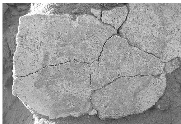
Fig. 11: Abu Erteila, Temple K 1000, Inner facing of the southern perimeter wall, Detail of the painting on plaster depicting a human head (photo Fantusati).

Painted plaster also covered a red bricks two-steps structure set to south of the room K 1027, brought to light during the seventh season; 21 a middle body is flanked by two slightly projected same-sized wings (fig. 10). It was decorated with the representation of two groups including human and divine personages collocated on both its lateral sides; of such figures only the legs and part of the feet are now visible. Furthermore the reproduction of bows can be noticed on the steps: they symbolized enemies of the kingdom that were crushed underfoot confirming the royal supremacy and the full control on all the dominions of the reign.