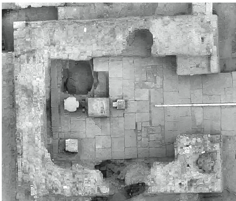
Fig. 2: Abu Erteila, Temple K 1000, Naos, View from above.