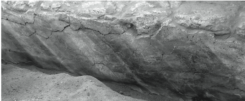
Fig. 8: Abu Erteila, Temple K 1000, Outer facing of the southern perimeter wall, Detail of the painting on plaster depicting sunbeams.

In addition to the several column drums and the open papyrus capital found in 2014, a new fragment sized 40x28 cm came to the light in the temple. Its decoration shows the king and a god represented shoulder to shoulder. The unknown divine personage is here reproduced holding in his right hand an ankh sign (fig. 6).