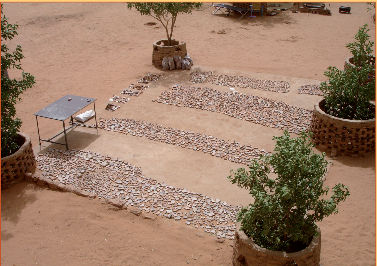
Colour fig. 7: The workplace of the pottery project in the dighouse