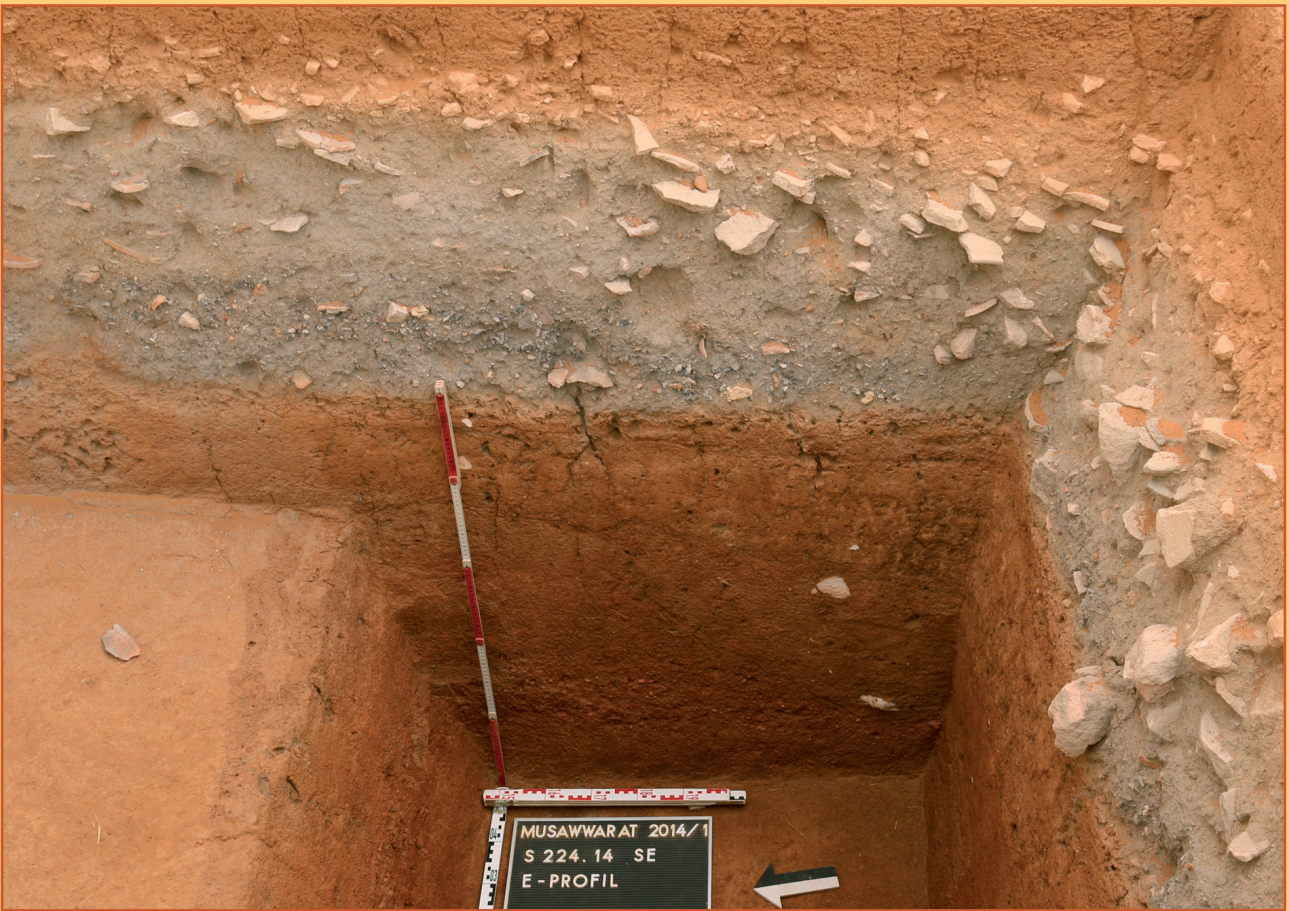
Colour fig. 6: The eastern section of the southeastern square of trench 224.14 with pit [224.14-015]