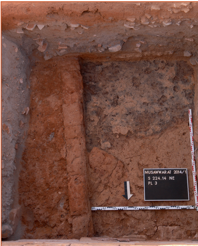
Colour fig. 3: Plane 3 of the northeastern square of trench 2014.14 with the mudbrick wall [224.14-004] and the lower layer with traces of circumscribed burning [224.14-009]