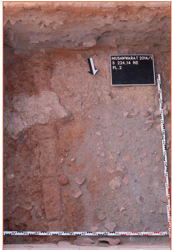
Colour fig. 4: The packing of unfired clay [context 224.14-003] drawing over the mudbrick wall [224.14-004]