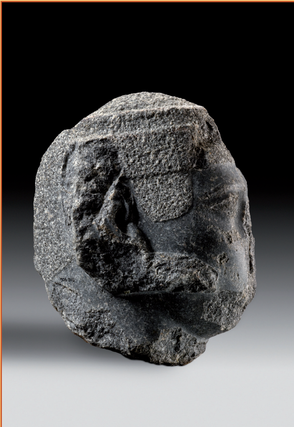
Colour fig. IVc: The head of the statue AN1936.325: right view showing the ram's horns.