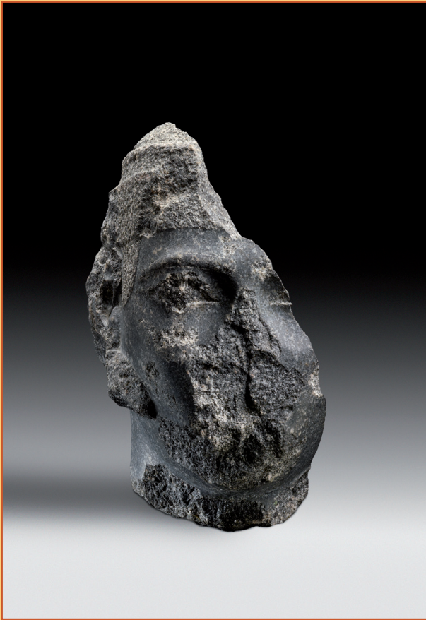
Colour fig. IVa: The head of the statue AN1936.325: Frontal view; (© Ashmolean Museum, University of Oxford).