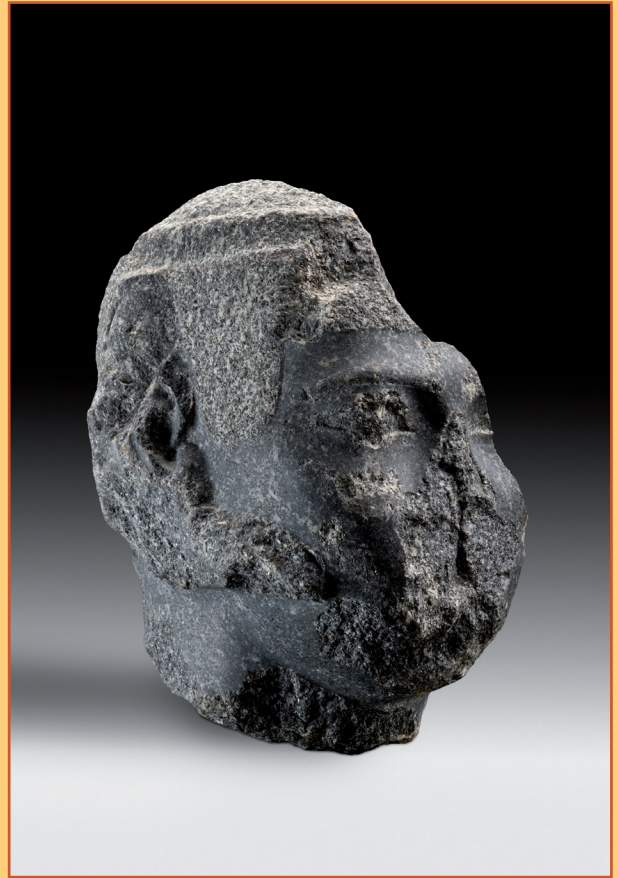
Colour fig. IVb: The head of the statue AN1936.325: Half-face view; (© Ashmolean Museum, University of Oxford).