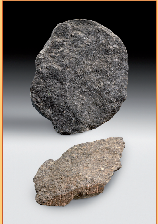
Colour fig. IVd: The head of the statue AN1936.325: With a fragment of the stela Kawa XLI, AN1932.1295 juxtaposed