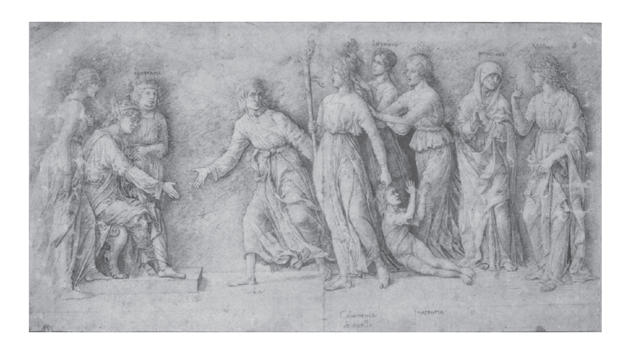
3 Andrea Mantegna, Calumny of Apelles. London, British Library, Inv. 1860,0616.86

rightly been questioned, the following discussion concentrates on the more recognizable reliefs and figures, whose iconography is more generally accepted.<sup>30</sup>