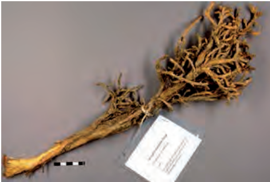
Fig. 3. Astragalus cuneifolius Bunge, in Farsi Dom-i-shutur