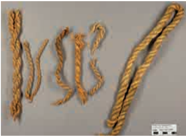
Fig. 1. Ropes used for analysis of the plant species: ropes from the Western Buddha (on the left) and from the bazaar in Bāmiyān (long one on the right)