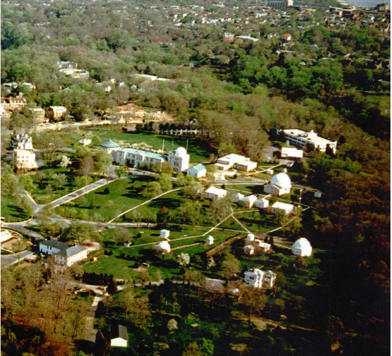
Figure 23.1: A “bird’s eye” view of the US Naval Observatory. In the middle at center is the administration building and the dome of the 12’ refractor. To its right is the dome of the 26’ refractor. The 1000 foot diameter grounds of the USNO were established in 1890 to protect sensitive instruments from the vibrations caused by carriage wheels along nearby roads.