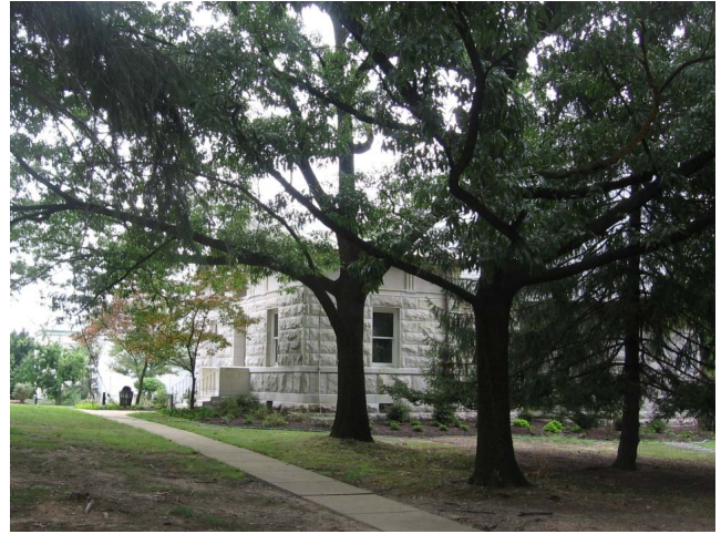
Figure 23.2: The Hunt designed building to house the 26" refractor in 1890 in the midst of construction and today. In the 1890 image at left rear are seen the initial work on the foundations of the main administrative building. Despite the rather significant change in local foliage, these are kept at a manageable height and about 200 nights per year are suitable for obtaining observations.

by a visiting astronomer: Sherburne Wesley Burnham. This prolific double star astronomer visited the USNO in August 1874: