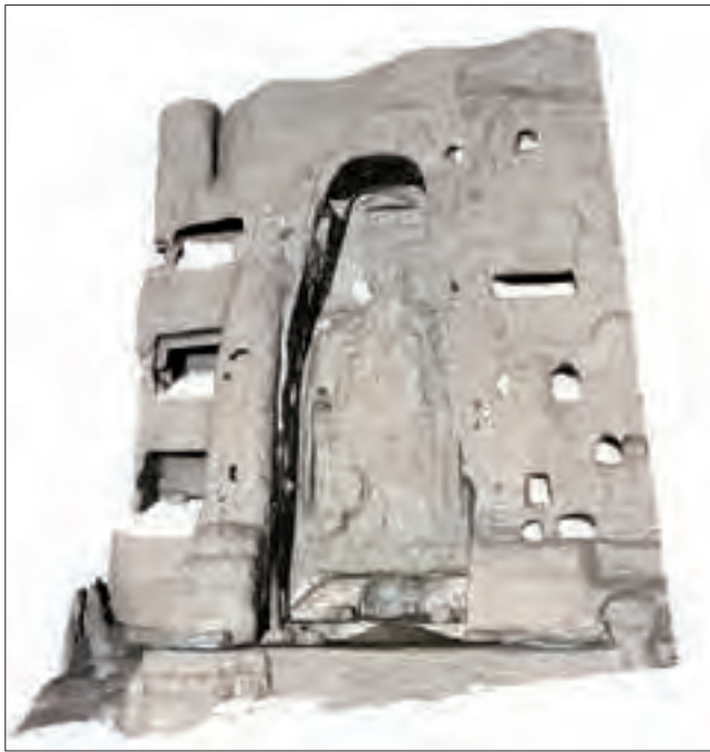
Textured 3D model of the niche of the Eastern Buddha

constantly measured by an optical tracking system based on six ARTtrack1 cameras. The viewpoint of the spectator is processed in real time and the stereo images are rendered accordingly by a PC Cluster of a total of ten Render Clients connected to the projectors. One Master Station controls the synchronisation of all calculations with a specially designed application programmed in VISTA a cross platform VR Toolkit under development at RWTH Aachen. The projected stereo images personalized to the eye distance of the user and the processing of the images according every movement of the spectator in real time create a complete immersive 3D for the user of the CAVE.