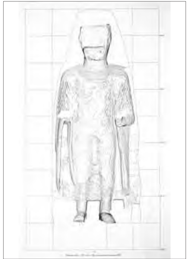
Model of the Eastern Buddha generated from isoline drawing of 1978