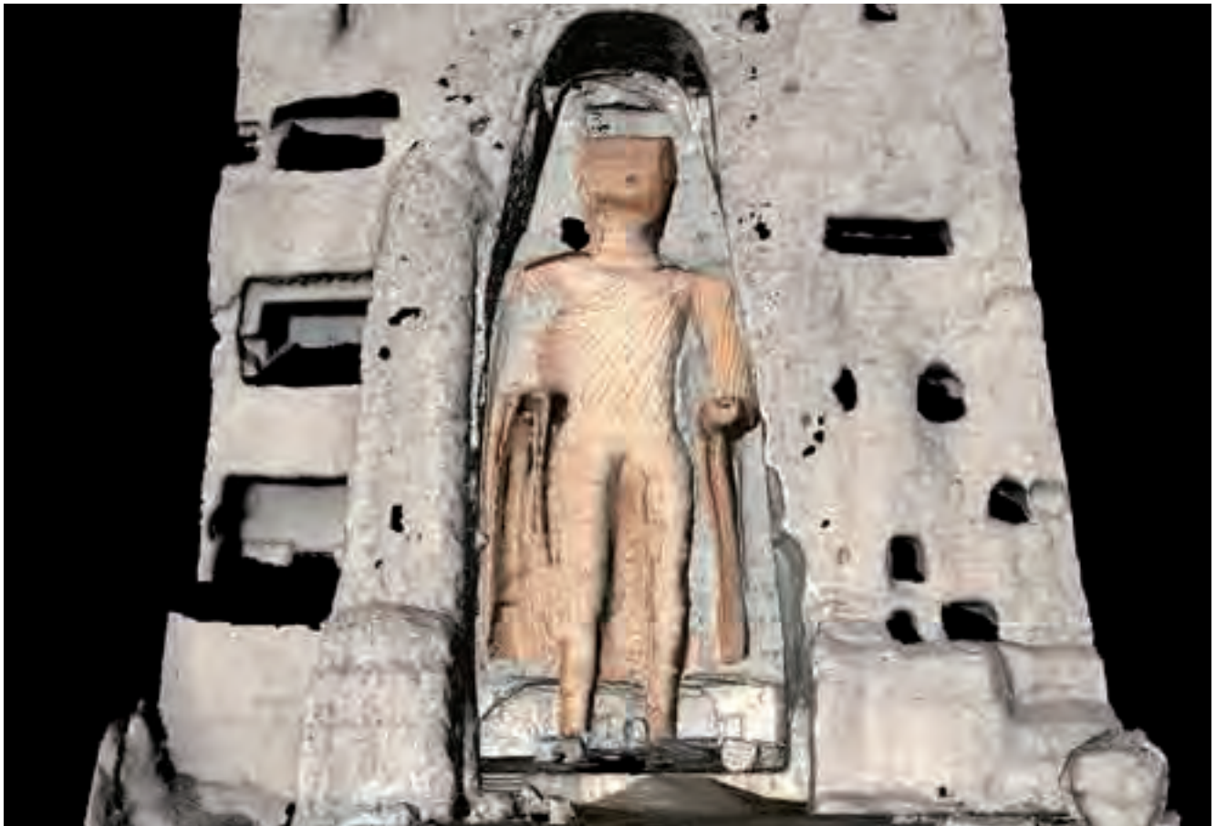
Virtual reconstruction of the Eastern Buddha with texture information