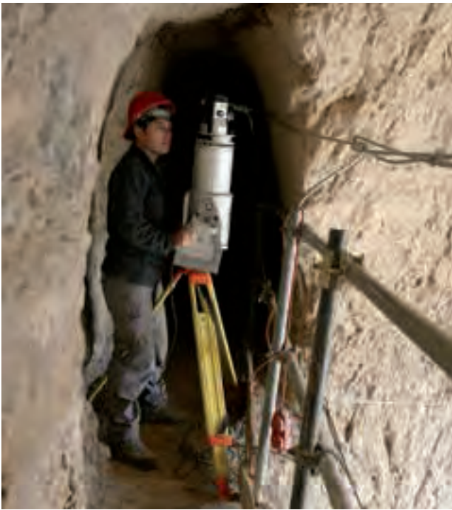
Riegl Laser Scan Z420i in various scan positions