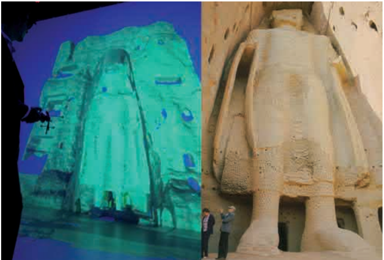
Left: view within the virtual environment. Right: view of Eastern Buddha in 1978