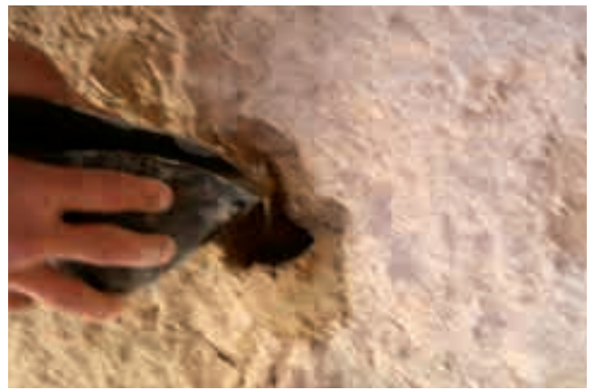
△ Fig. 7b. Filling Ledan into the borehole