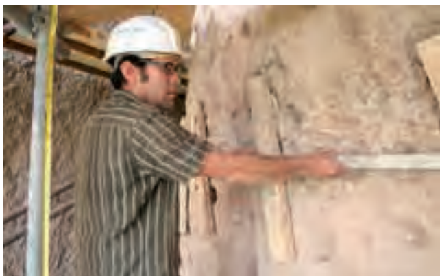
▽ Fig. 4a. Provisional stabilisation of right shoulder