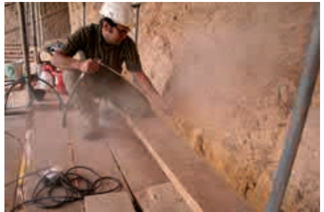
△ Fig. 6b. Removal of dust from the borehole