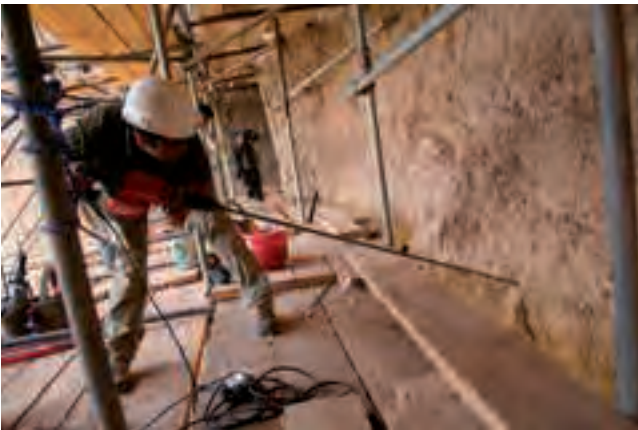
△ Fig. 6a. Drilling of anchor borehole