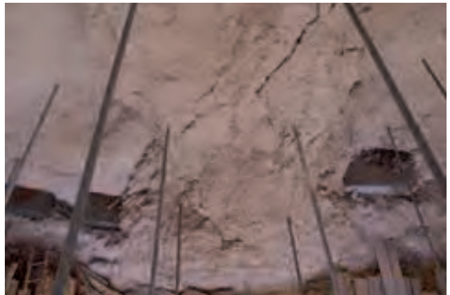
△ Fig. 2b. Head of the Eastern Buddha after removing the loose rock fragments