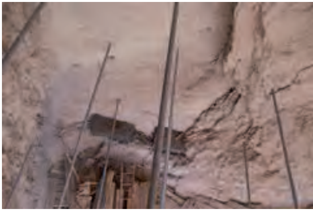
△ Fig. 1a. Right shoulder after removal of the loose rock fragments