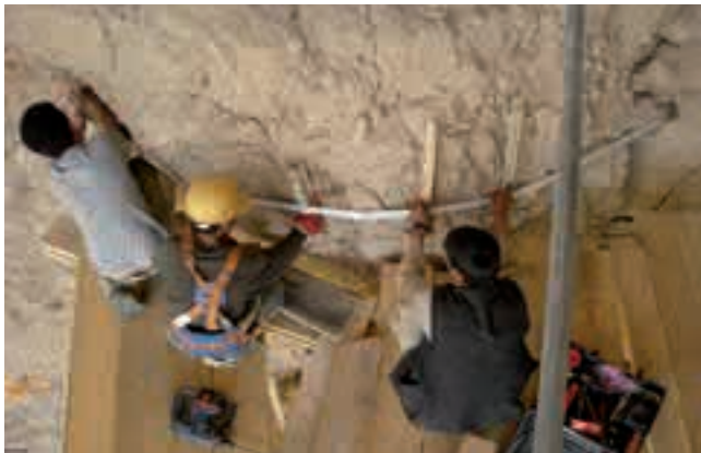
△ Fig. 3a. Provisional stabilisation of left shoulder (upper part) with tension belts