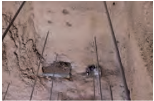
△ Fig. 1b. Left shoulder after removal of the loose rock fragments