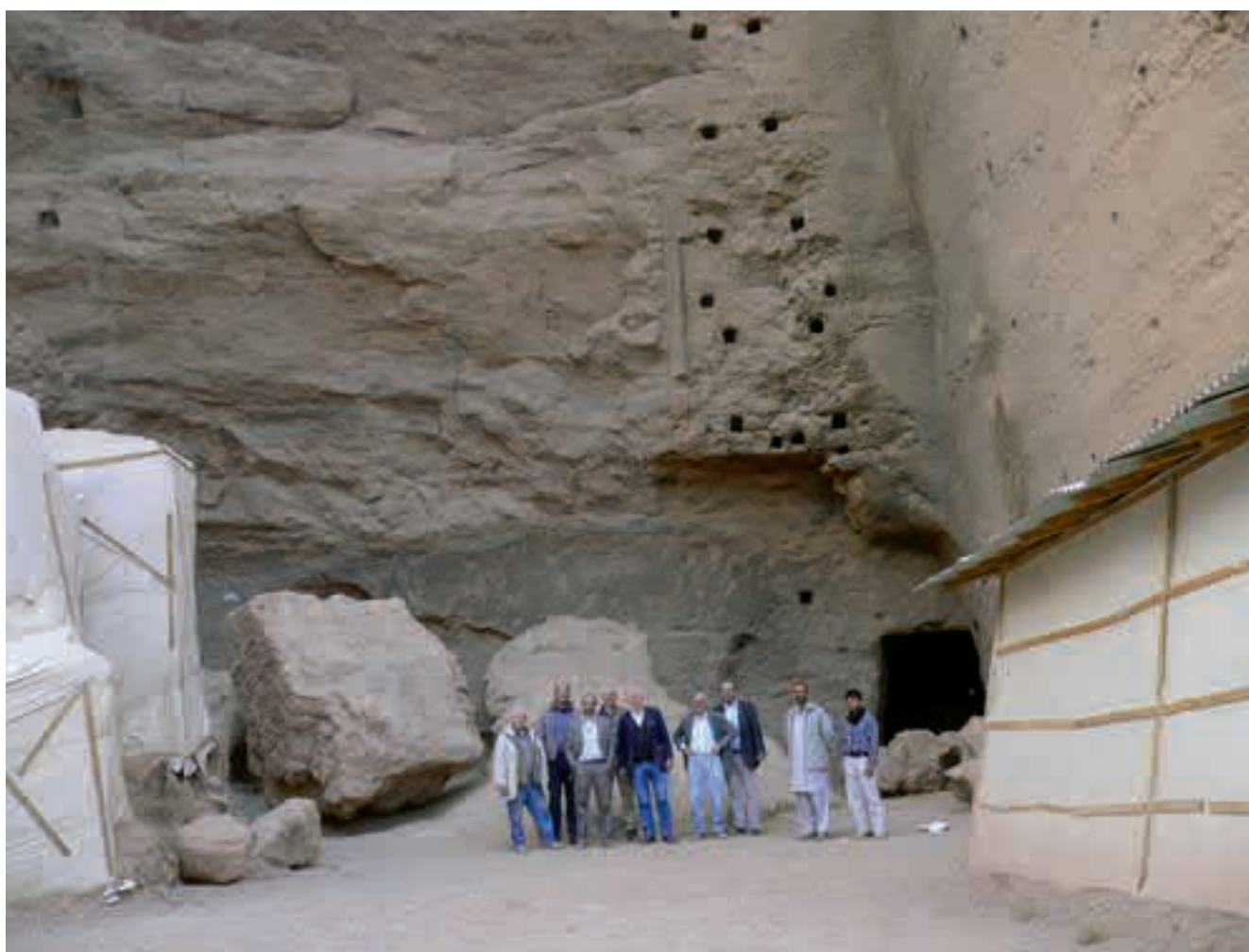
The ICOMOS team in the Western Buddha niche, October 17, 2009