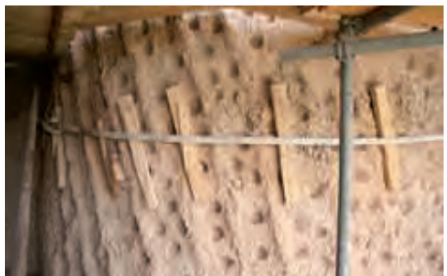
▽ Fig. 4b. Provisional stabilisation of right shoulder