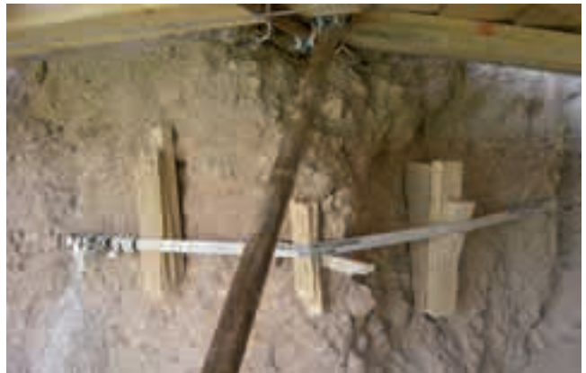
△ Fig. 3b. Provisional stabilisation of left shoulder (lower part) with tension belts