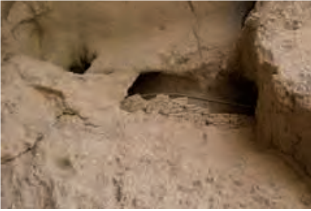
△ Fig. 5a. Loose wedge under the Eastern gallery