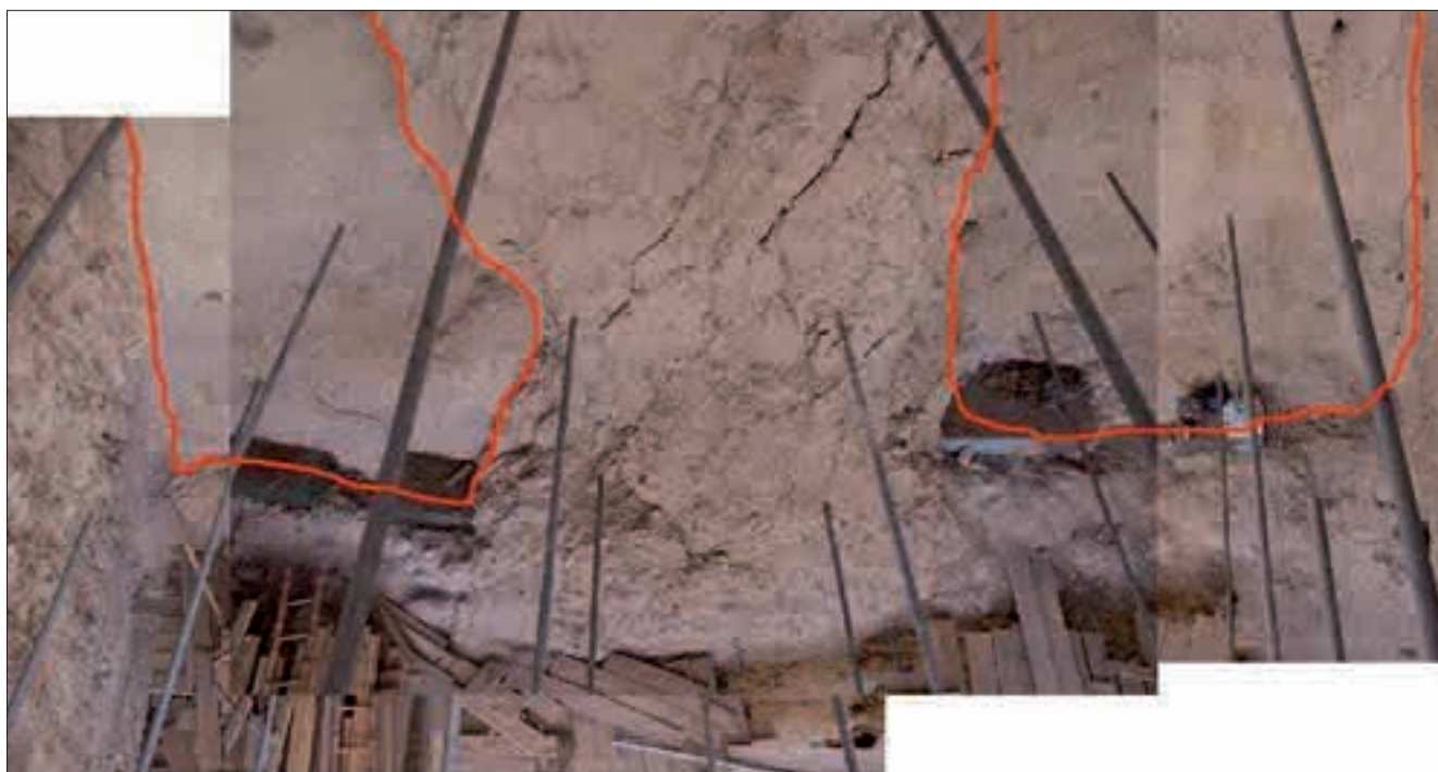
Fig. 9. Trace of an open joint parallel to the back wall (red line)