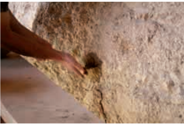
△ Fig. 7a. Preparations for refilling the borehole