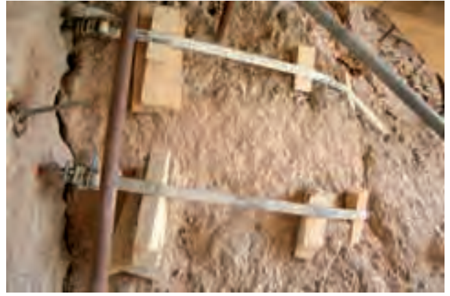
△ Fig. 5b. Provisional stabilisation of the loose wedge