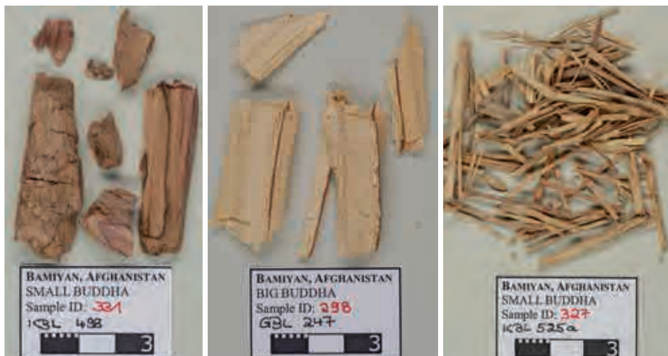
Fig. 1. Three of the samples selected for 14 C-AMS dating