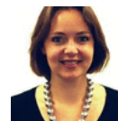
by Julia Yates

TIG is working on a suite of projects examining how the Common Points of Reference developed in NICE 1 might most effectively be applied in practice.