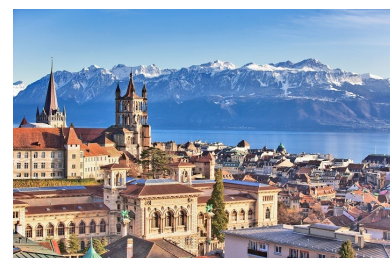
REPORT ON ECADOC SUMMER SCHOOL LAUSANNE IN 2016