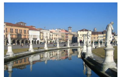
INTERNATIONAL CONFERENCE IN PADOVA FROM OCT. 5-7, 2017