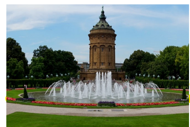
ECADOC 2017 IN MANNHEIM FROM SEPT. 4-9, 2017