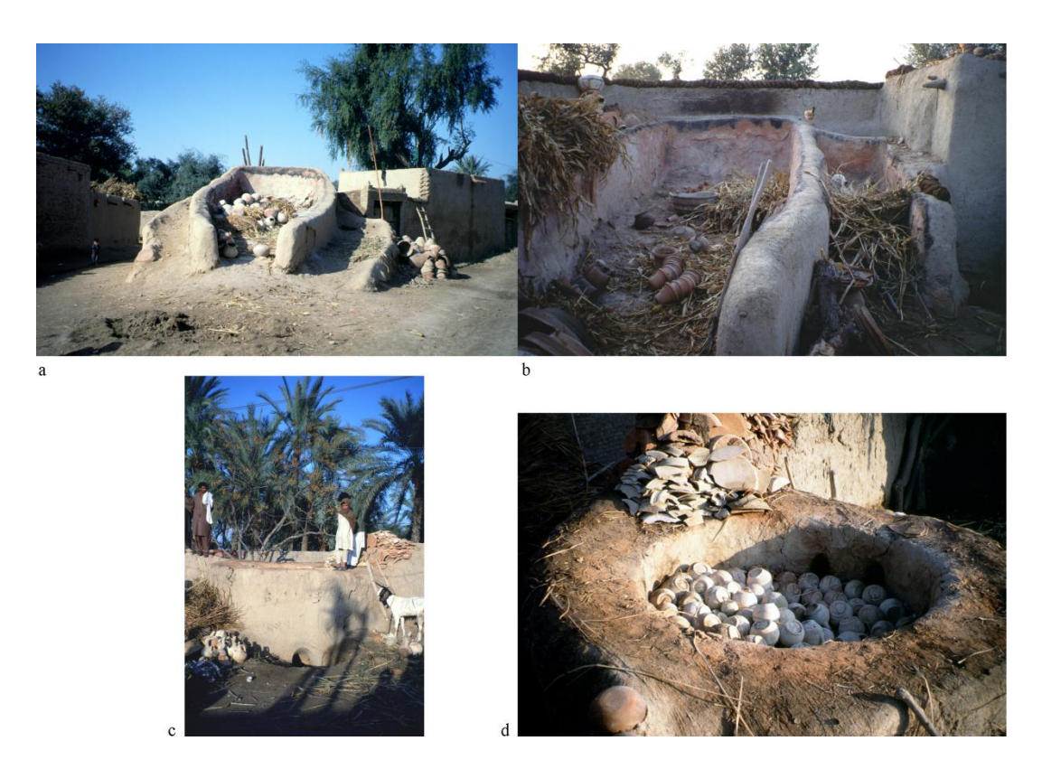
Figure 5. Range of pottery kilns (see also the simple kiln for firing thaihi, in Figure 3b): (a) a communal horse-shoe shaped sloping kiln (9.5 m long by 2.8 m wide, height ranging from 0.6 to 1.5 m) located in an open space in the village of Gandi Khan Khel; (b) double kiln in the courtyard of Gul Nawaz (village Nurar), the larger one (7.8 \times 3.0 m; from 0.4-0.8 m high) is for firing a range of pots, while the smaller one (3.8 \times 2.0 m; from 0 – 0.45 m high) is for firing thaihi; (c) circular updraft kiln (outer diameter 3.5 m, inner diameter 2.1 m, outside height 1.2 m) in the courtyard of Said Ghani (village Shahaz Azmat Khel); (d) Said Ghani's updraft kiln loaded with water pots.