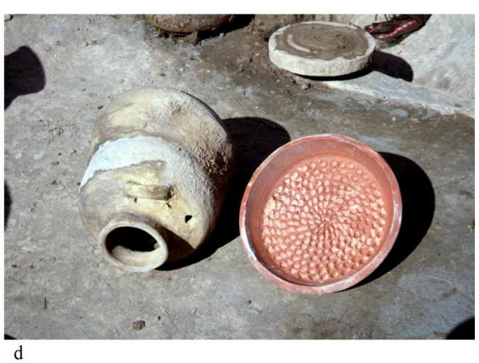
Figure 3. (a) Flat baking trays (thaibi) made in Umar Khan's workshop (village Mandeo) for cooking bread (naan and chapattis); (b) simple kiln (2.4 \times 2.4 \text{ m}) built against the wall of the house of Mir Paiyodad (village Bharat) for firing thaibi; (c) thaiba on top of an elaborate cooking hearth (bāt), with cooked cornmeal naan, in Umar Khan's courtyard (village Mandeo); (d) wares produced by Musam Khan (village Gandi Khan Khel) and used by Afghans in the nearby refugee camp for processing yogurt (as described in the text): left: kurtmal, right: jagai.