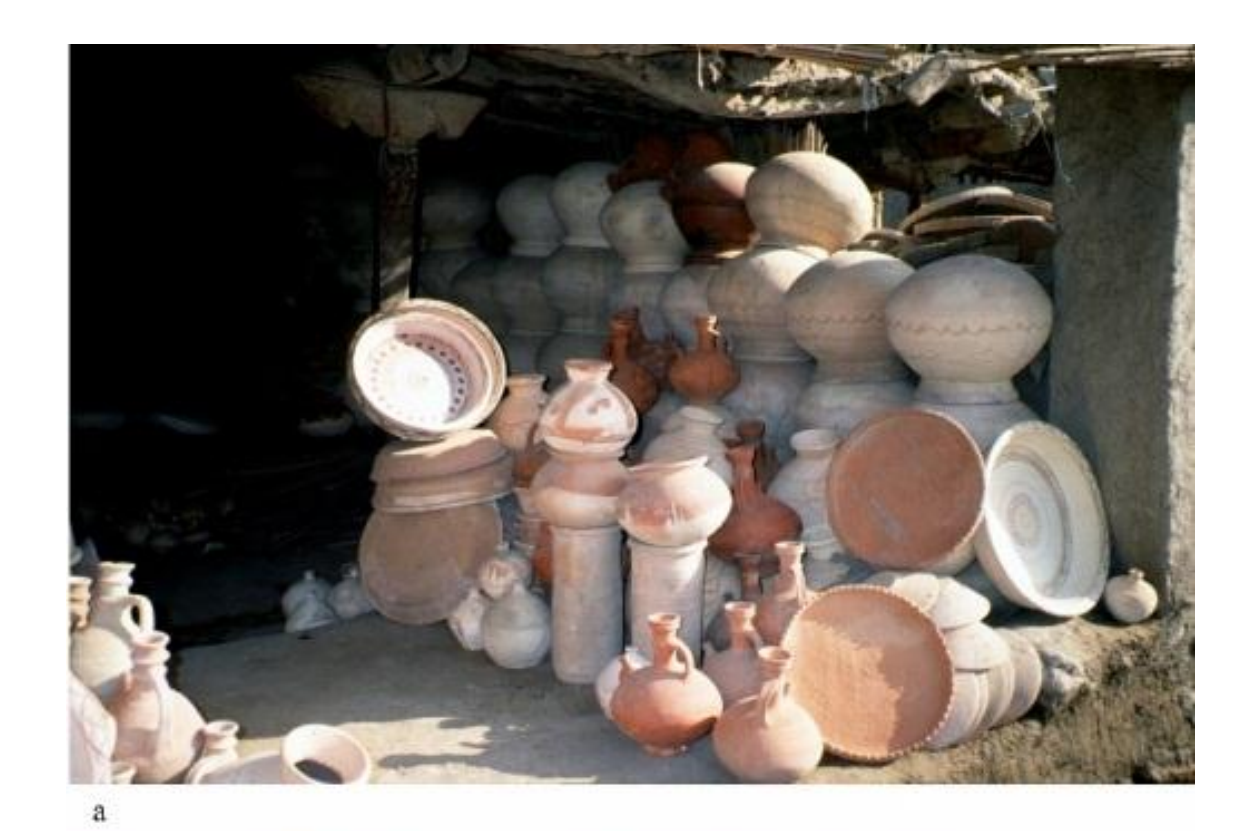
Figure 2. Some products of the Bannu potters' workshops: (a): a range of pots on sale in the pottery bazaar, outside the old Railway Gate in Bannu City, and (b) the range of ceramic wares produced by Umar Khan's workshop in the village of Mandeo: (i) globular water jar (matteya), (ii) water pitcher (garrai); (iii) small narrow-necked cooking pot (dagai); (iv) spouted water vessel (keeza); (v) shallow flat-bottomed dishes (kundail) for mixing and shaping flat bread (roti/chappati); (vi) round-bottomed serving dish (kunali); (vii) milling bowl (braghiyeh); (viii) pounding vessel for spices (batāl); (ix) handled cups (gadiwa); (x) 'moated' water vessel (tasht), for providing water to chickens or keeping food safe from ants; (xi) lid (barghala), produced in various sizes to fit cooking and water storage vessels; (xii) flat tray (thaiba), see also Figure 3a, b, & c. [The photographic images here and in all subsequent Figures are by Kenneth D. Thomas].