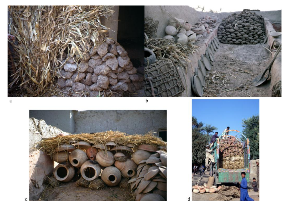
Figure 6. (a) Firing of kilns is usually started using dried maize stalks or straw from the processing of the rice crop, while the main heat is provided by burning dung cakes (made from mixing water buffalo dung with chopped straw and chaff and dried in the sun); (b) dung cakes are made and stored throughout the non-firing season (they are also an important fuel for cooking); (c) a layer of dung cakes is placed on the bottom of the kiln, with the dried pots carefully stacked on top, with bits of dung cake packed in the spaces; flat dishes are placed on the top, covered by a layer of straw (note: this has been partially reconstructed as a demonstration for us, using already fired pots); (d) fired pots are usually packed onto the back of a lorry for transport to the main sales outlets (mostly in the pottery bazaar in Bannu City (Figure 2a).