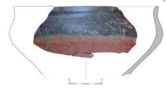
An Askos-type vessel from Radovanu-La Muscalu, Romania Cristian Eduard Ștefan Page 6

Repair and curation of Late Neolithic three-coloured pots: Insights from the site of Pavlovac-Čukar, Southern Serhia Jasna Vuković Page 2