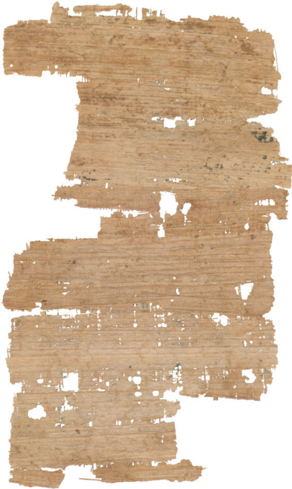
Fig. 2: P.Heid. inv. G. 809 verso.