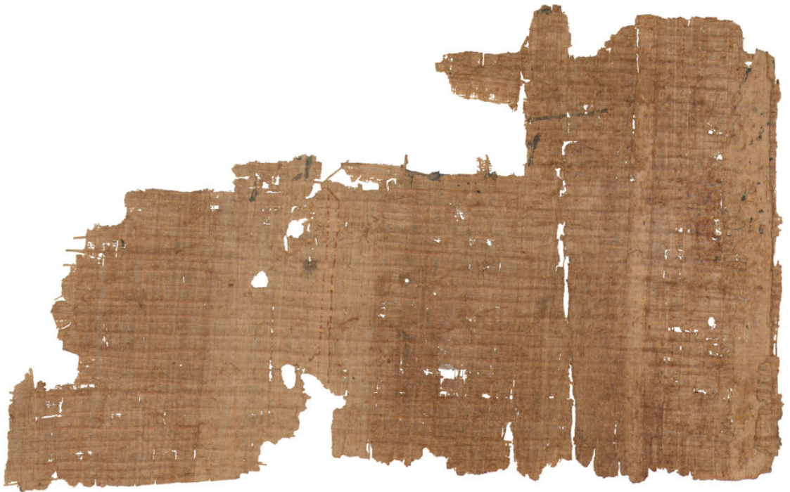
Fig. 4: P.Heid. inv. G. 175 verso.