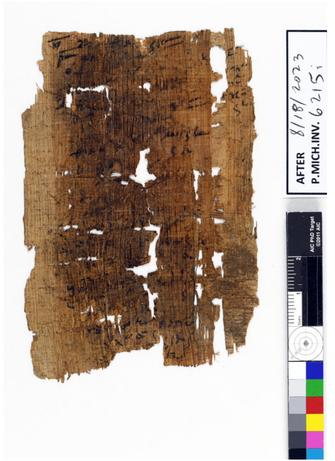
Fig. 2: P.Mich. inv. 6215i verso.